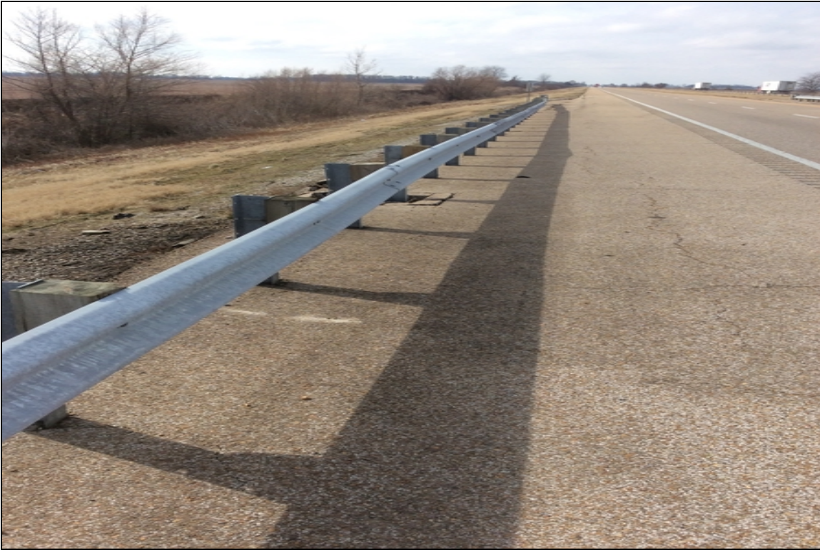
Approach Guardrail repair SE corner