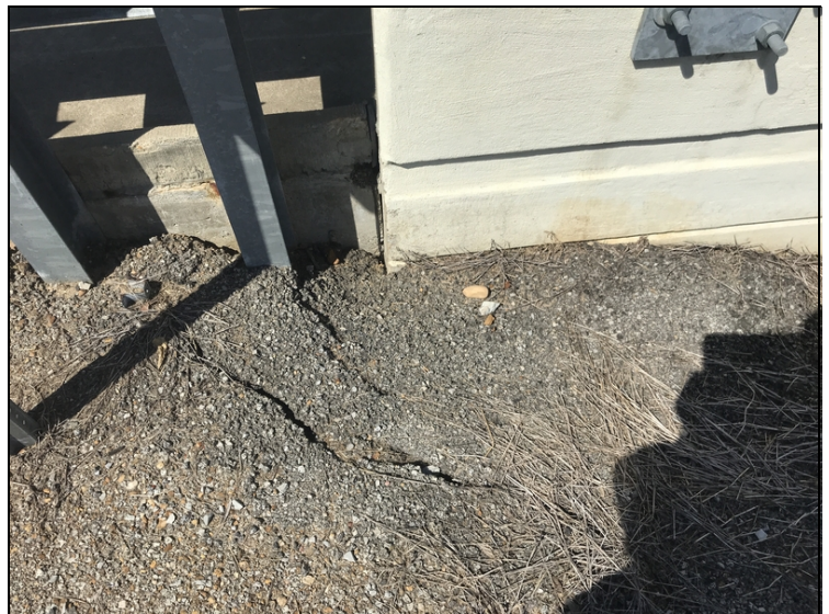
End bent 1 settling right side typical.