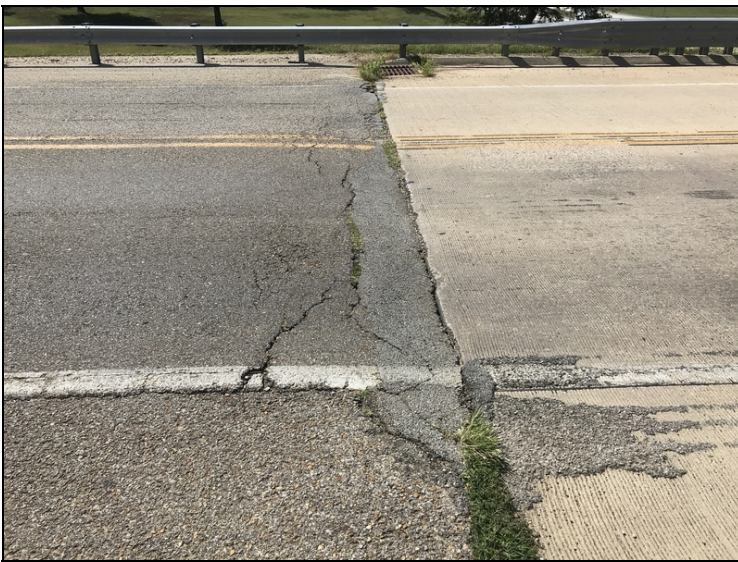
Bent 5 approach roadway