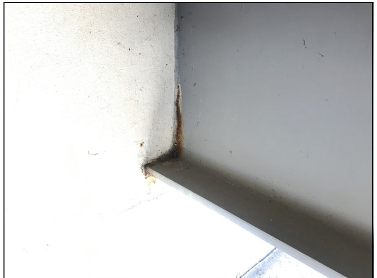
Span 4 bent 5 girder 5