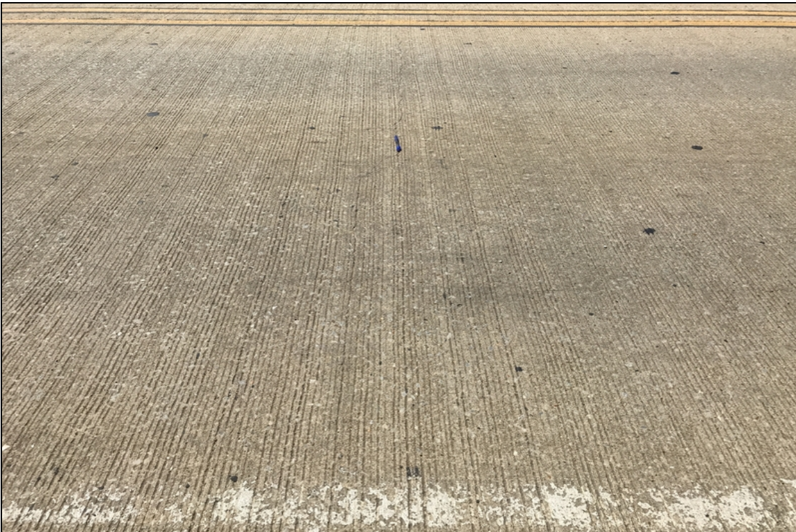
Transverse and longitudinal cracks