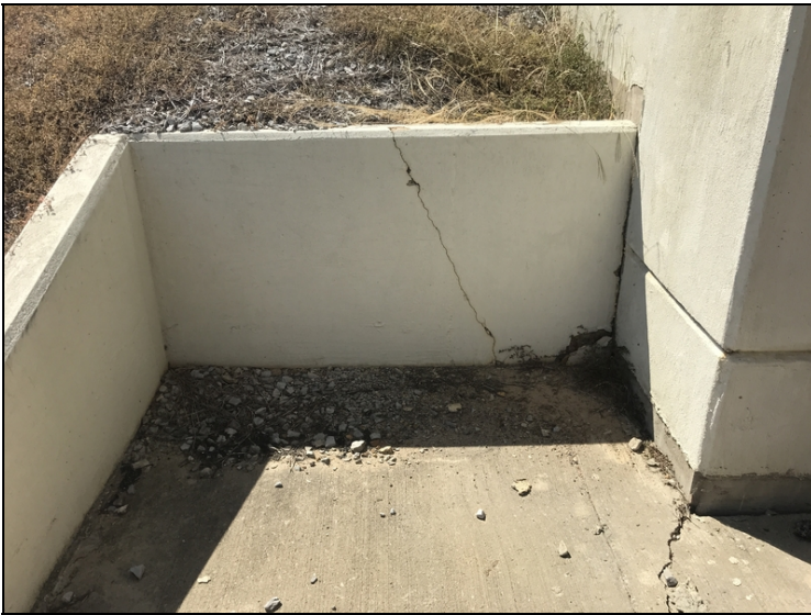
Span 1 bent 1 wing wall crack

Concrete slope paving has settled up to 5" at end bents.