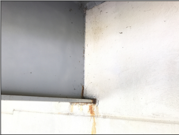
Span 4 bent 5 girder 3

Girders at bents 1 and 5 abutments have pack rust at bottom of web and bottom flange at connection to concrete diaphragm.