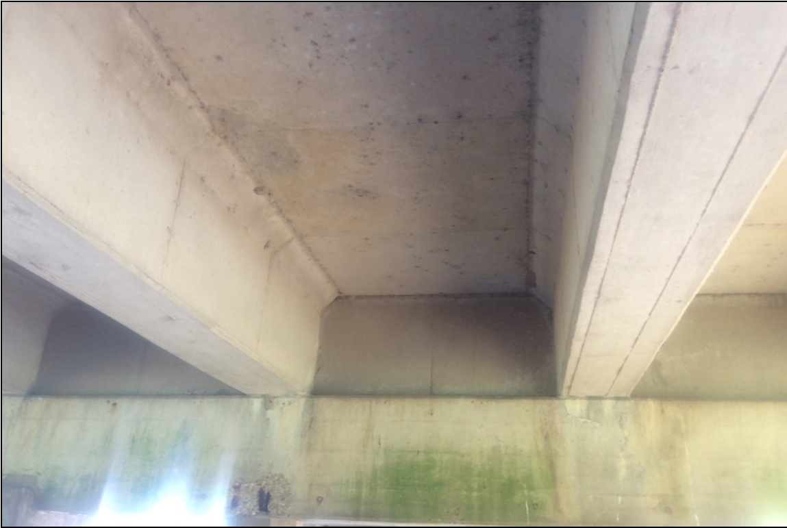
Underneath deck view