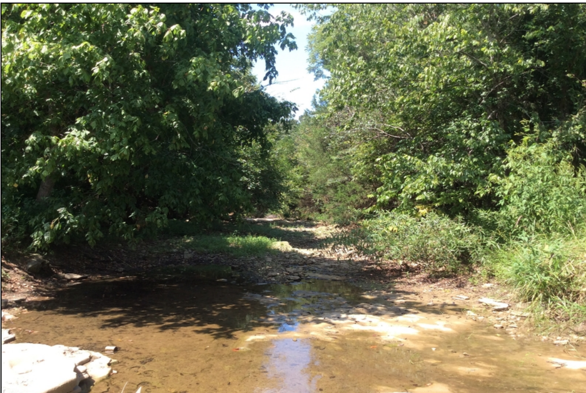
Channel view downstream