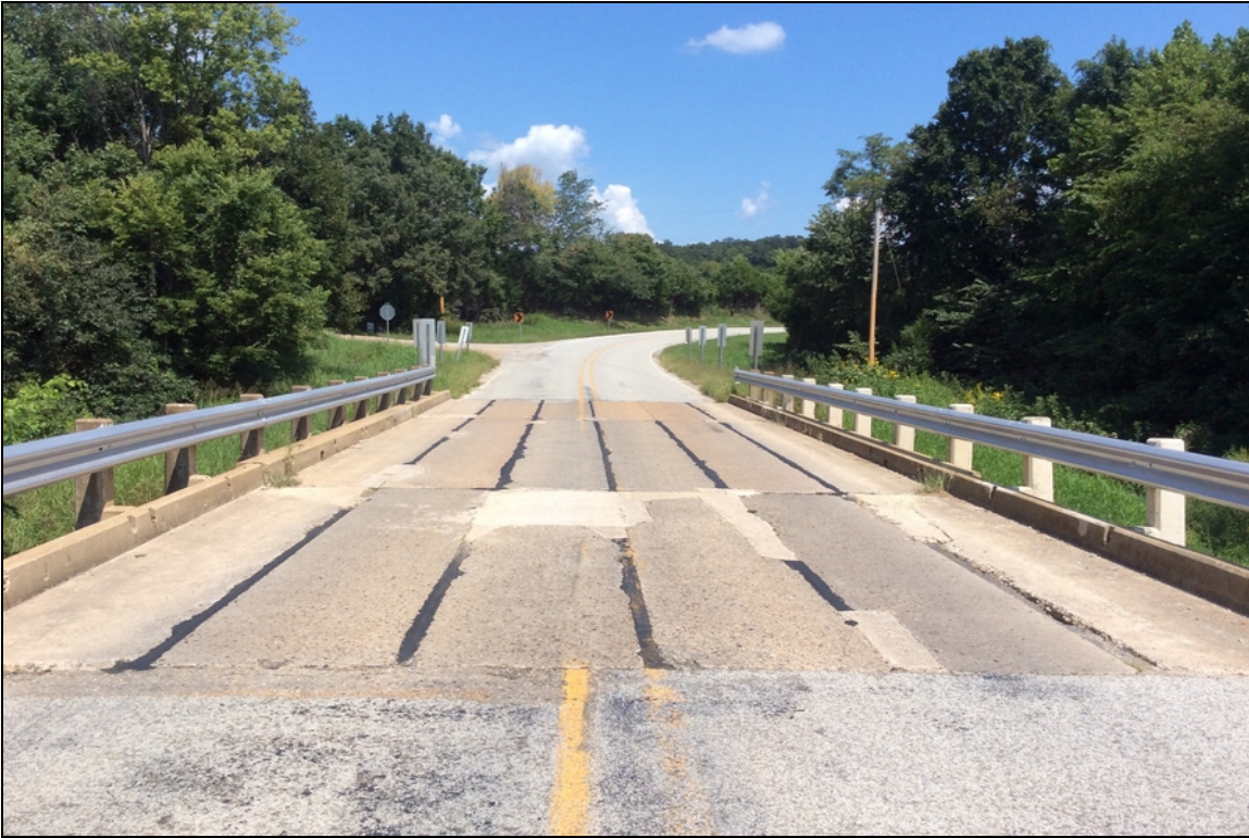
Approach with log mile