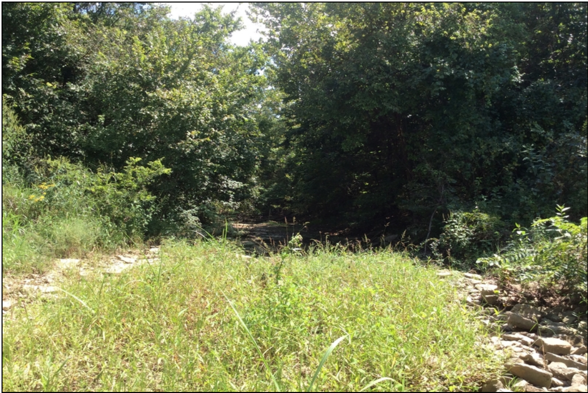
Channel view upstream