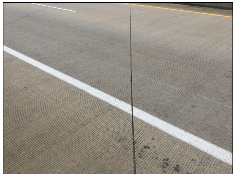
At bent 3 approximately 78' of missing sawn joints.