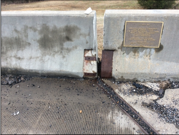
Slide Plate Missing on Rail at Abutment 4 Lt. Side.