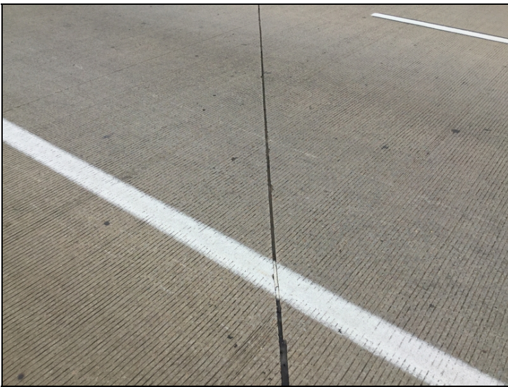
Sawn joints at bent 2 are missing in the right lane, approximately 47'

Missing sawn joint at bent 2 right lane Approximately 47'. Bent 3 has approximately 78' missing in both lanes.