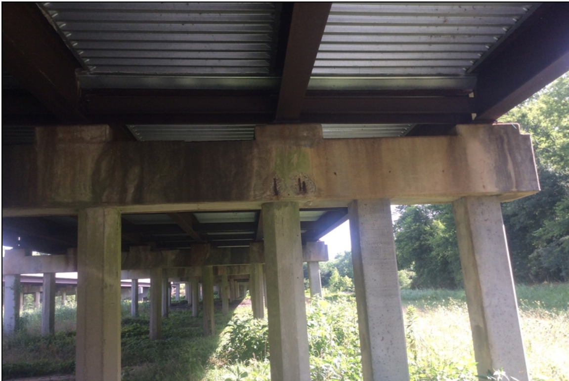
Bent 12 back, spall with exposed rebar