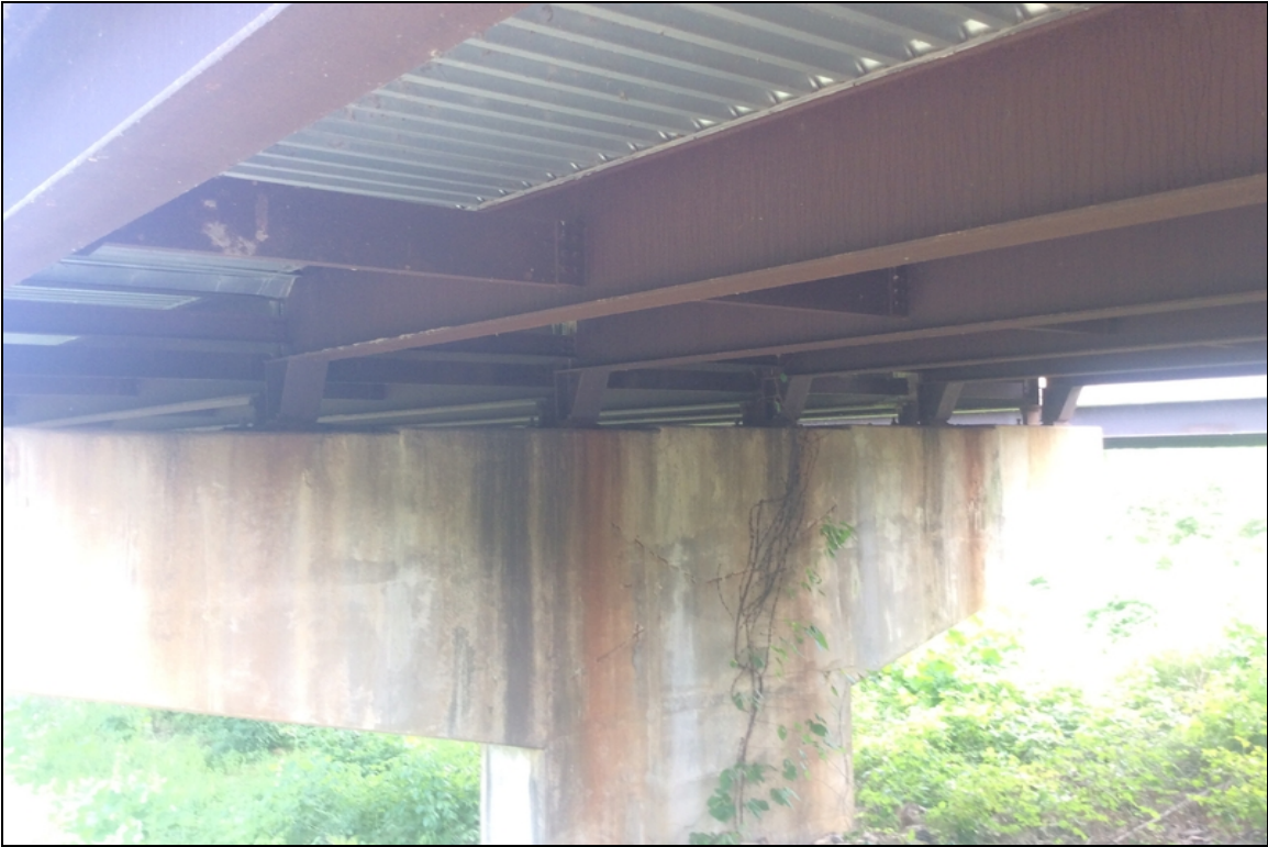
Bent 21 ahead, looking at the bearings.