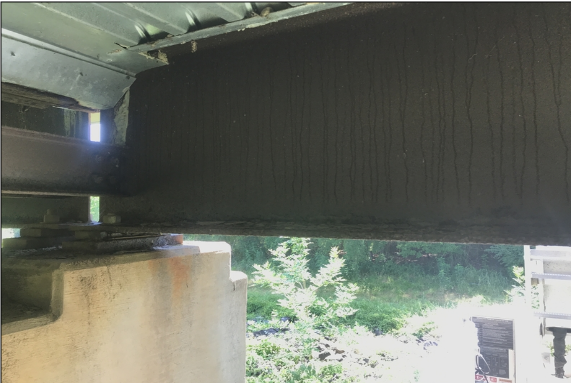
Span 15, bent 16, bottom flange and web flaking rust, 8'