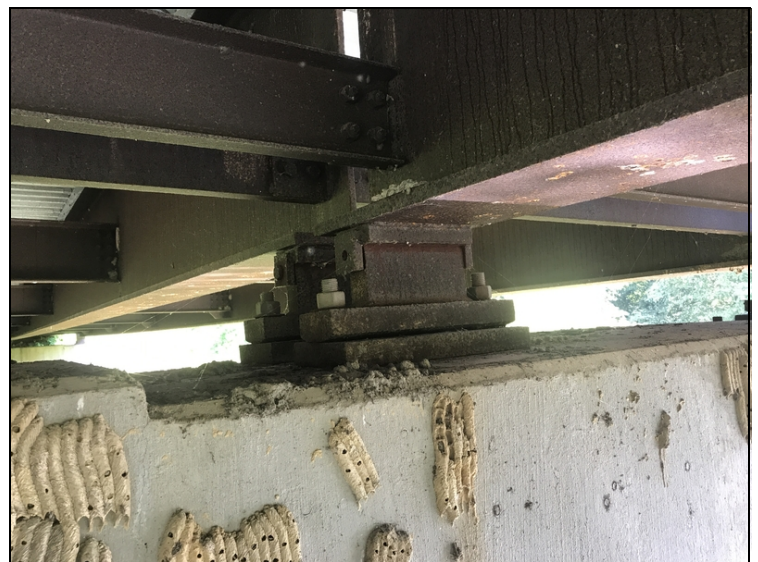
Bent 20, bearing 5 left side missing bearing bolt