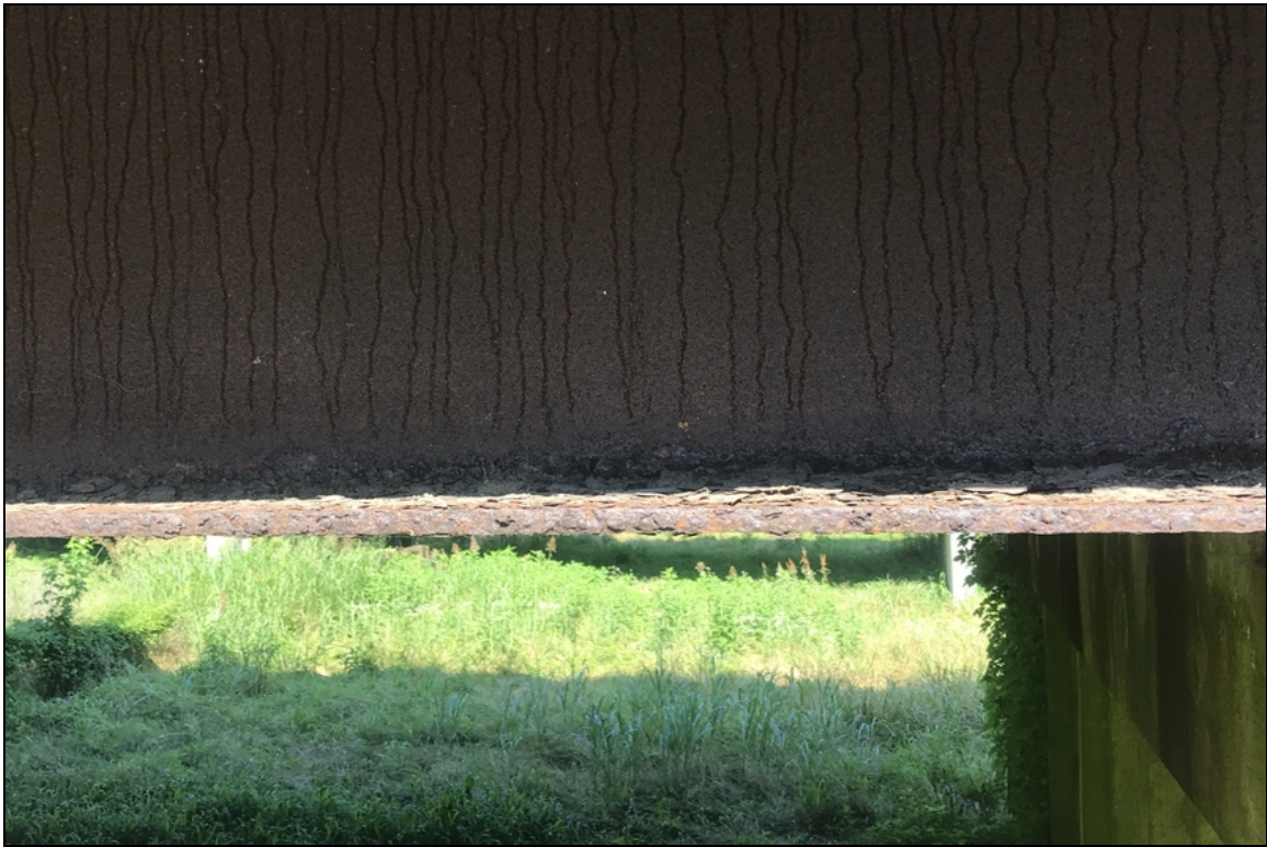
Span 2 beam 6, flaking rust