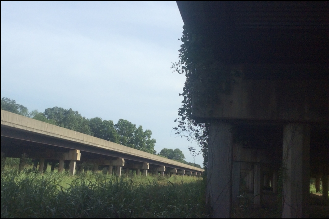
Bent 5 back, Lt. side has vegetation growing up on the cap & parapet rail.a