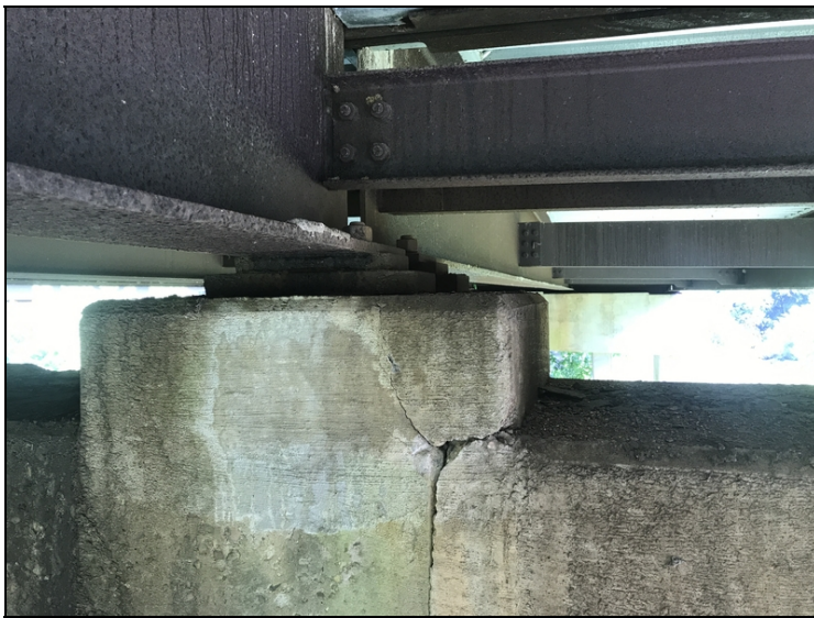
Span 16, bent 17, riser 5, crack in concrete, extending to anchor bolt

Span 16 bent 17, riser 5 has cracked extending to anchor bolt. Span 17 bent 17, riser 3 has cracked extending to anchor bolt.