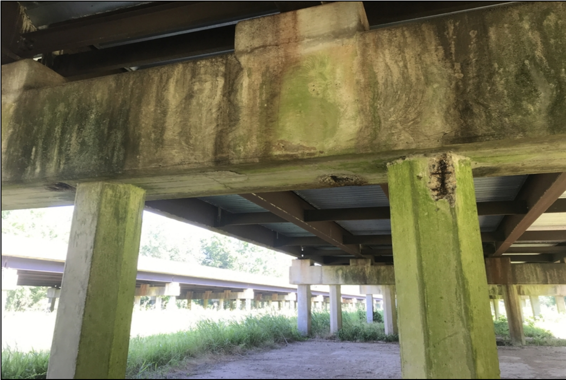
Bent 7 pile 4 spall with exposed rebar. And 4 spall with exposed rebar on bottom of cap.