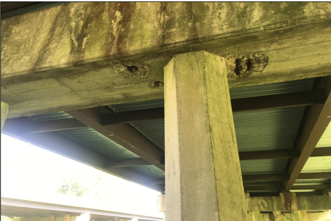
Bent 9 bottom of cap, exposed rebar