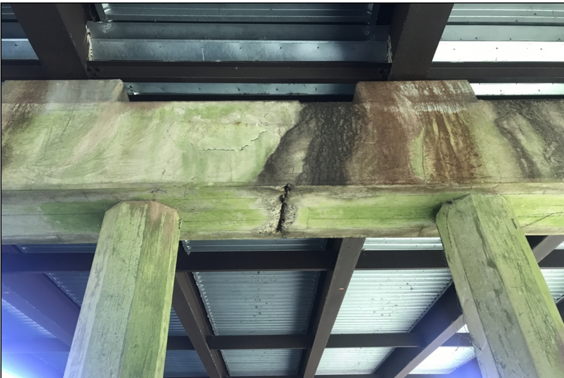
Bent 14 exposed rebar and delam, between piles 4 & 5