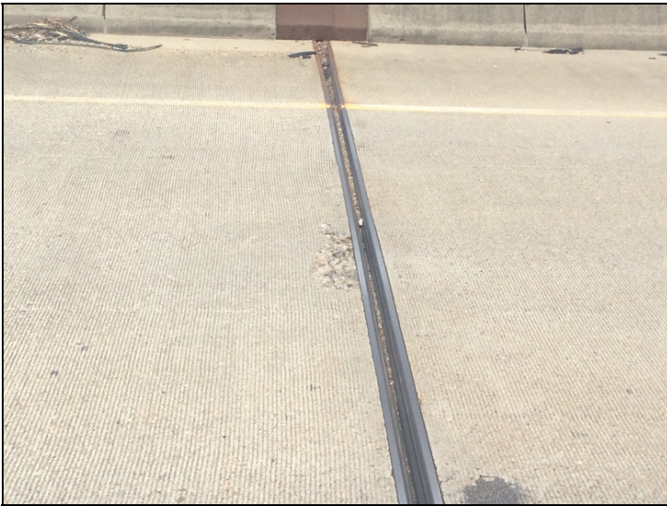
Span 19 @ bent 20 Rt. wheel path of Lt. Main lane has a (6" x 2') spall behind road iron.