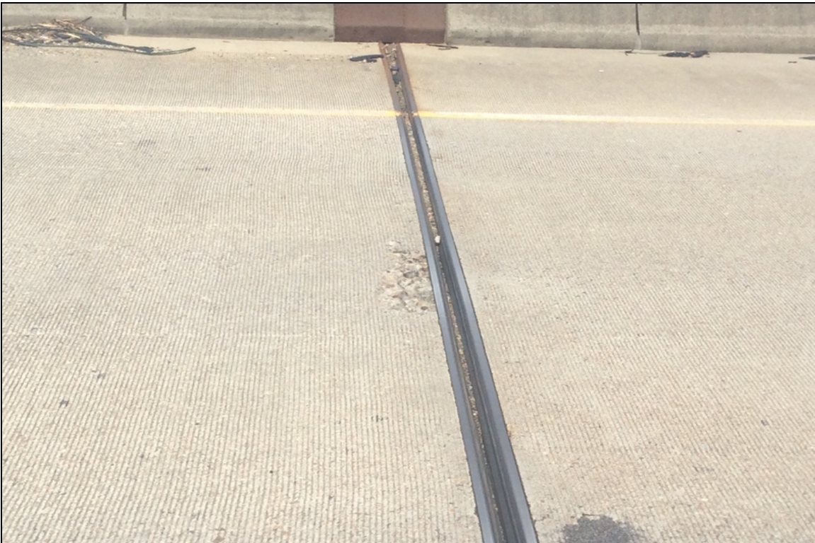
Span 19 @ bent 20 Rt. wheel path of Lt. Main lane has a (6" x 2') spall behind road iron.