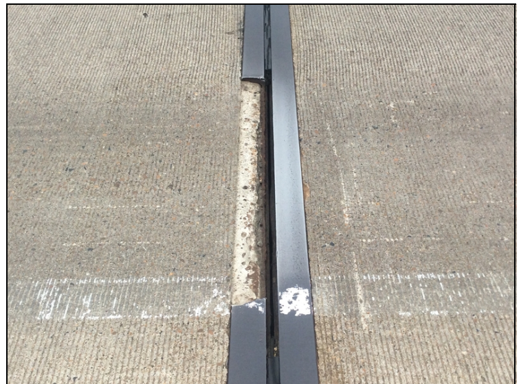
Bent 15, Rt. Mainlane 3' section of road iron is missing.