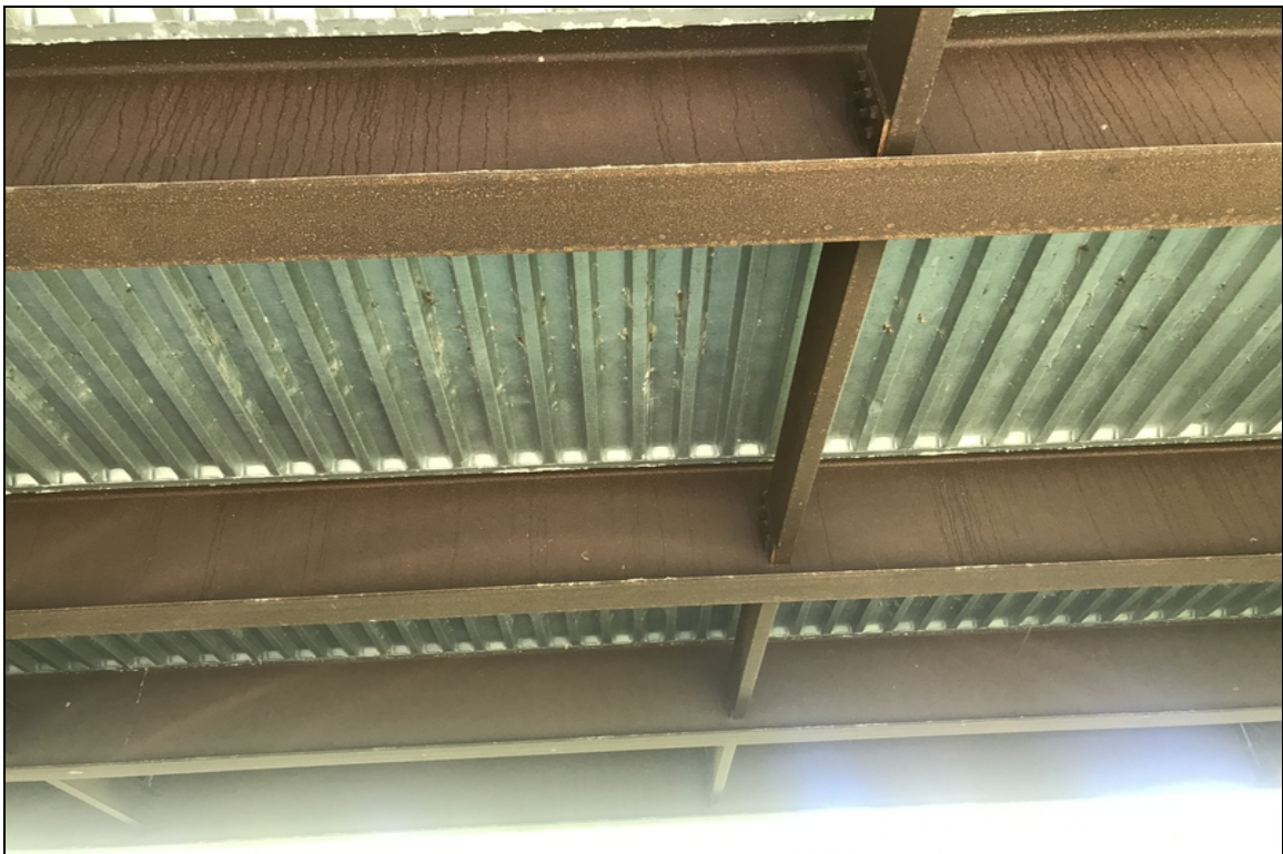
Soffit span 2