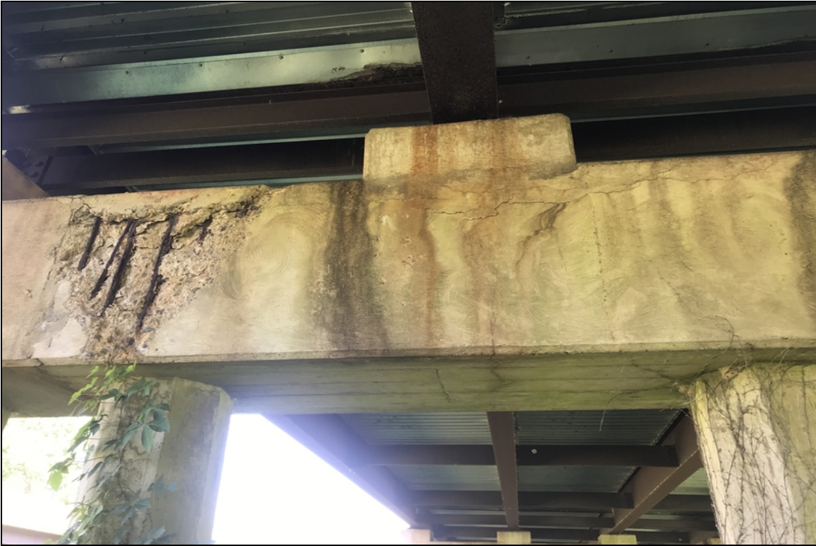
Bent 10, exposed rebar and crack 5' long