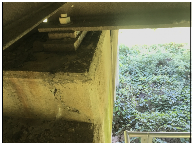
Bent 17, riser 3 cracked on 3 sides, extends to bolts.