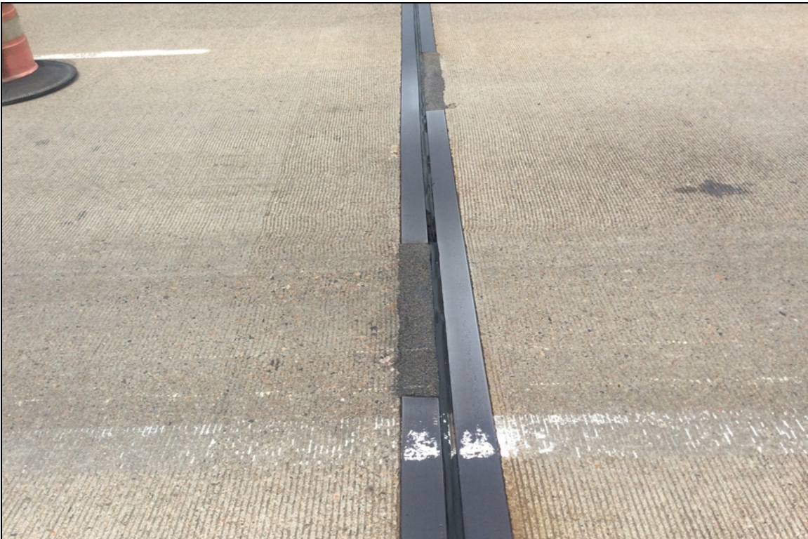
Bent 16 repair to missing sections of road iron.