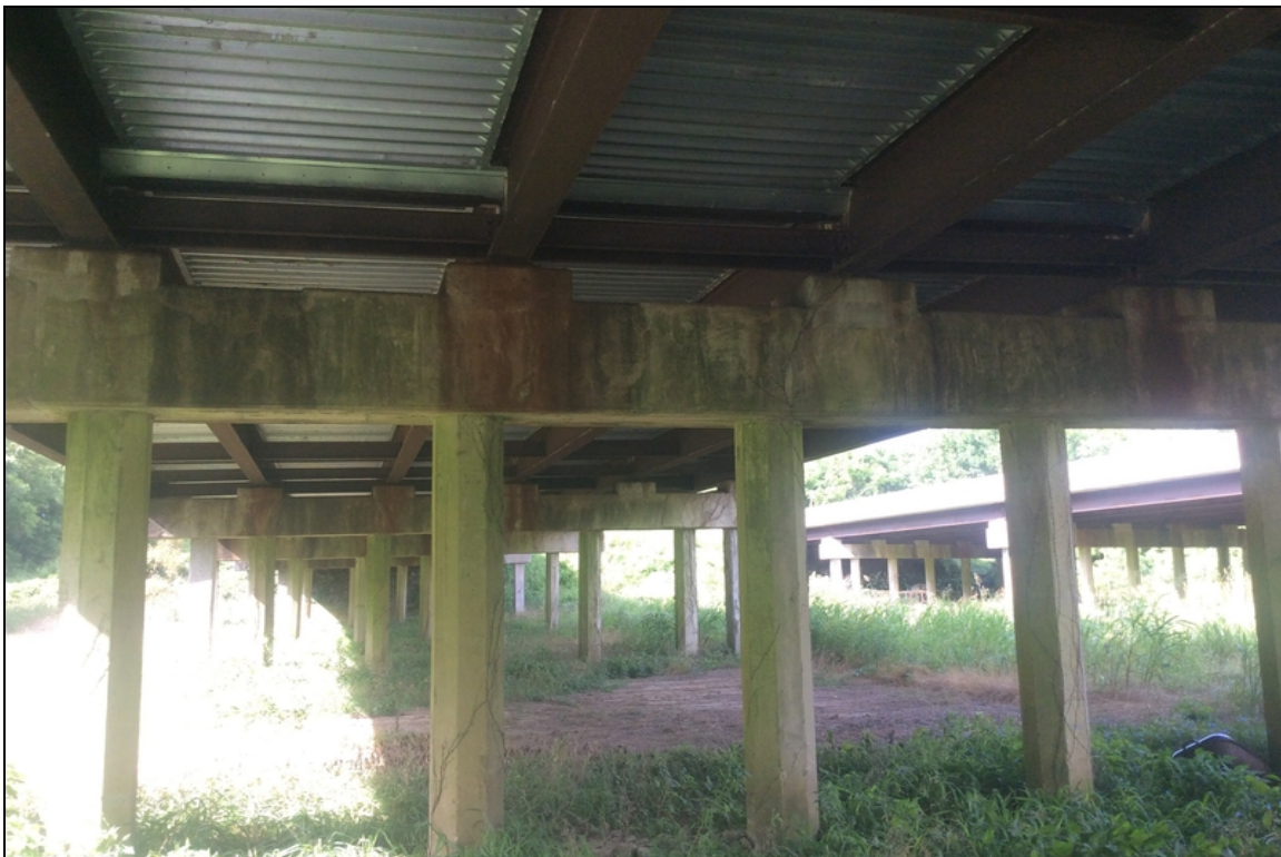
Bent 5 ahead, rust staining on caps below bearings, this is typical of several of the interior bearings on all caps.