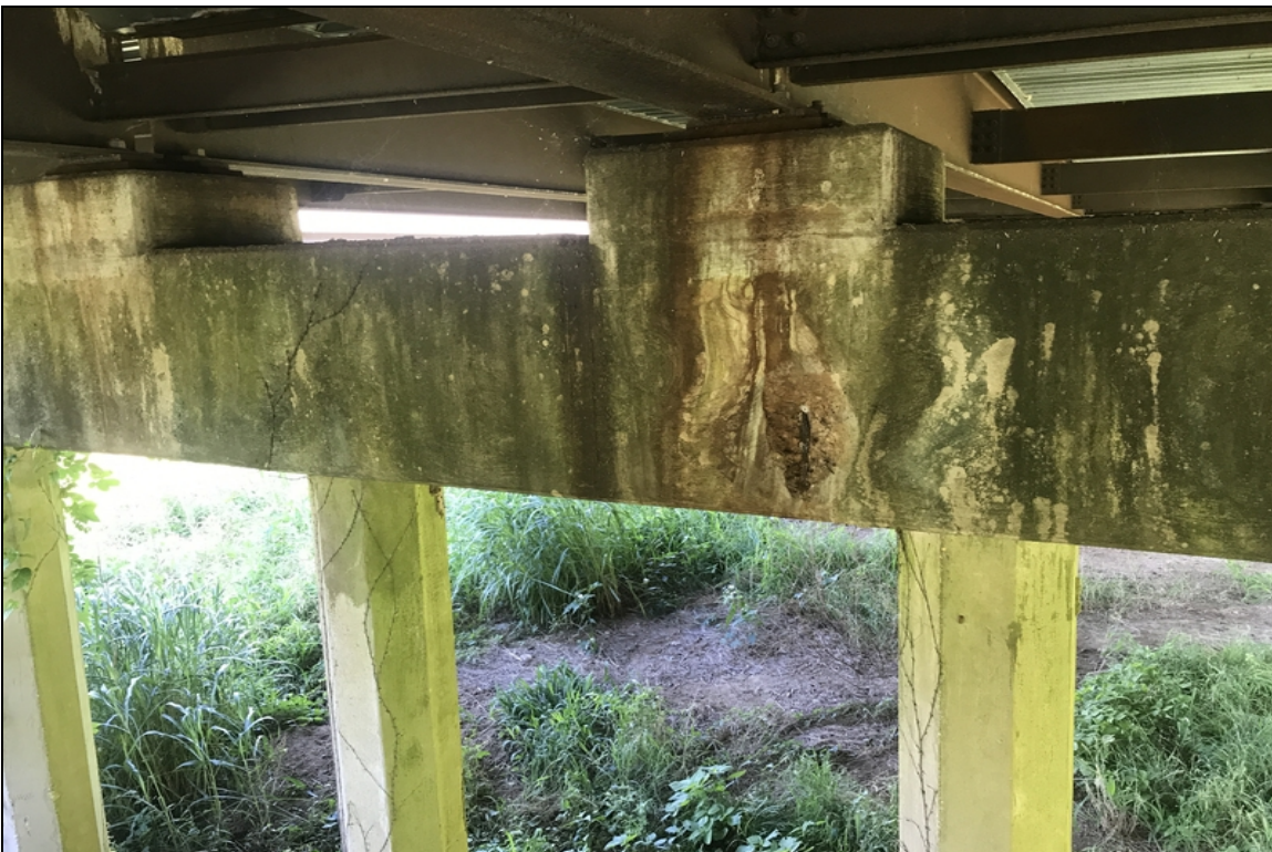
Bent 5, spall with exposed rebar between piles 3&4, backface.