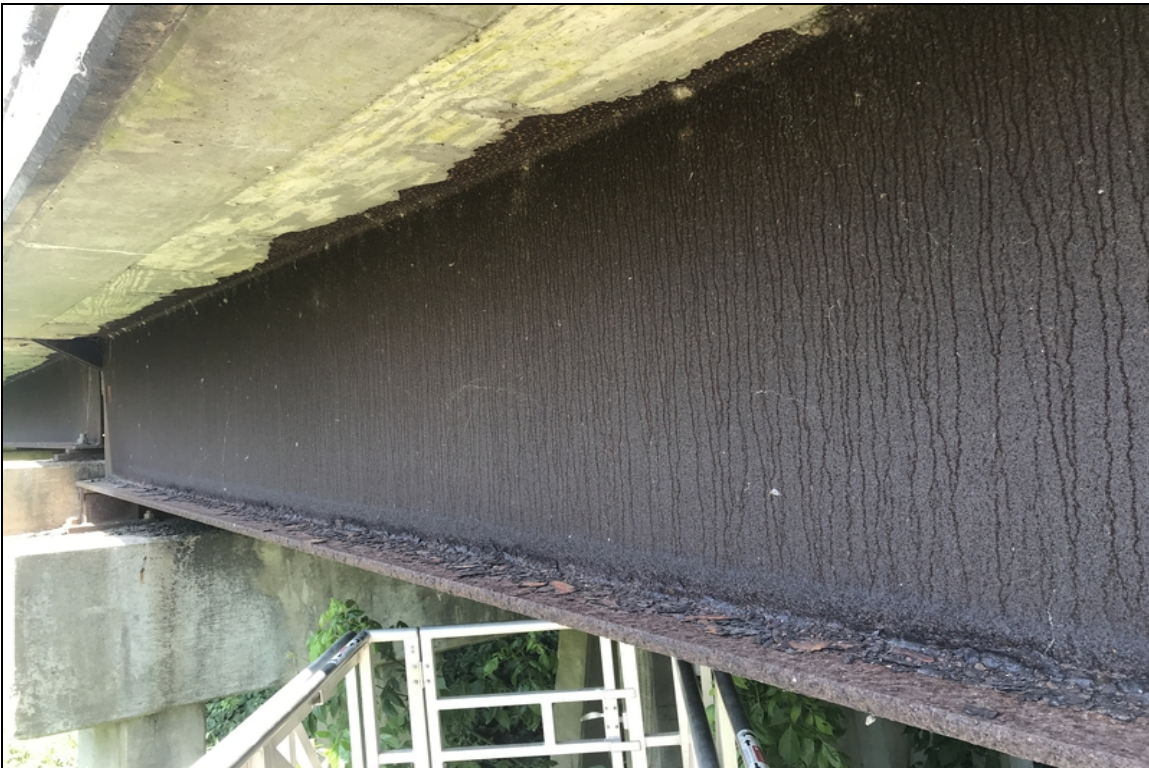
Span 18, beam 6, flaking rust, 20'