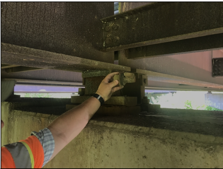
Bent 19, bearing 3, right bolt broke

Bent 19 bearing 3, missing right anchor bolt Bent 20 bearing 5, missing left bolt to top of bearing.