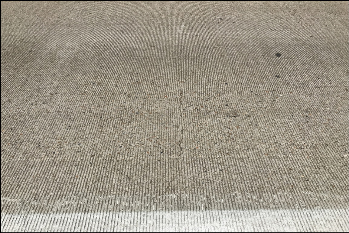
Typical transverse cracks, span 16