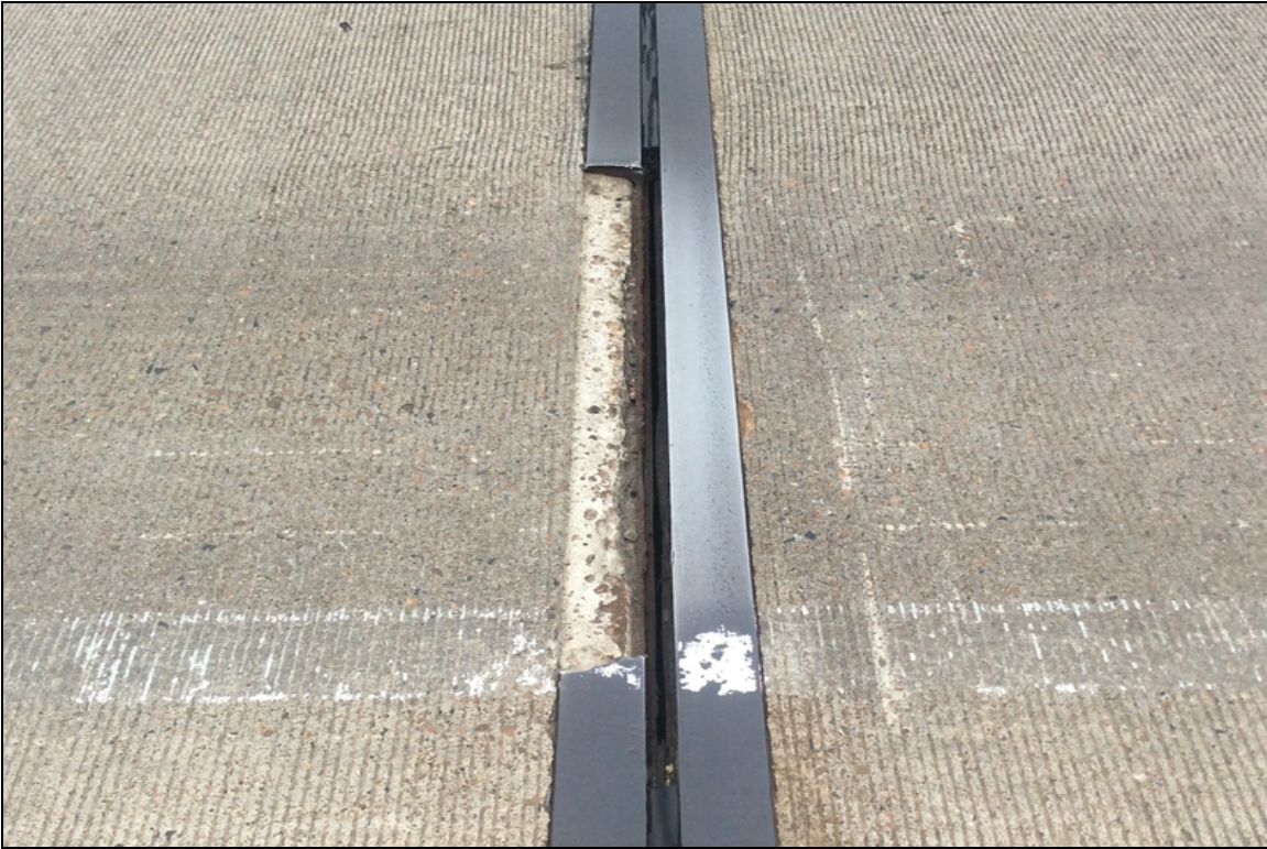
Bent 15, Rt. Mainlane 3' section of road iron is missing.