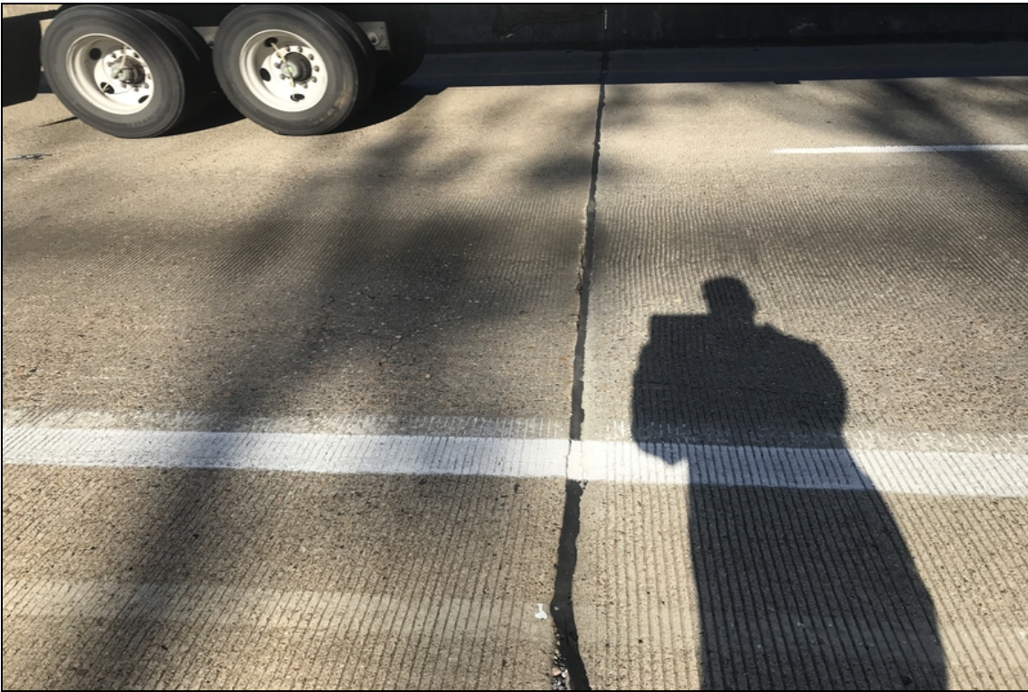
Joint 3, seal torn and loss of bond.