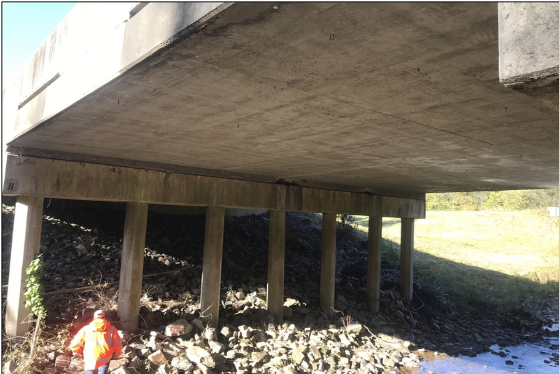
Bent 2 span 2