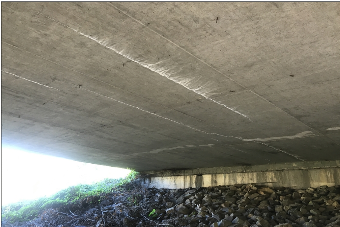
Soffit span 3