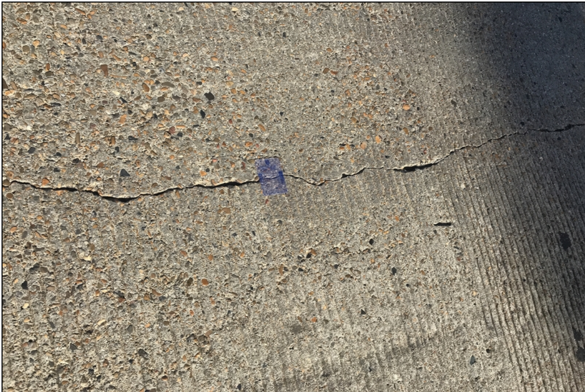
Longitudinal deck cracks, all span, 0.060-0.070