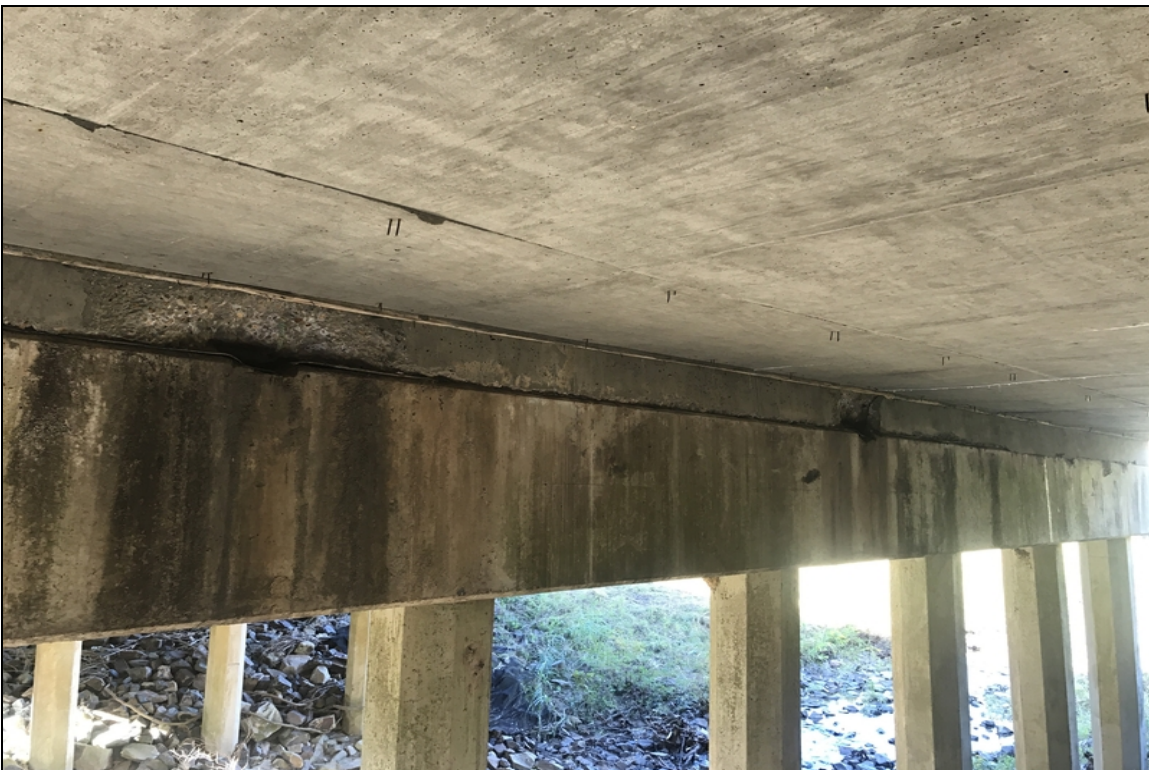
Spalls over bent 3 cap