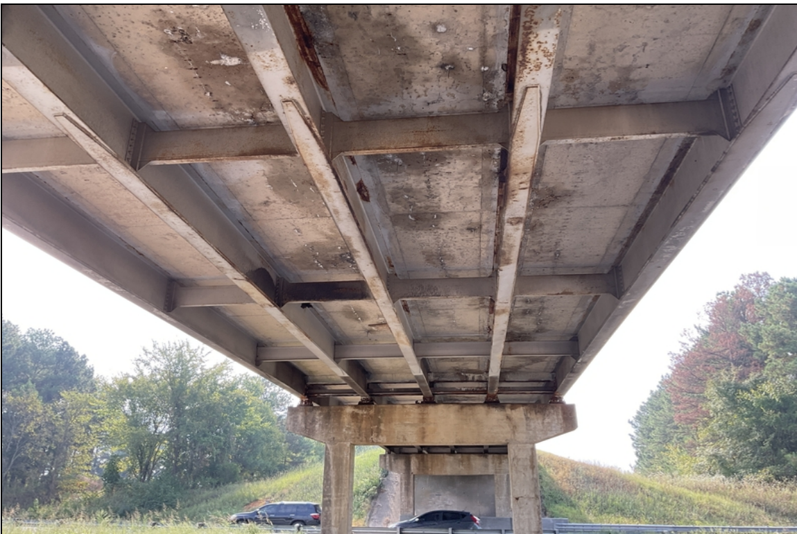
Soffit span 3