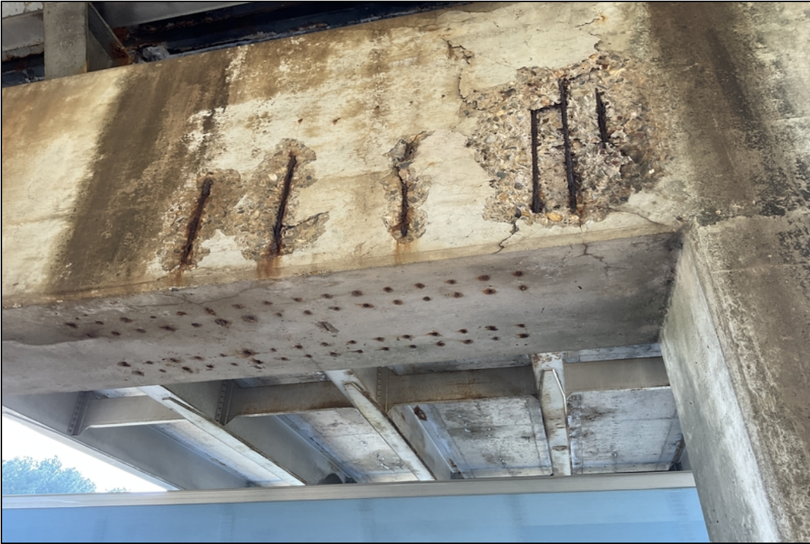
Spall cap bent 4 back