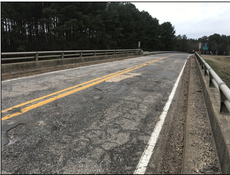
Deck spalls spans 3 and 4