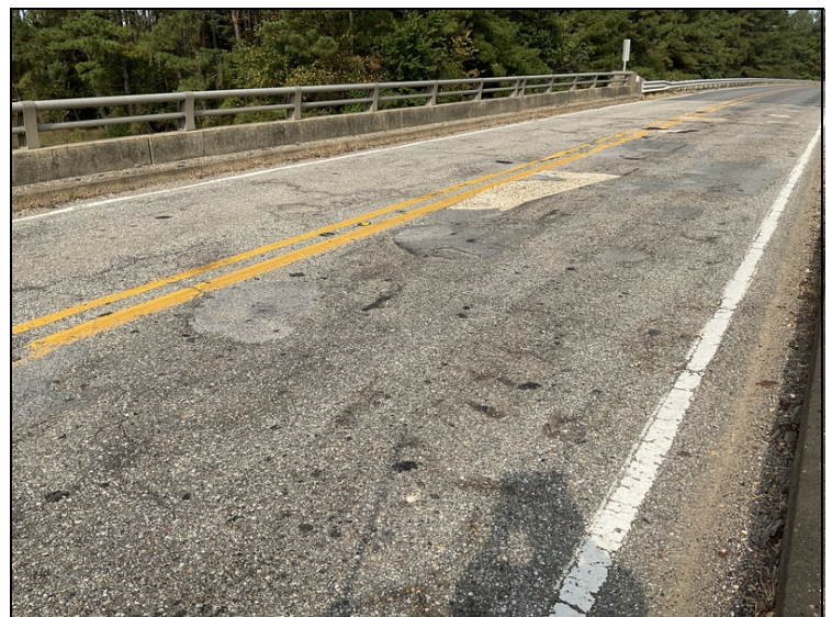
Deck span 3