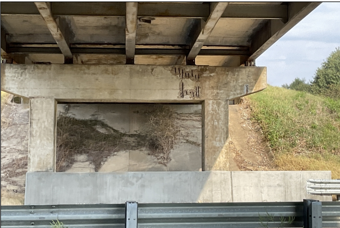
Spall bent 4 cap ahead side