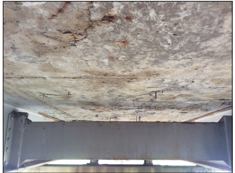
Deck Soffit span 1, between girders 3 & 4, looking ahead.