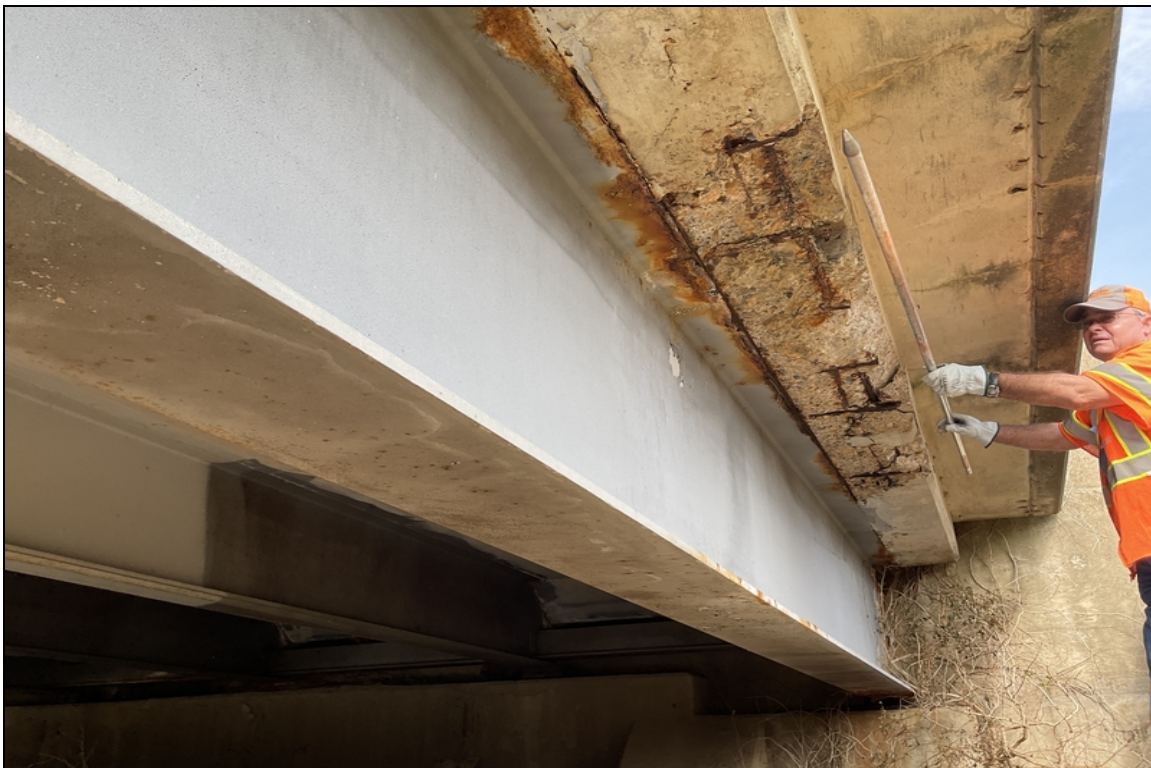
Spall in curb right side span 4