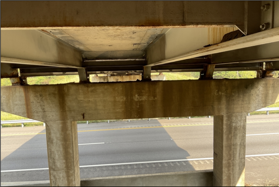
Bent 2 bearings pack rust