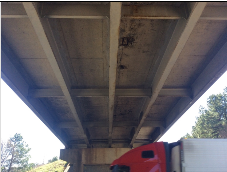
Soffit span 2, looking back between girders 2 & 3 @ spall and delamn.

Repaired by State Forces. 08/21/2021 JPR -- the repairs that were made and completed were deck spalls, on spans 1 & 2. There are still some spalls on both spans that have been patched with cold mix.