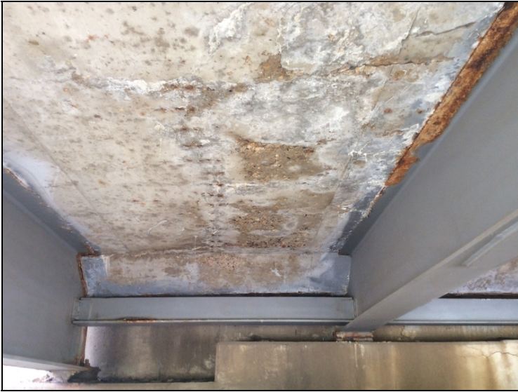
Deck Soffit between girders 4 & 5 looking back.