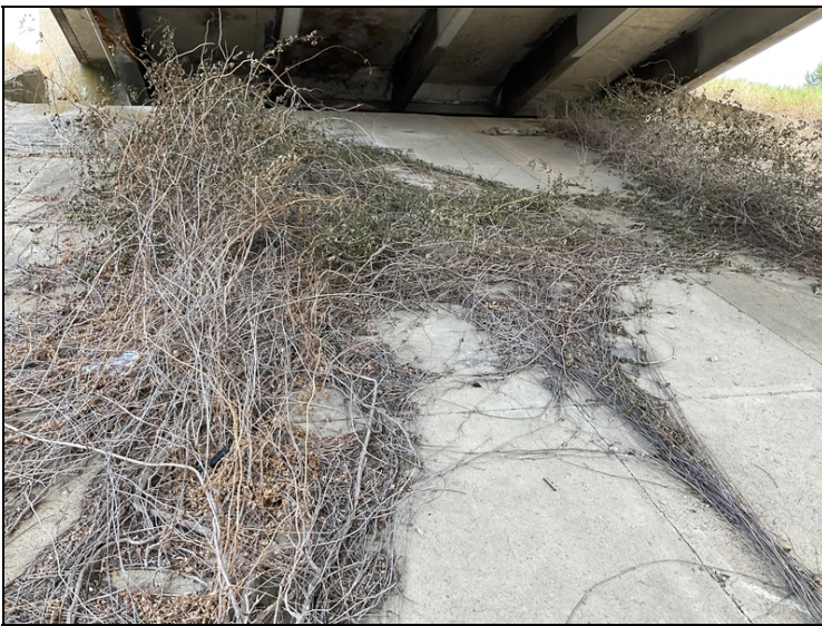
Vegetation abutment 2 slope