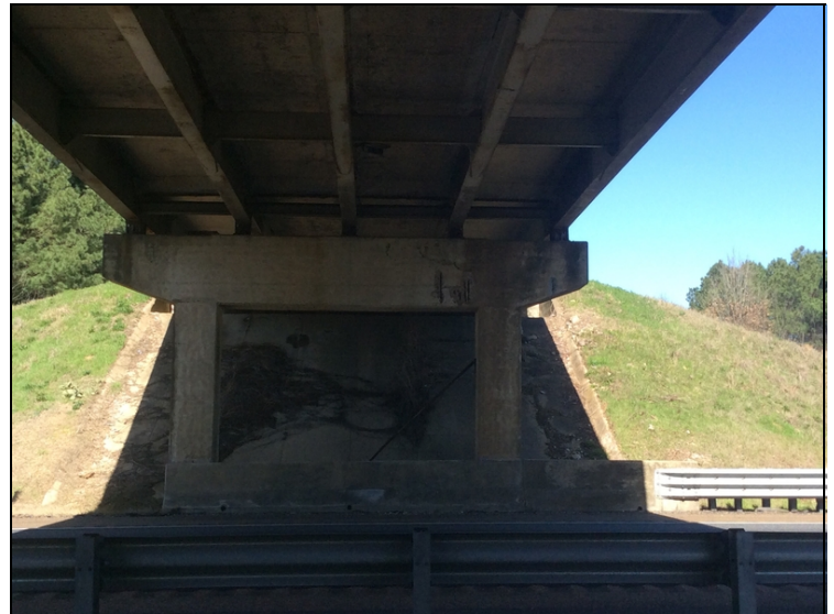
Bent 3 cap spalled