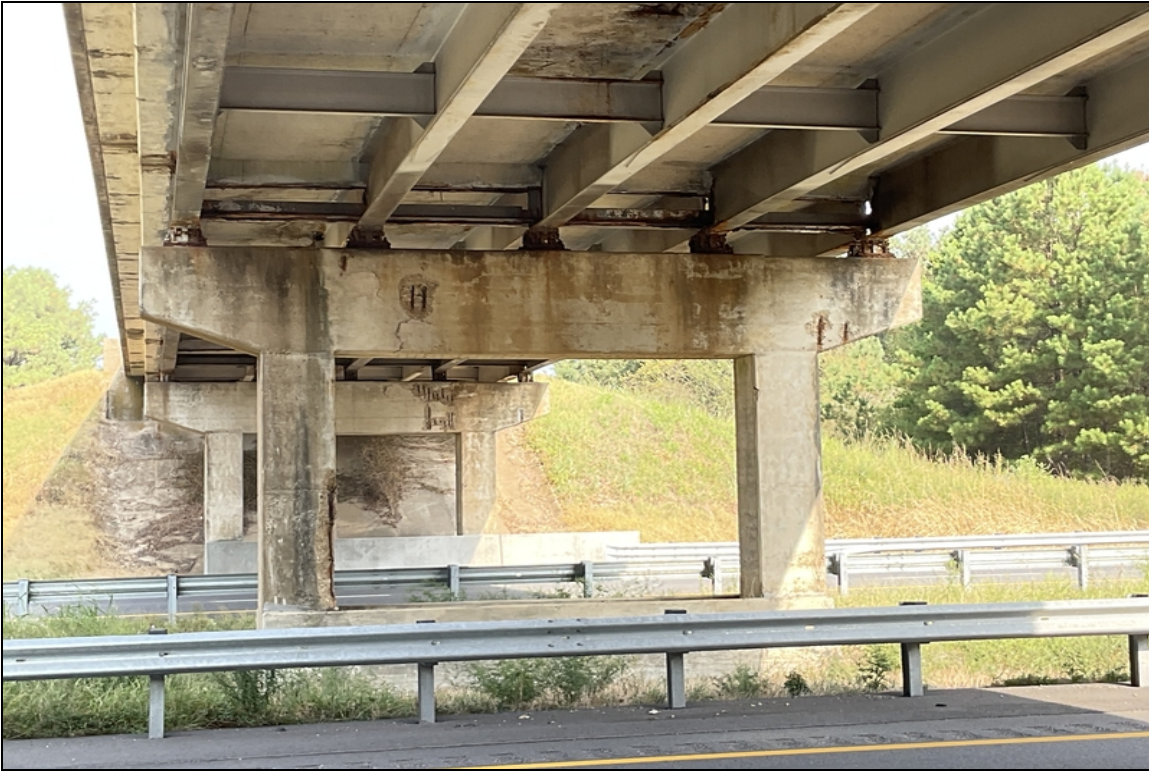
Bent 3 cap spalled and bearings have pack rust