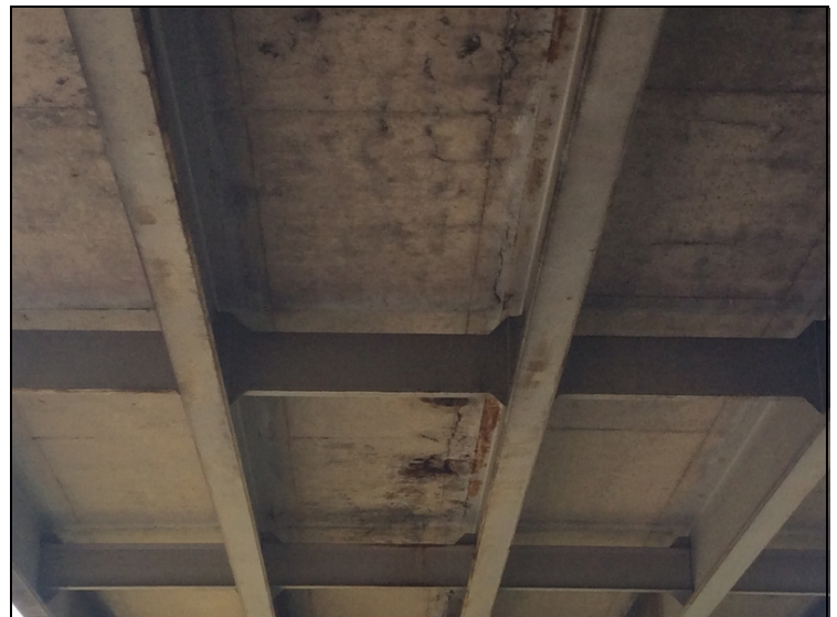
Deck Soffit, Span 2 over EB travel lanes, between girders 2 & 3, has numerous cracks with efflorescence & some spalls with exposed steel.