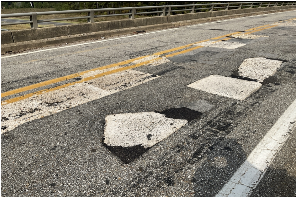
Deck span 1