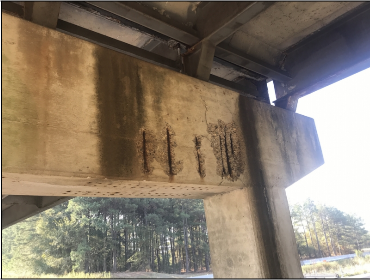
Bent 4, ahead side spall with exposed rebar.