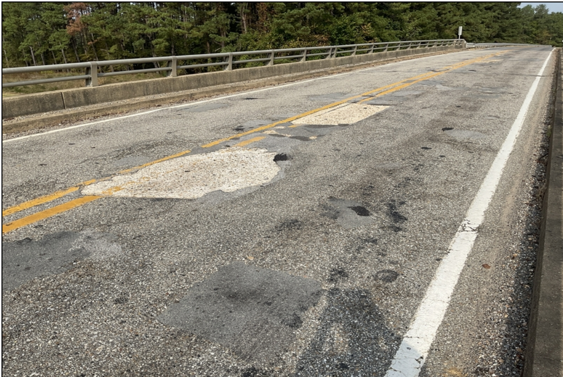
Deck span 2