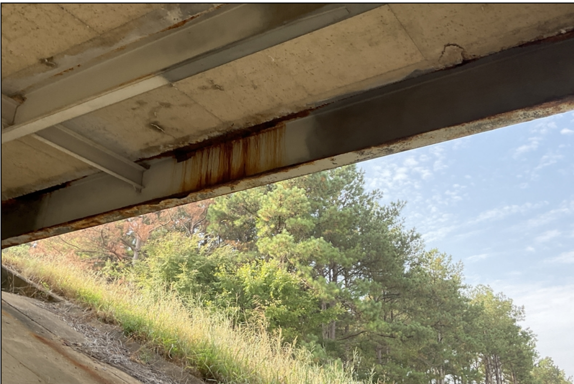
Span 1 girder 1 pack rust with section loss