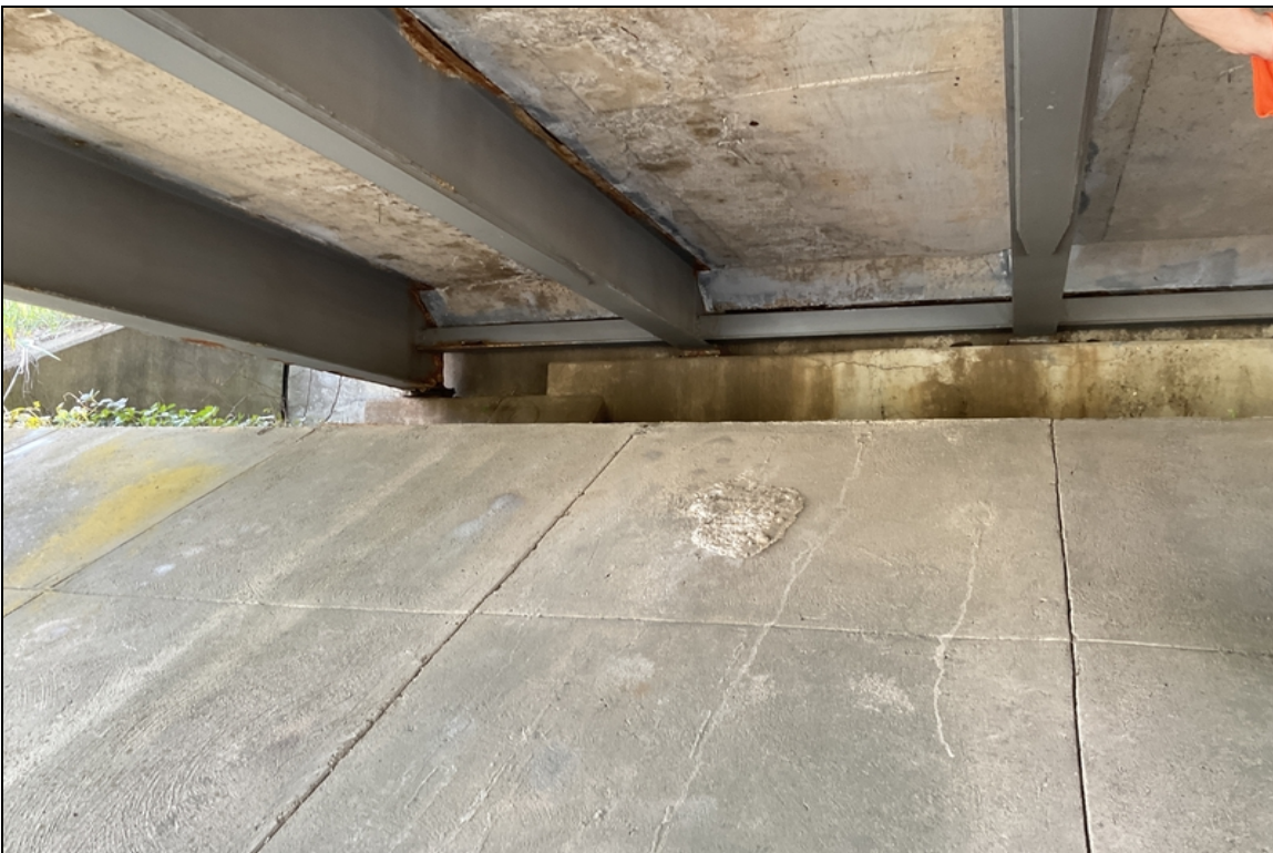
Abutment 1 bearings 3 4 and 5