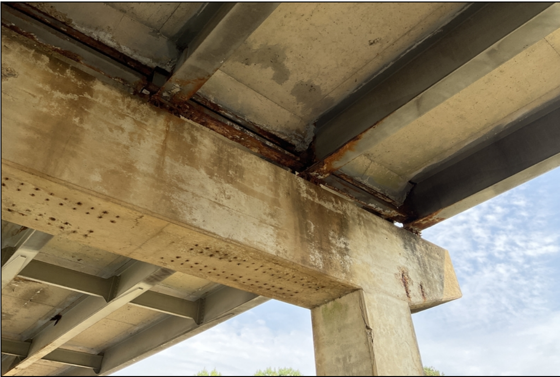
Span 2 girder ends pack rust