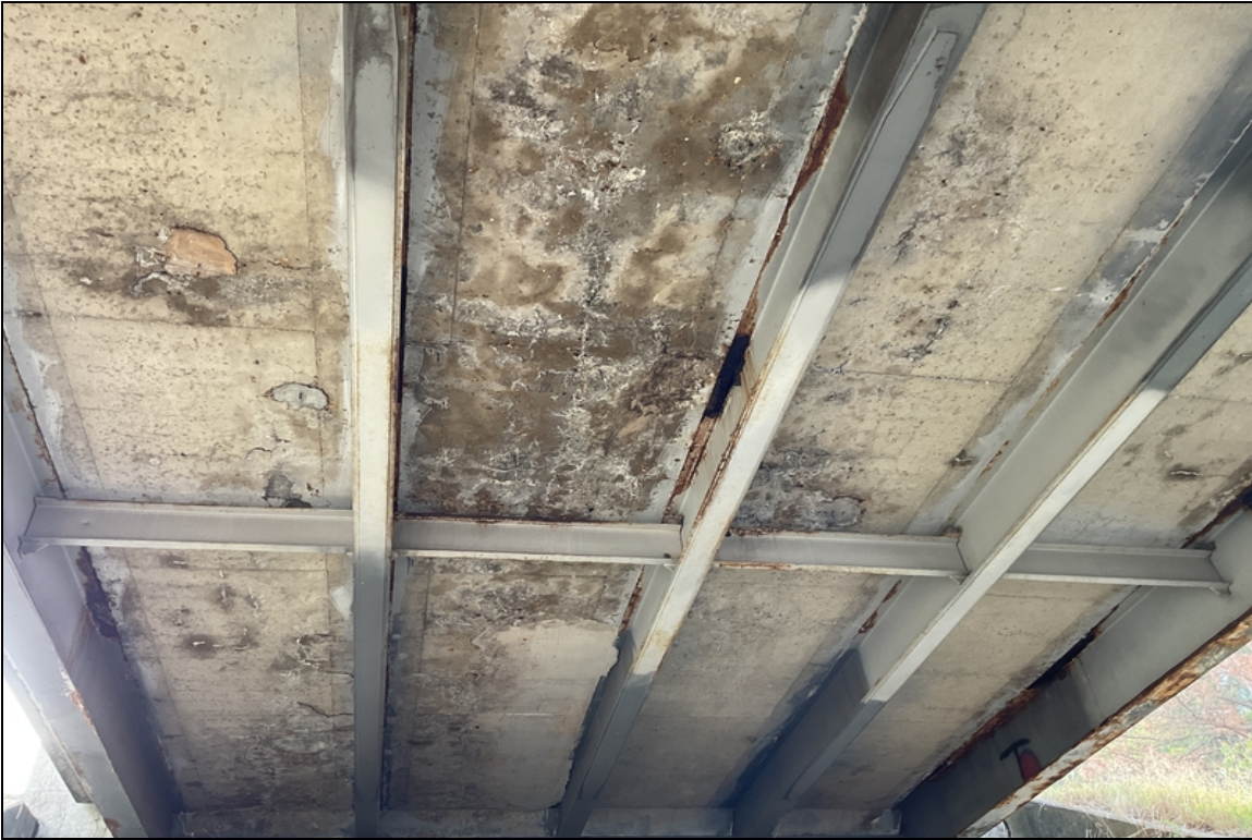
Soffit span 1