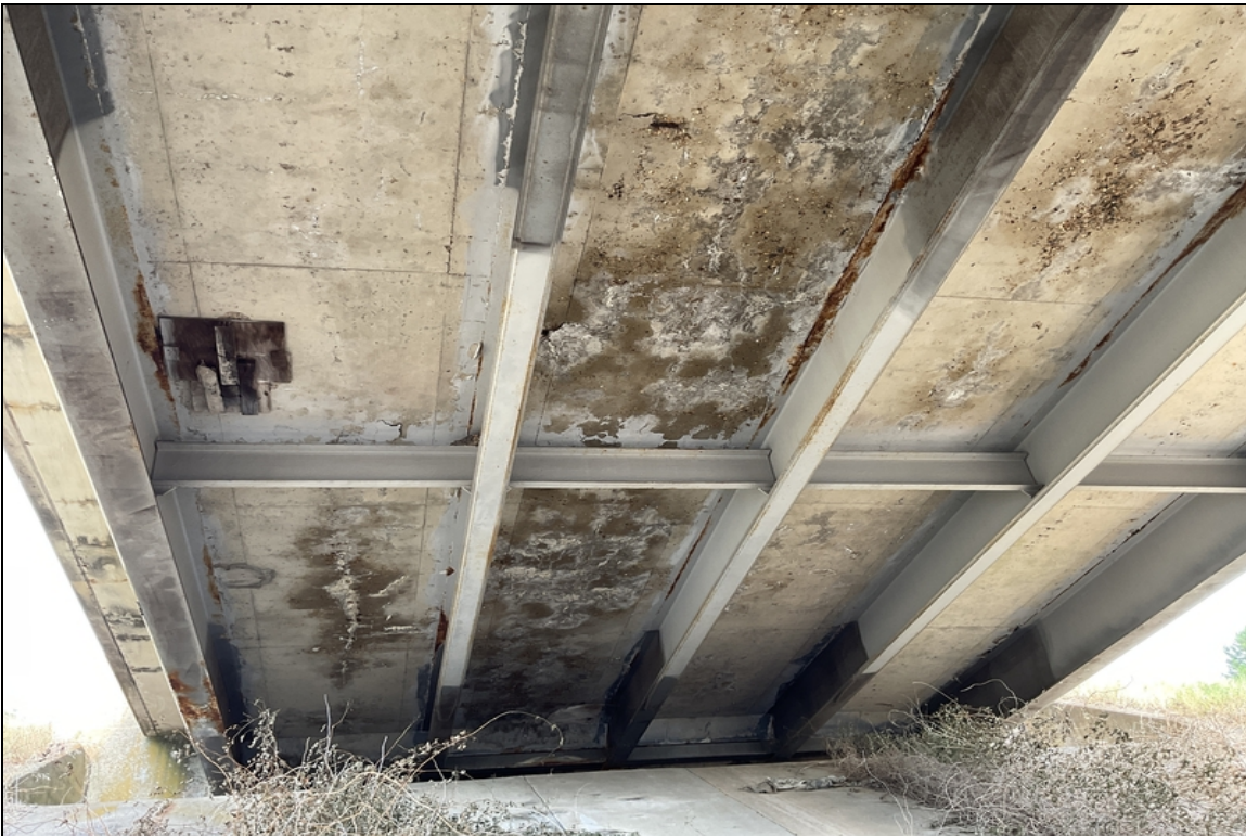
Soffit span 4