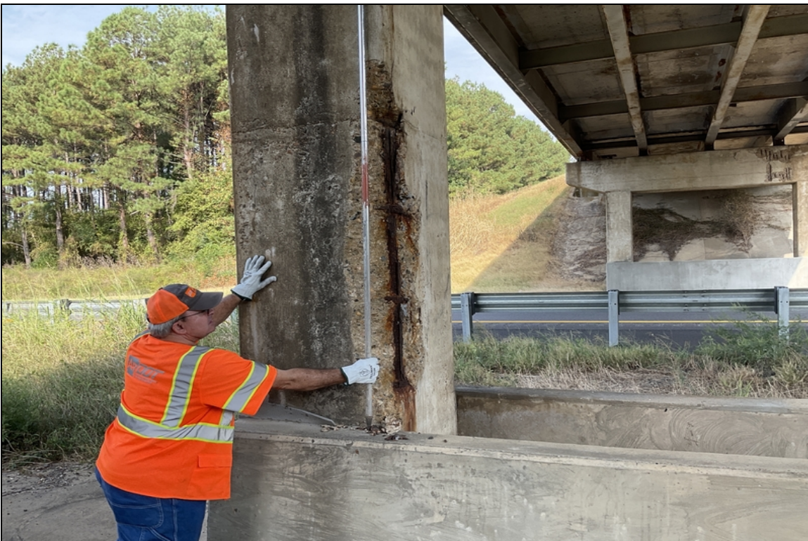
Spall bent 3 column 1