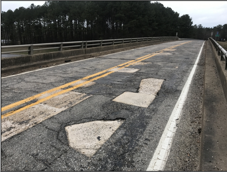
Deck spalls spans 1 and 2

Team Lead: John Parks Inspection Date: September 06, 2022