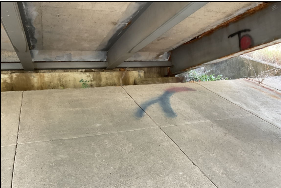
Abutment 1 bearings 1 and 2