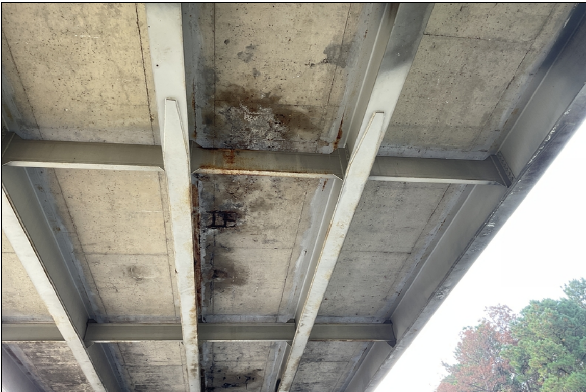
Soffit span 2 spalls cracks