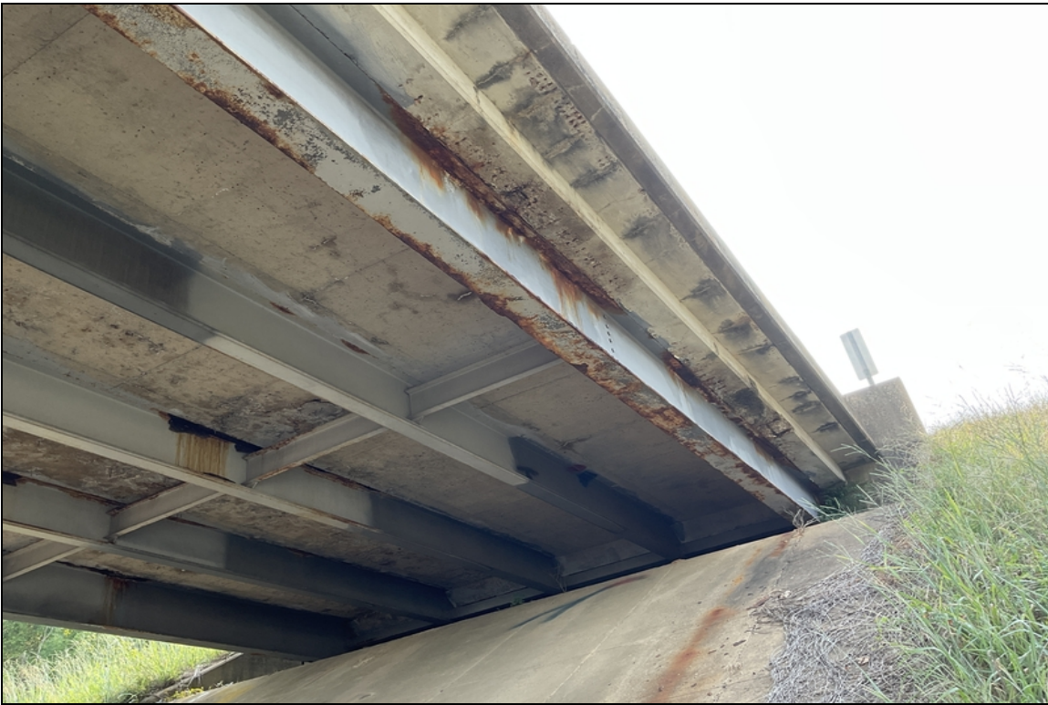
Span 1 girder 1