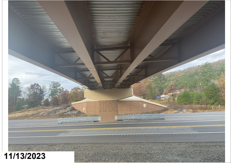
Span 2 soffit.