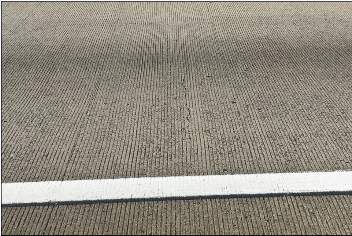
Span 4: unsealed transverse deck crack