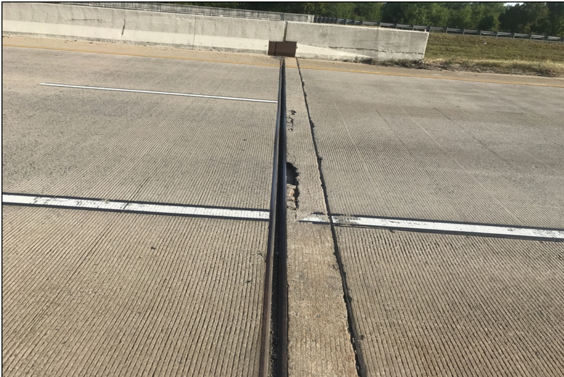
Bent 10: head wall with spalls in the right lane of traffic