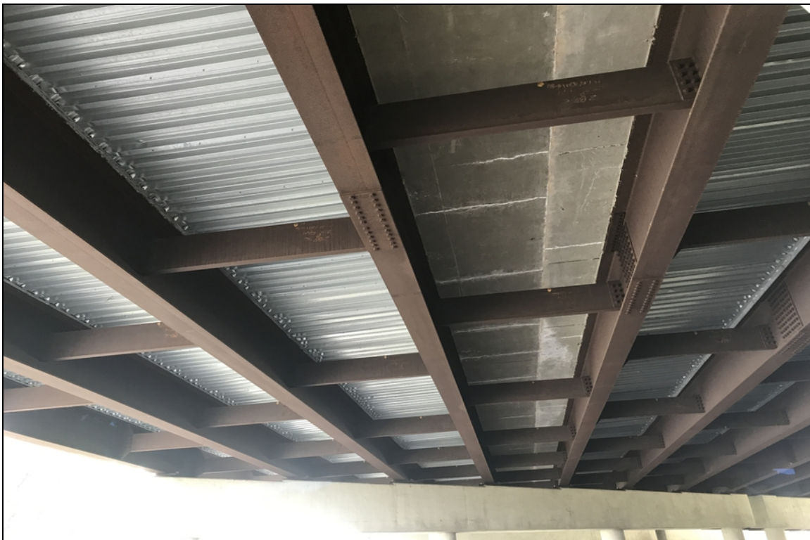
Span 2 soffit view efflorescence between beams 4&5