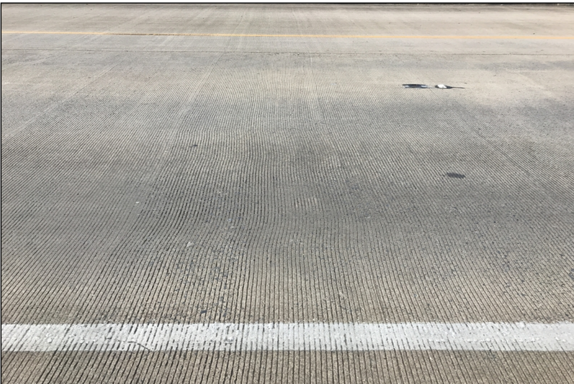
Span 3 unsealed transverse cracks