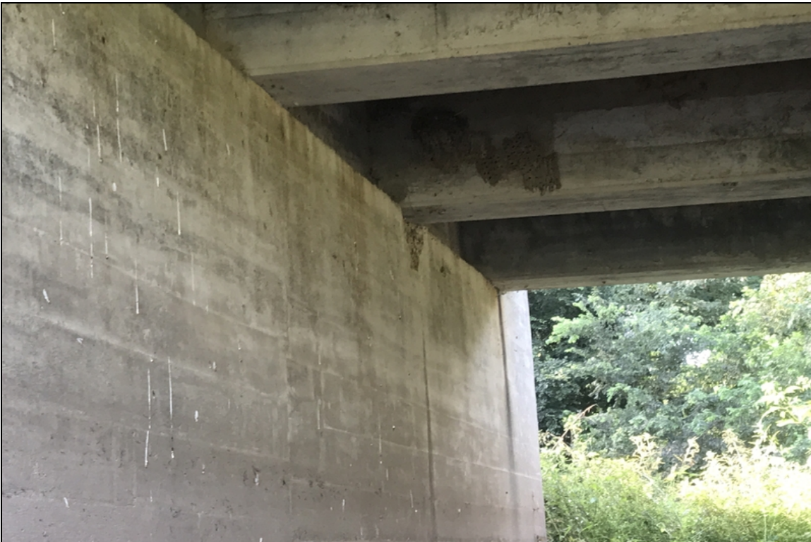
Bent 2, girder 4: spall in abutment under girder 4