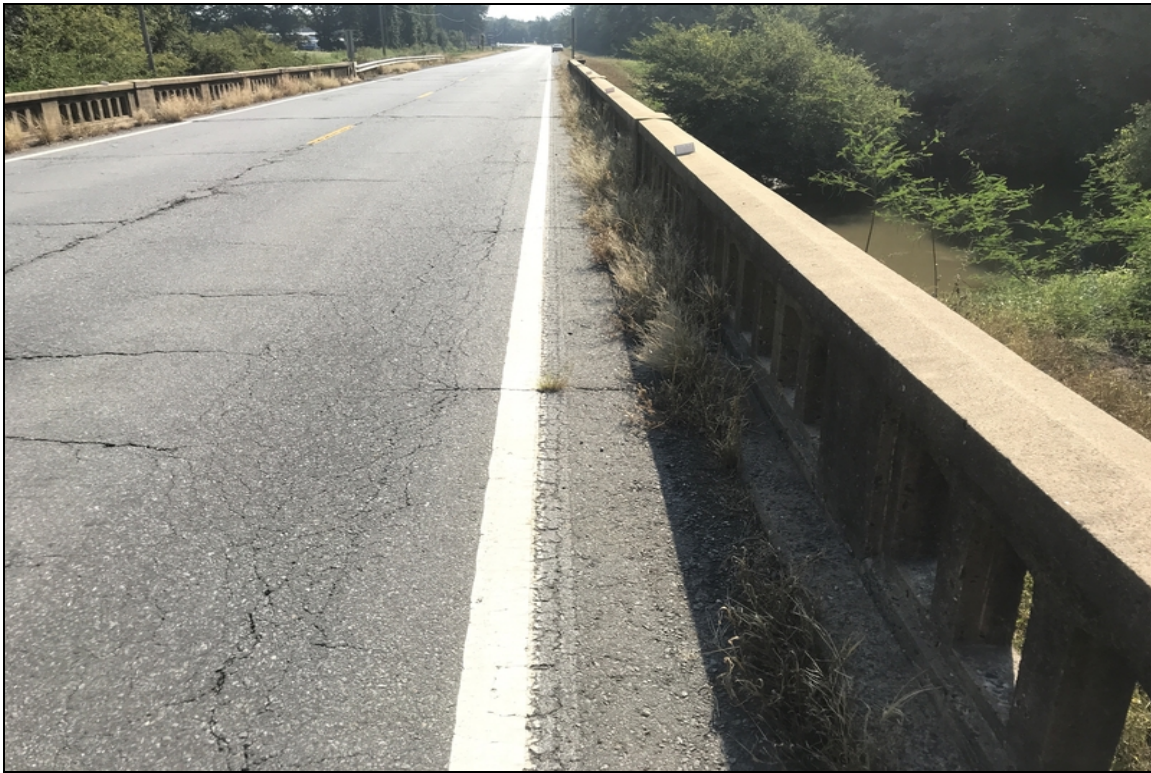
Vegetation growing in both gutter lines