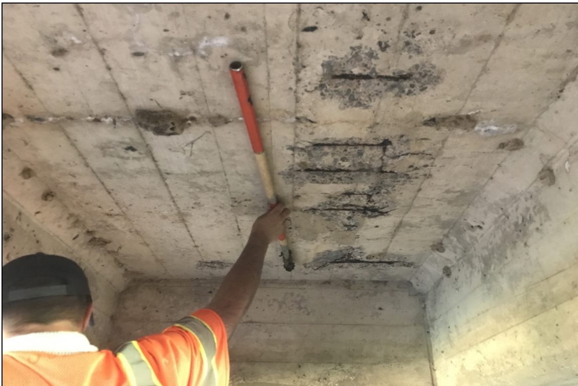
Span 1, near bent 2, between girders 2 & 3: numerous spalls with exposed rebar