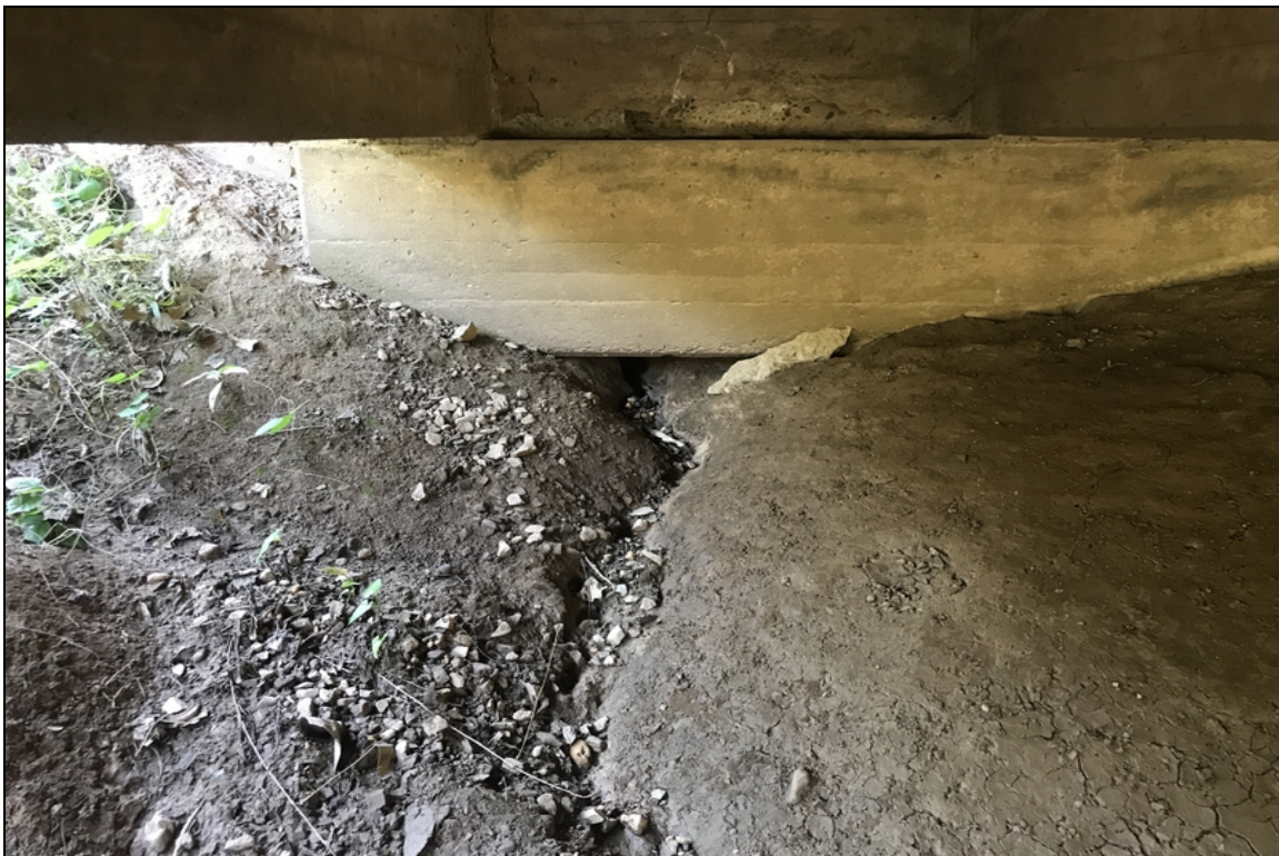
Bent 5: erosion action between girders 1 & 2