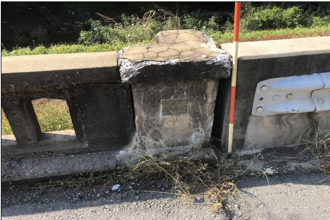
Eastbound concrete rail the concrete is deteriorating