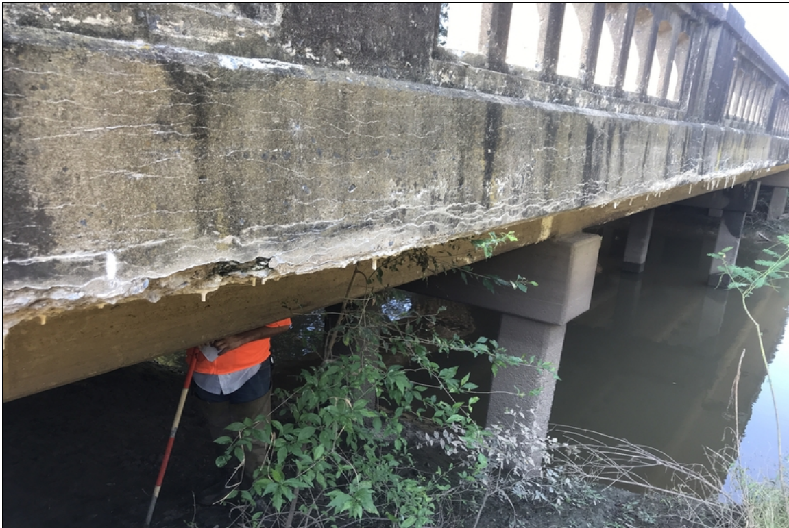
Left concrete rail