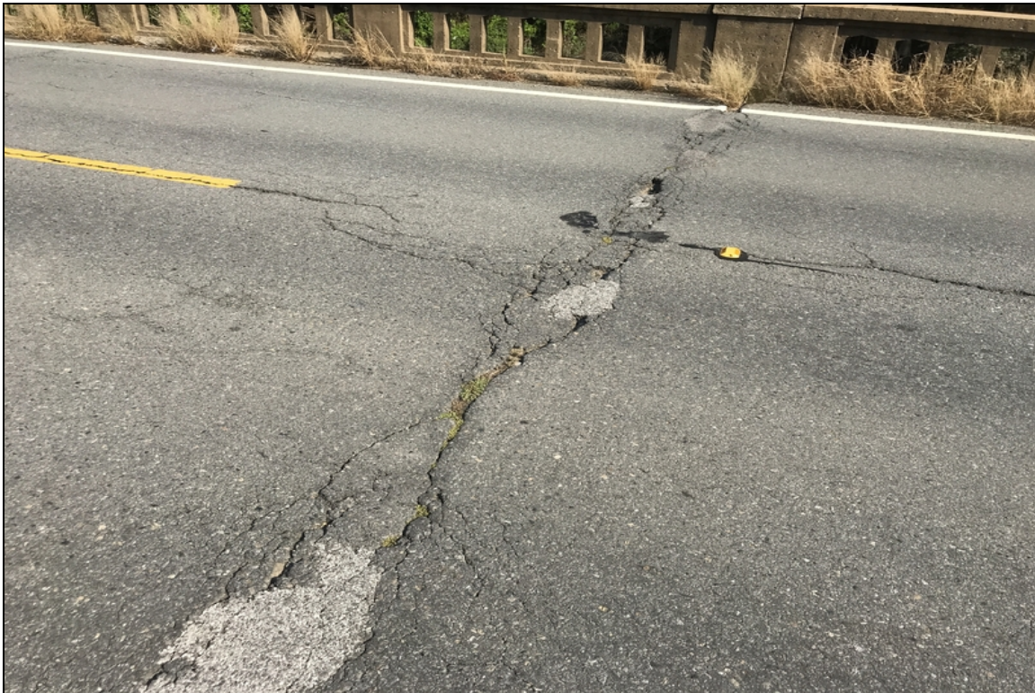
Bent 3, joint with potholes in the asphalt wearing surface