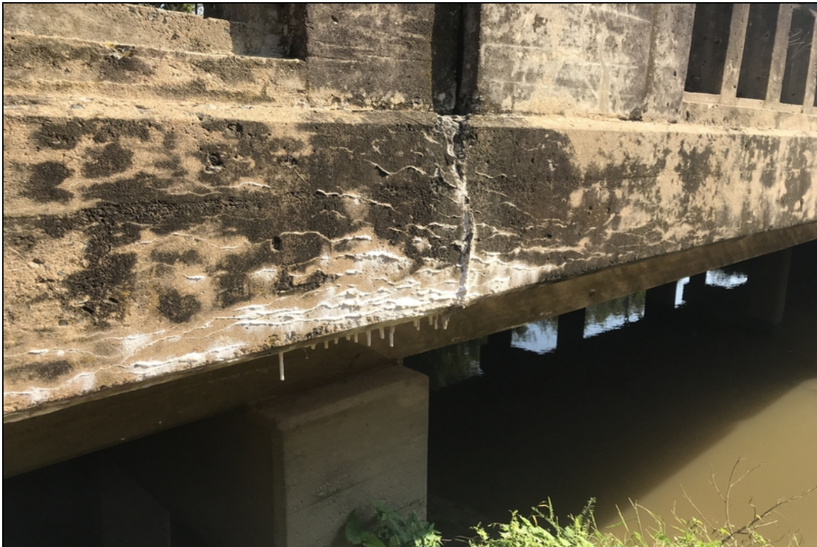
Right rail at span 1: cracking with efflorescence build up