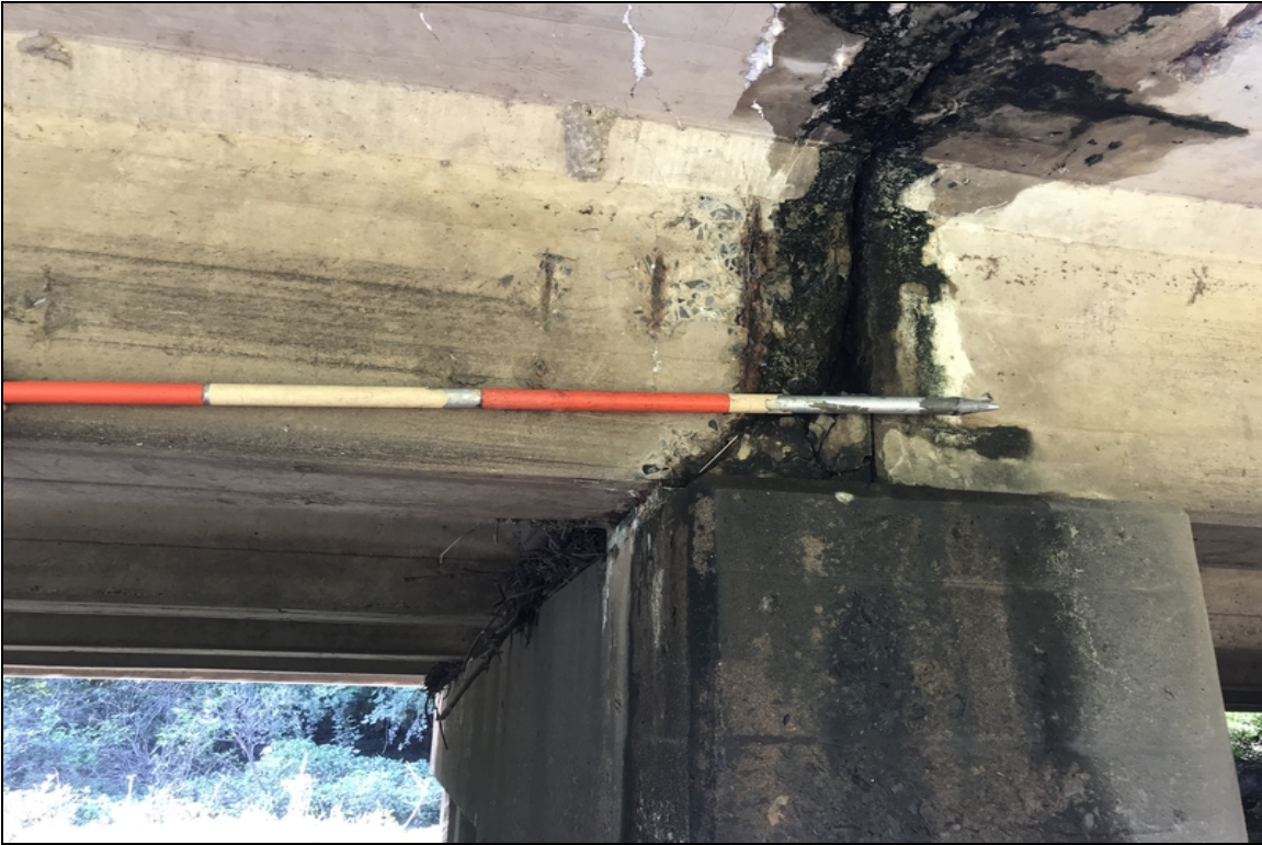
Span 2, bent 2, girder 1: spall with exposed rebar that has lost section