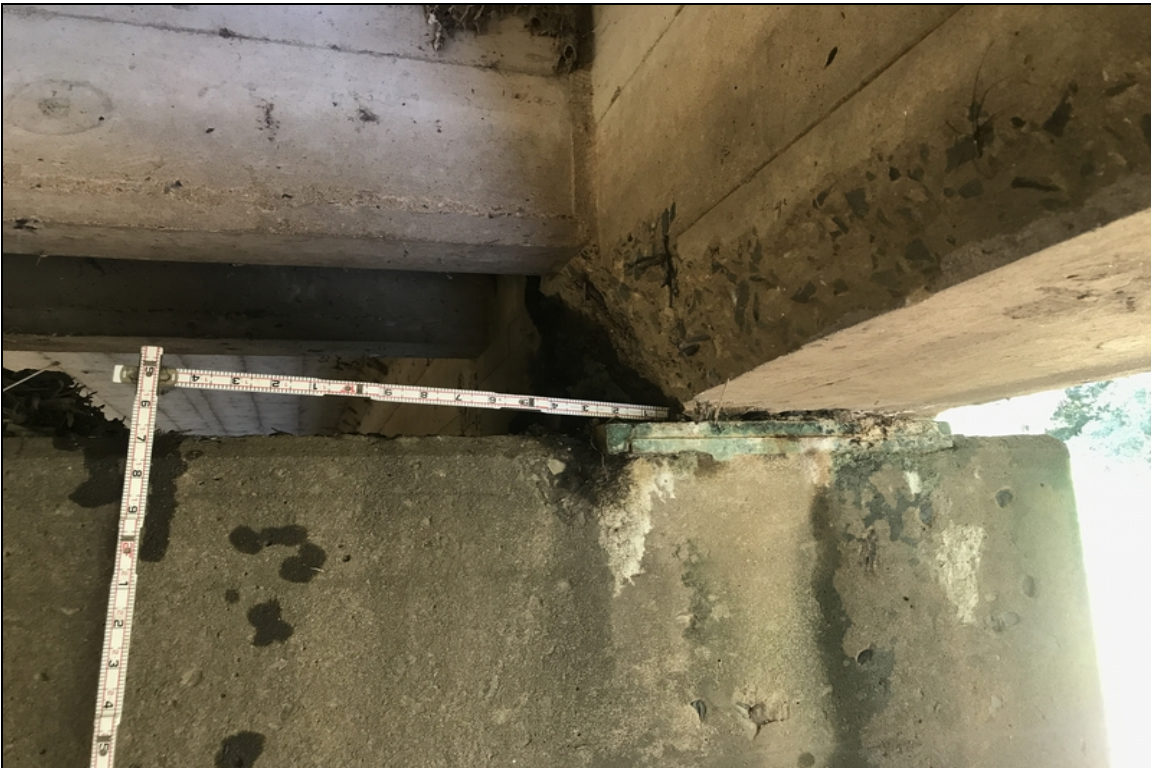
Span 2, bent 2, girder 1: opposite side with a large spall and exposed rebar and loss of bearing. There are 9" of bearing area remaining.