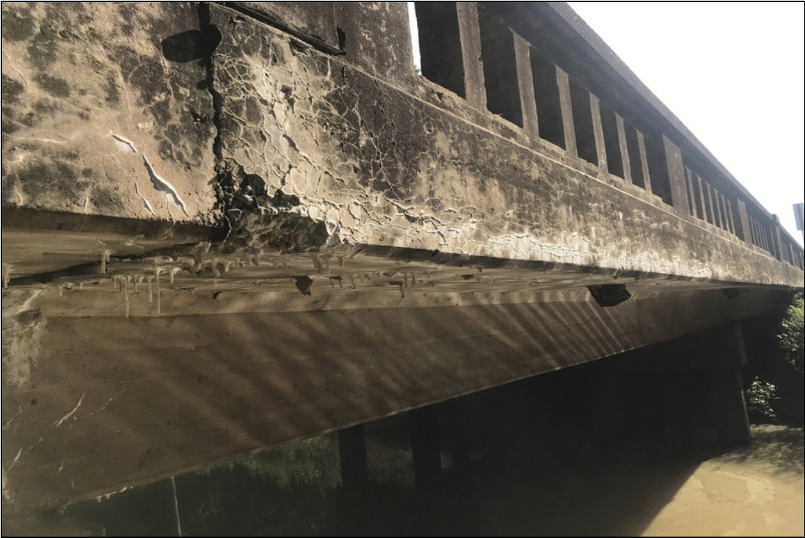
Span 2, Right side facia: numerous cracks with efflorescence staining