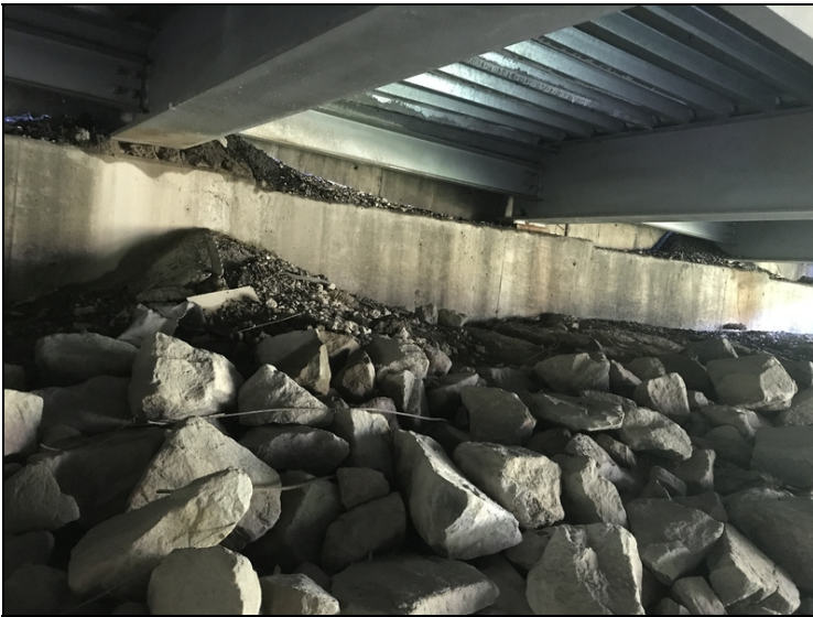
Bent 7: joint seal missing allowing dirt and debris to accumulate around bearings.

Bents 1 and 7: entire joint seals are missing at both locations and debris is accumulating around bearings and beam ends.