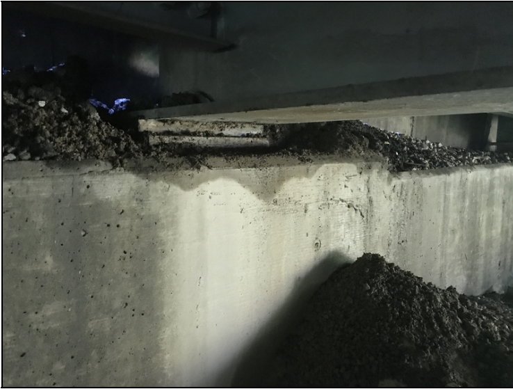
Bent 7, girder 5: beam 5: Bearing with a gap between the sole plate and masonry plate hitting hard with live load over this location.