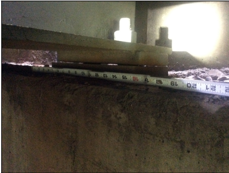
Span 6 bearing 4 gap between bearing and masonry plate. Common at bearing 5 this bent.

Bent 7 abutment, bearing at girder 4 and 5. Also, Bent 4, span 3, beam 5: Gap between bearing and masonry plate.