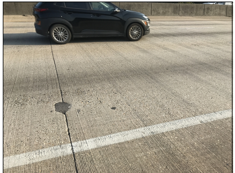
Span 2: numerous unsealed transverse cracks and small spall filled with asphalt.