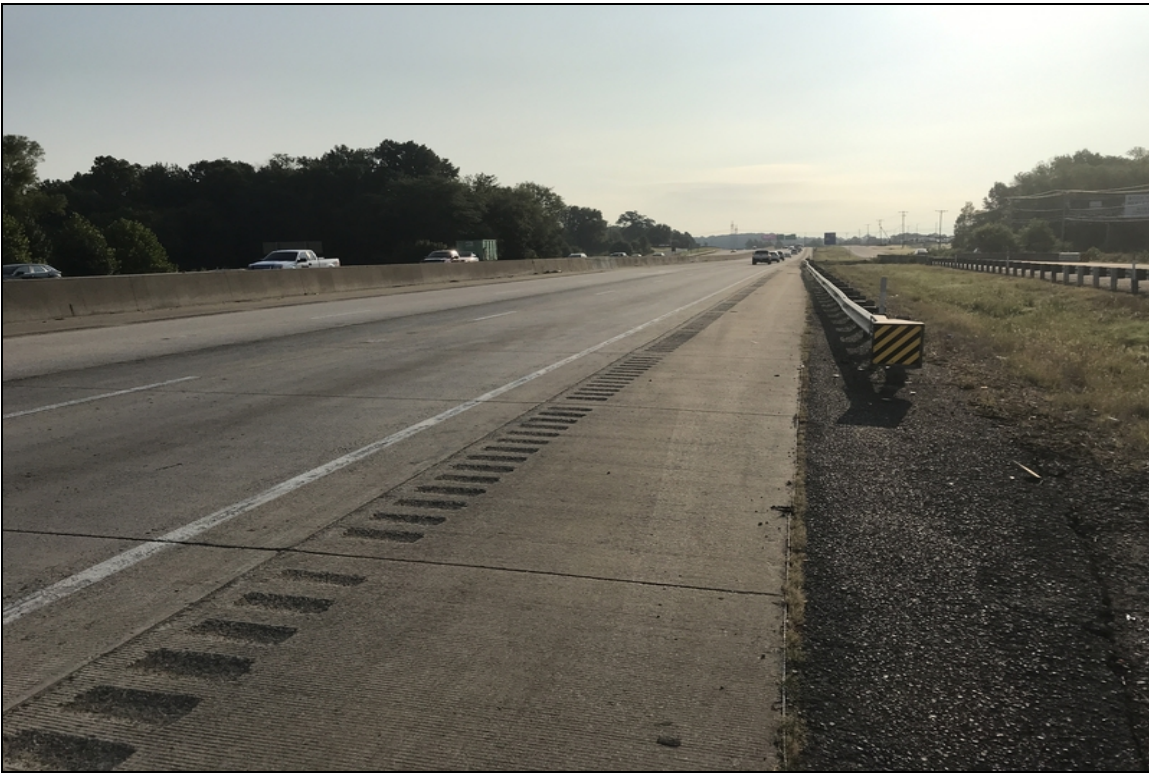
Inventory looking east