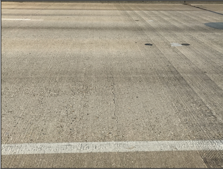
Span 4: large unsealed transverse crack.