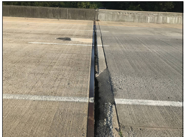
Bent 7: entire joint seal missing, spall filled with asphalt in the right lane, spall filled with asphalt in the center lane, and joint armor missing in the right 2 lanes.