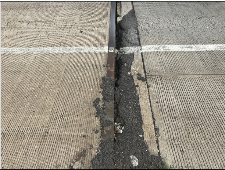
Bent 7 spall filled with asphalt in top of back wall

Bent 7 top of backwall right lane and shoulder has spall filled with asphalt.