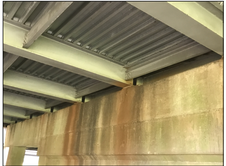
Bent 4, span 3, beam 5: Bearing with a gap between the sole plate and masonry plate hitting hard with live load over this location.