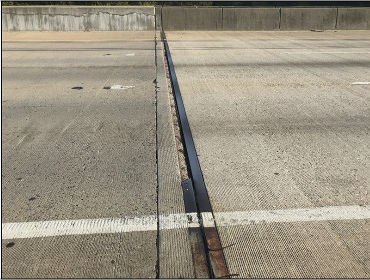
Bent 1: majority of joint seal missing and 36' of joint armor missing.