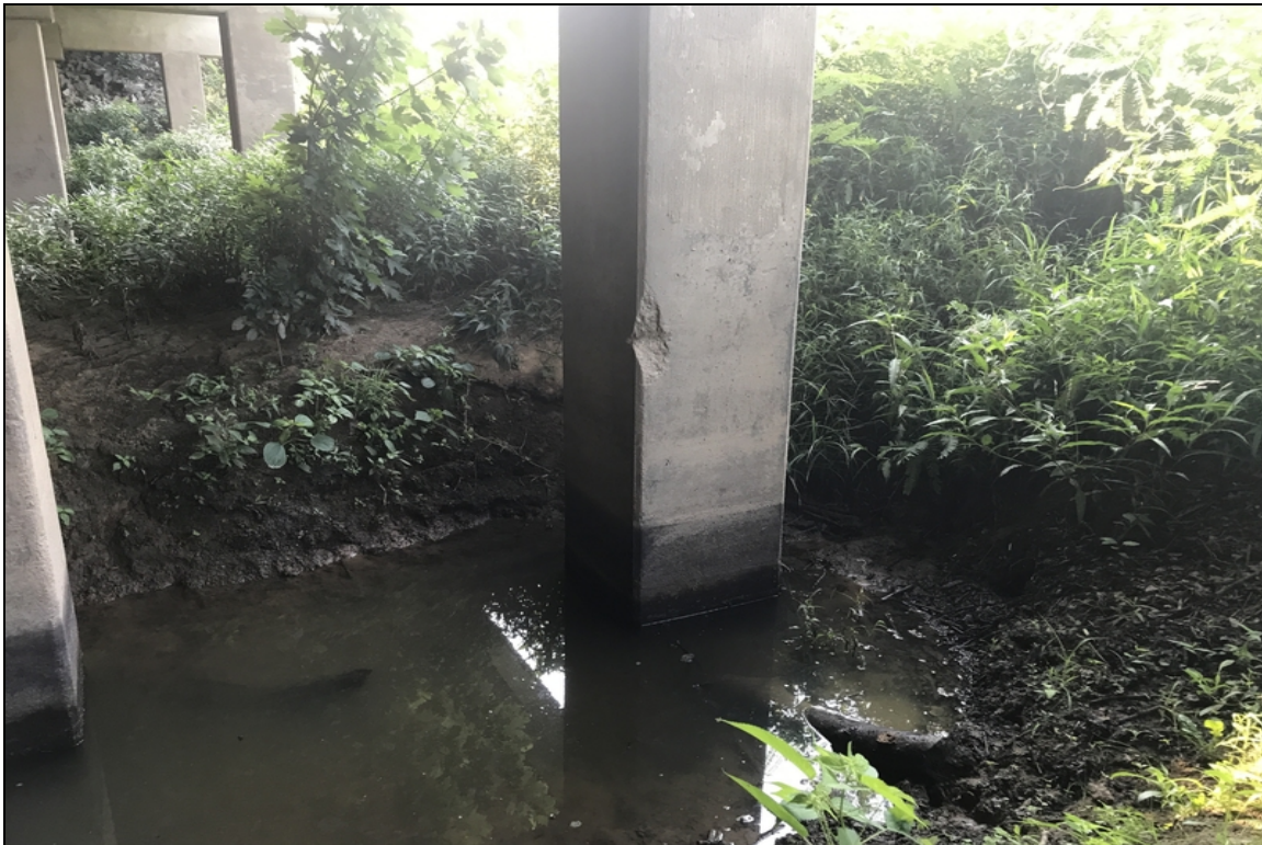
Bent 4 column 4: back side with a spall.