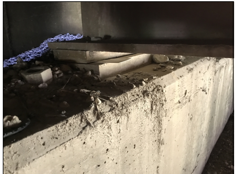
Bent 7 abutment, bearing at girder 5. Gap between bearing and masonry plate.