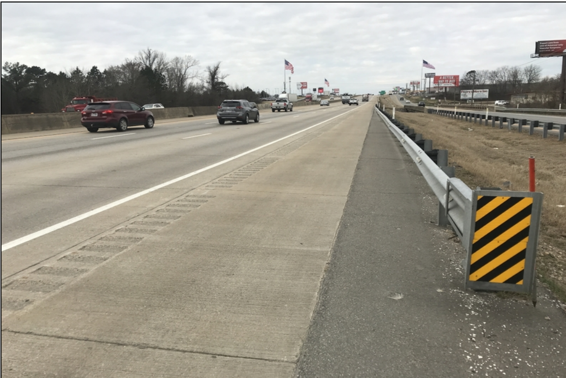
Approach view looking west