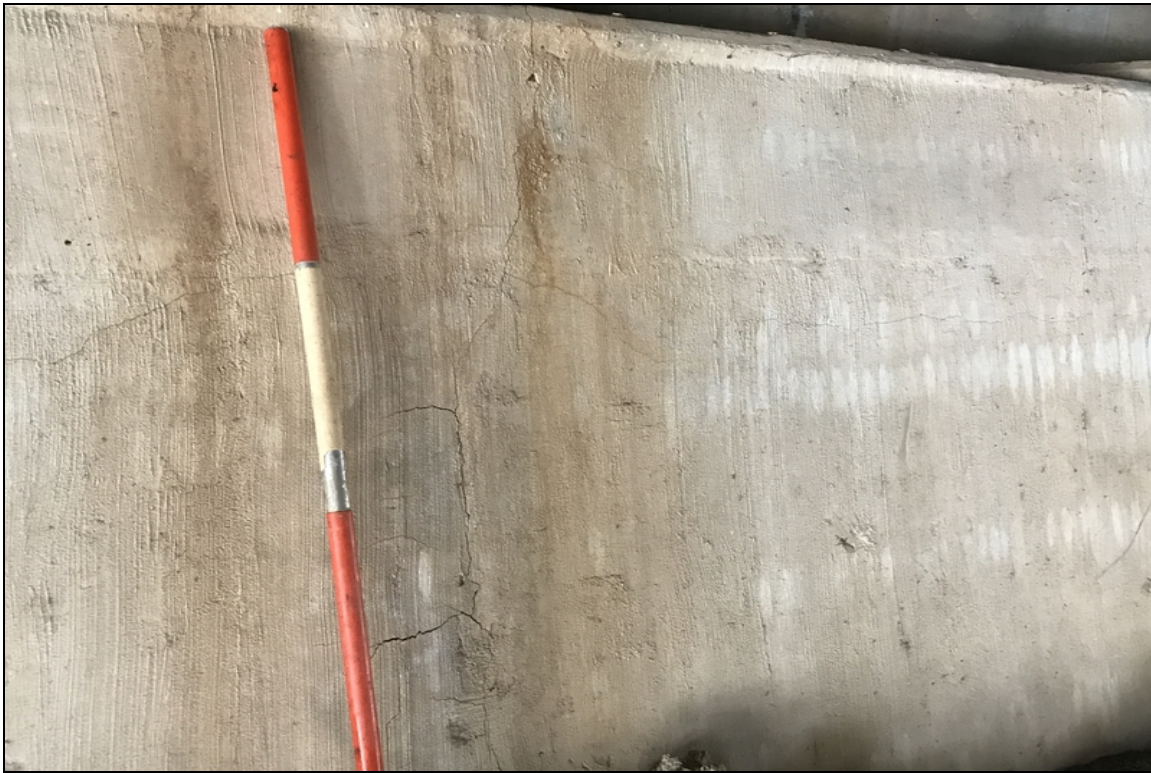
Bent 1: beam seat with vertical and horizontal cracking.