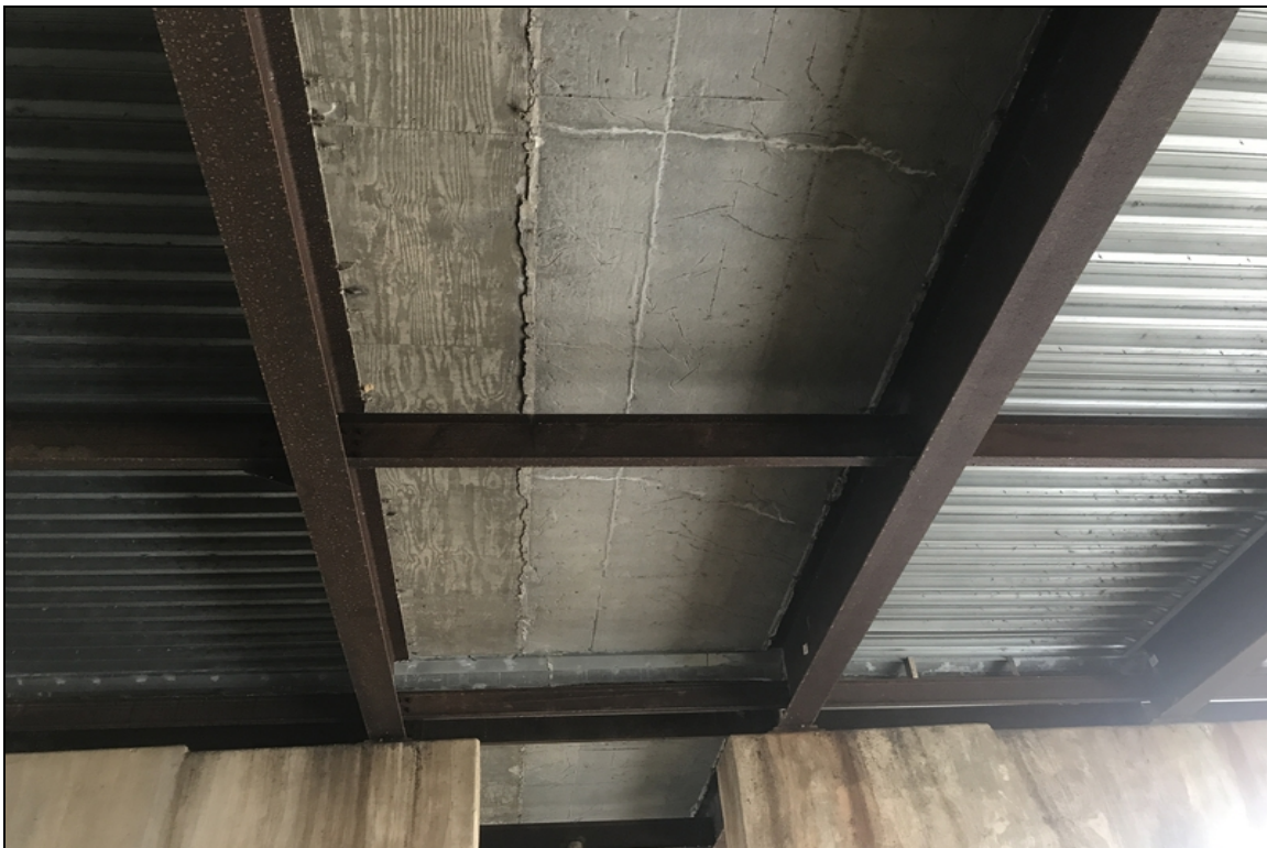
Span 4 soffit has transverse cracks with efflorescence.