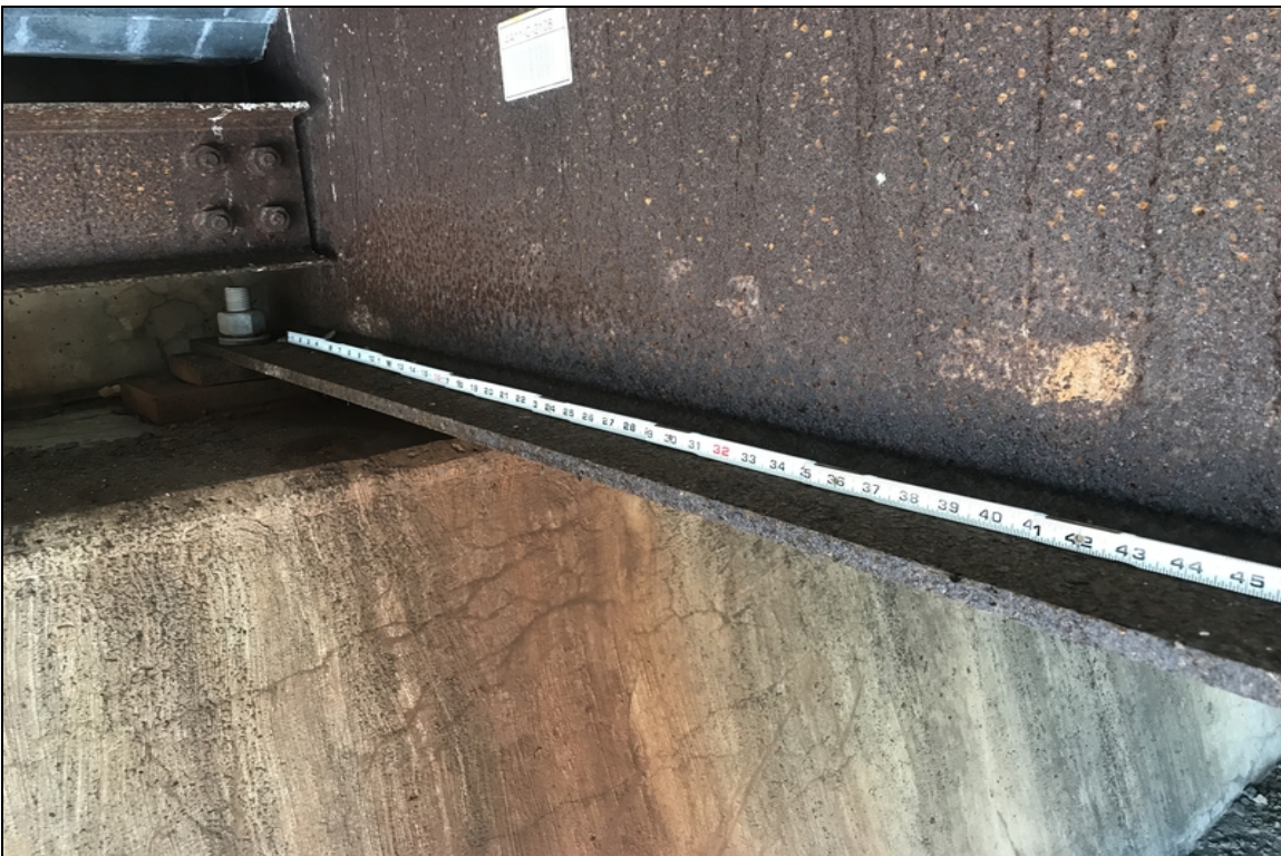
Span 1 beam 13 bottom web and upper haunch area of beam end have small flaking rust. Common all beam ends bent 1