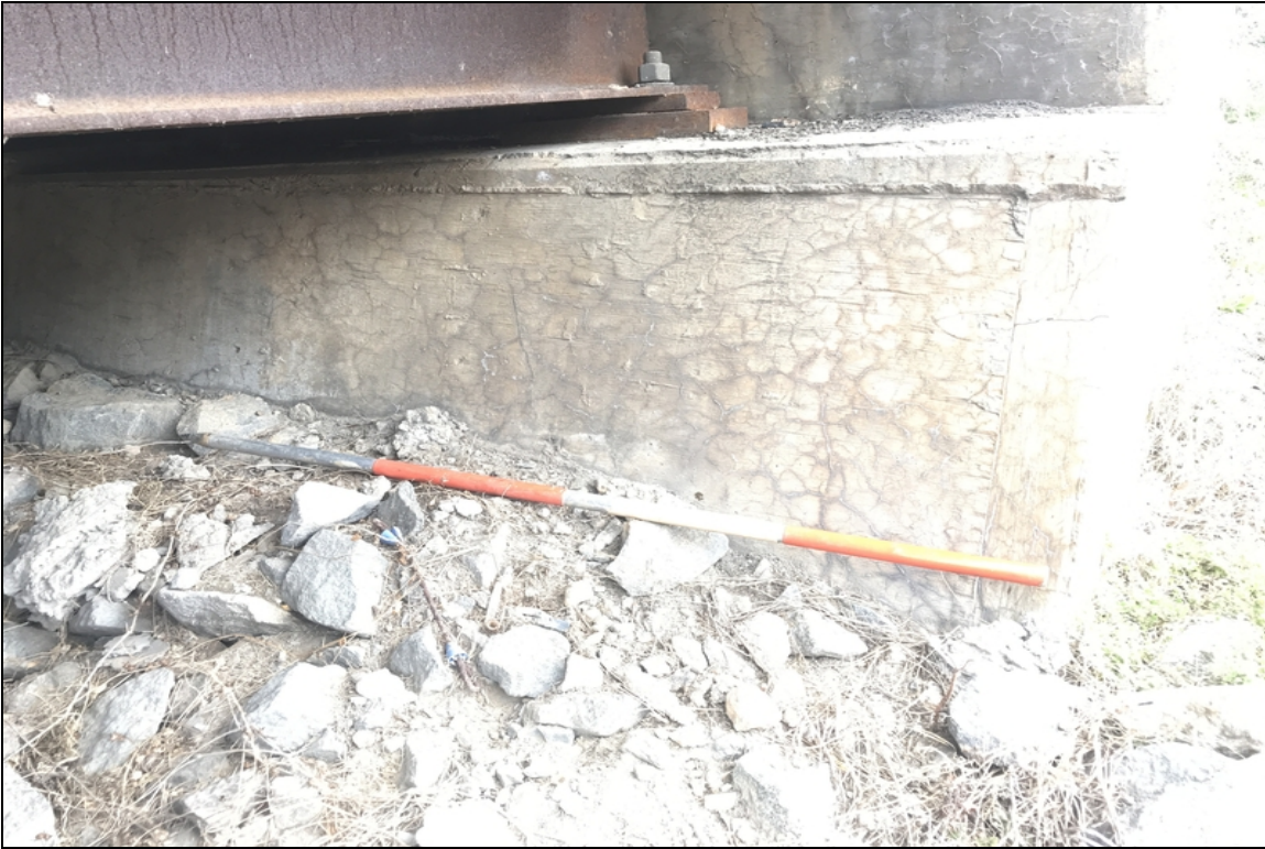
Bent 7: right end of cap has map cracking up to 6' in length.