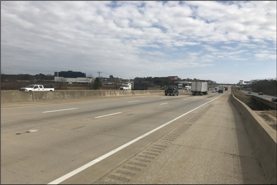
Inventory looking east