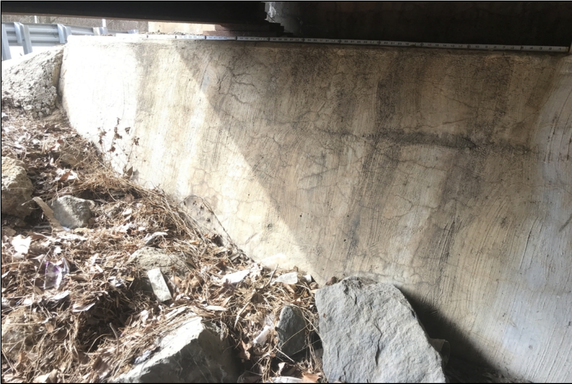
Bent 1: right end of beam seat is map cracked.