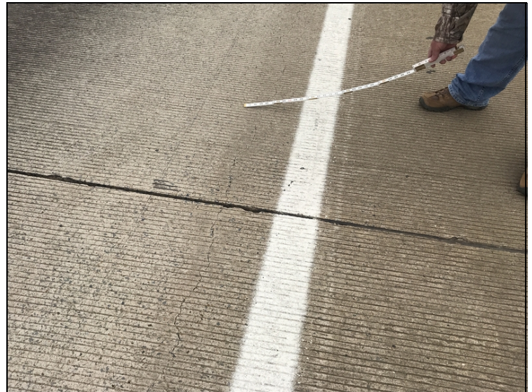
Span 2 deck has longitudinal cracks.