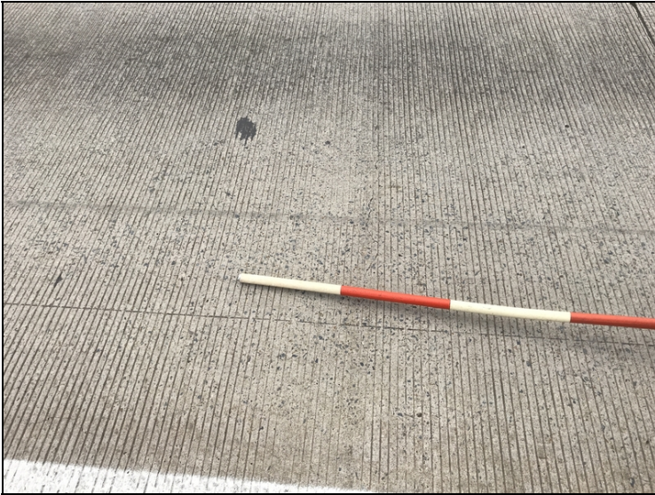
Span 6 deck has transverse cracks.