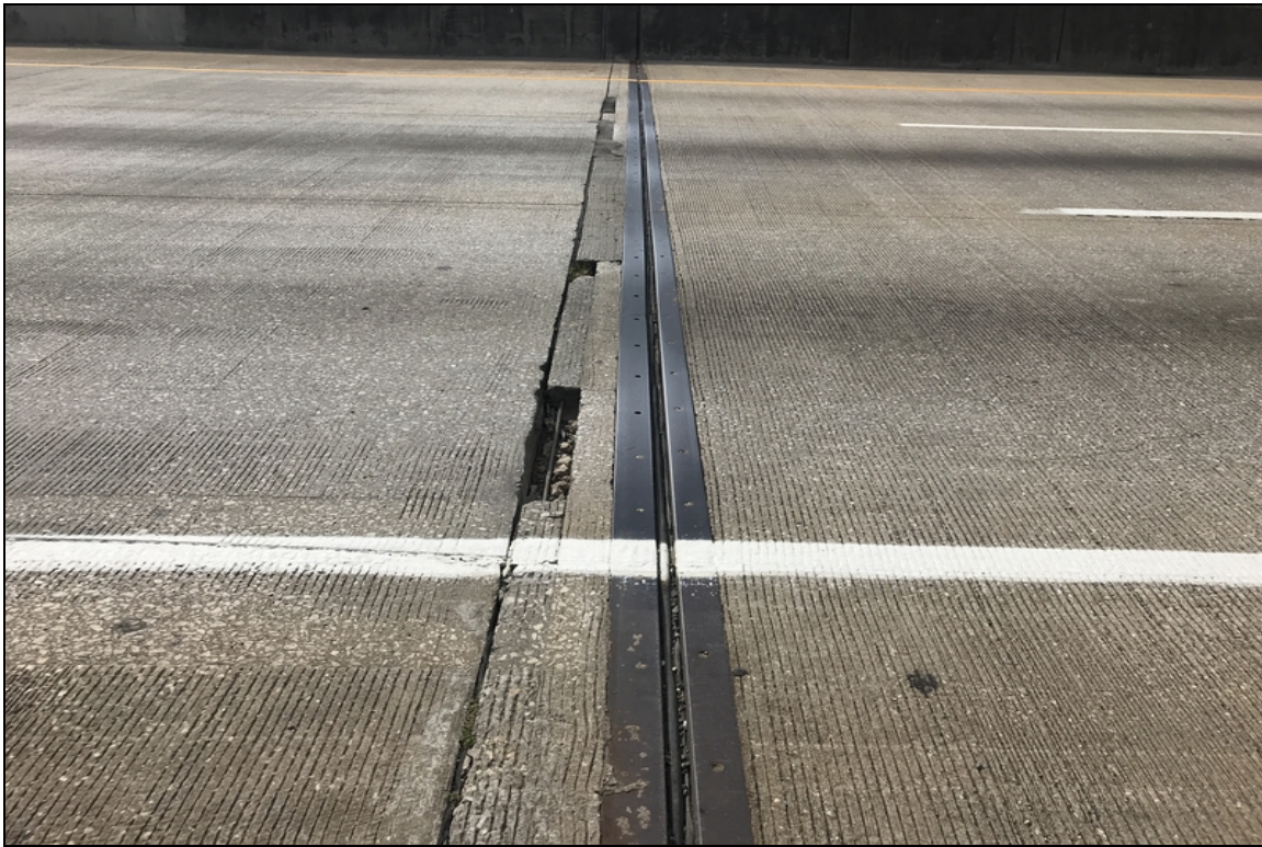
Bent 7 east abutment top of backwall spalls with rebar exposed