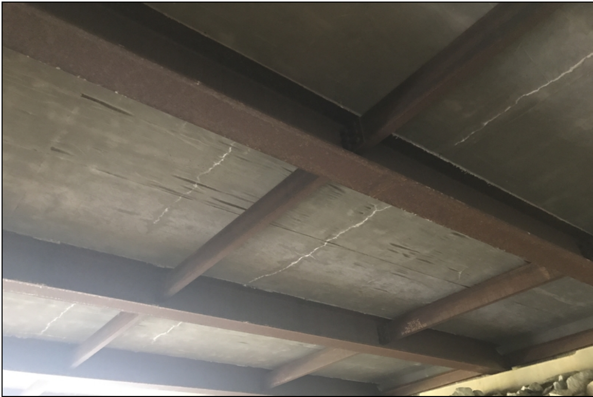
Efflorescence on soffit span 1