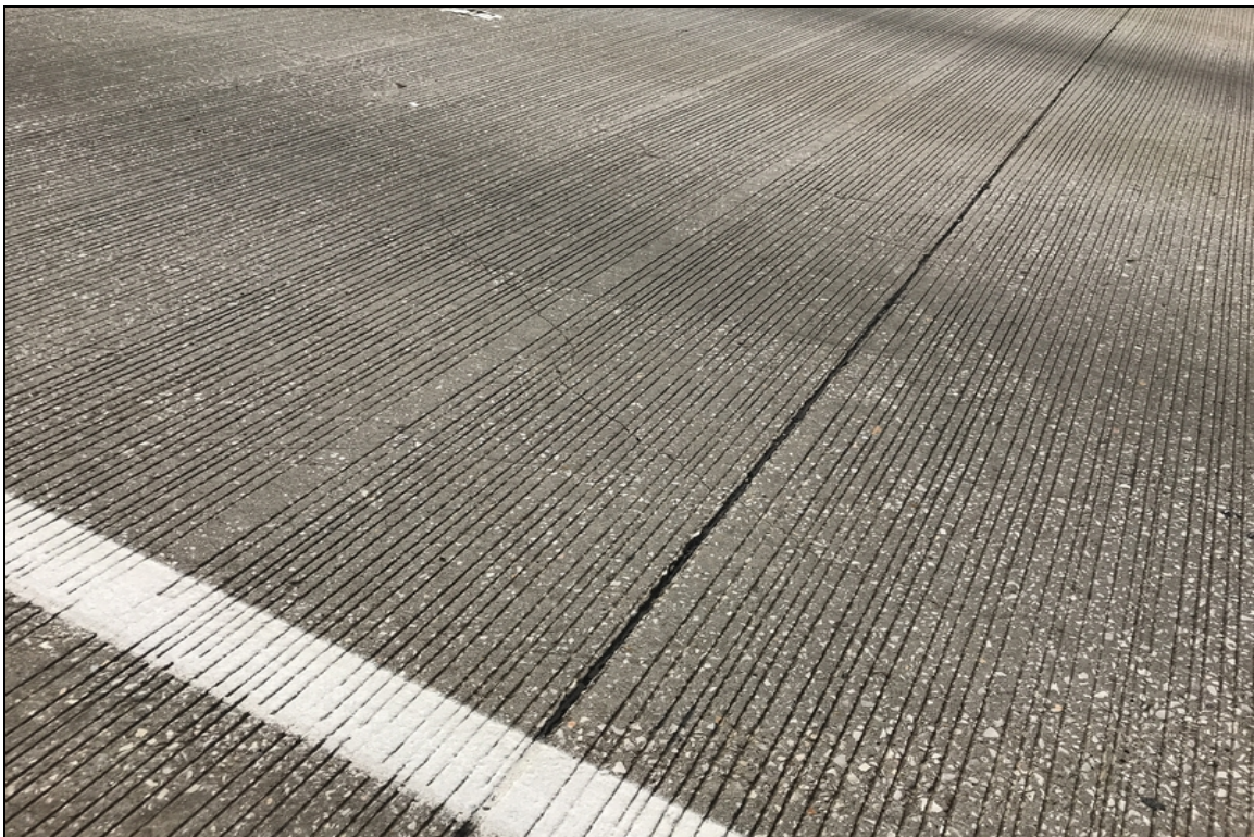
Span 2 Unsealed transverse and longitudinal cracks in all spans up to 0.040 inch