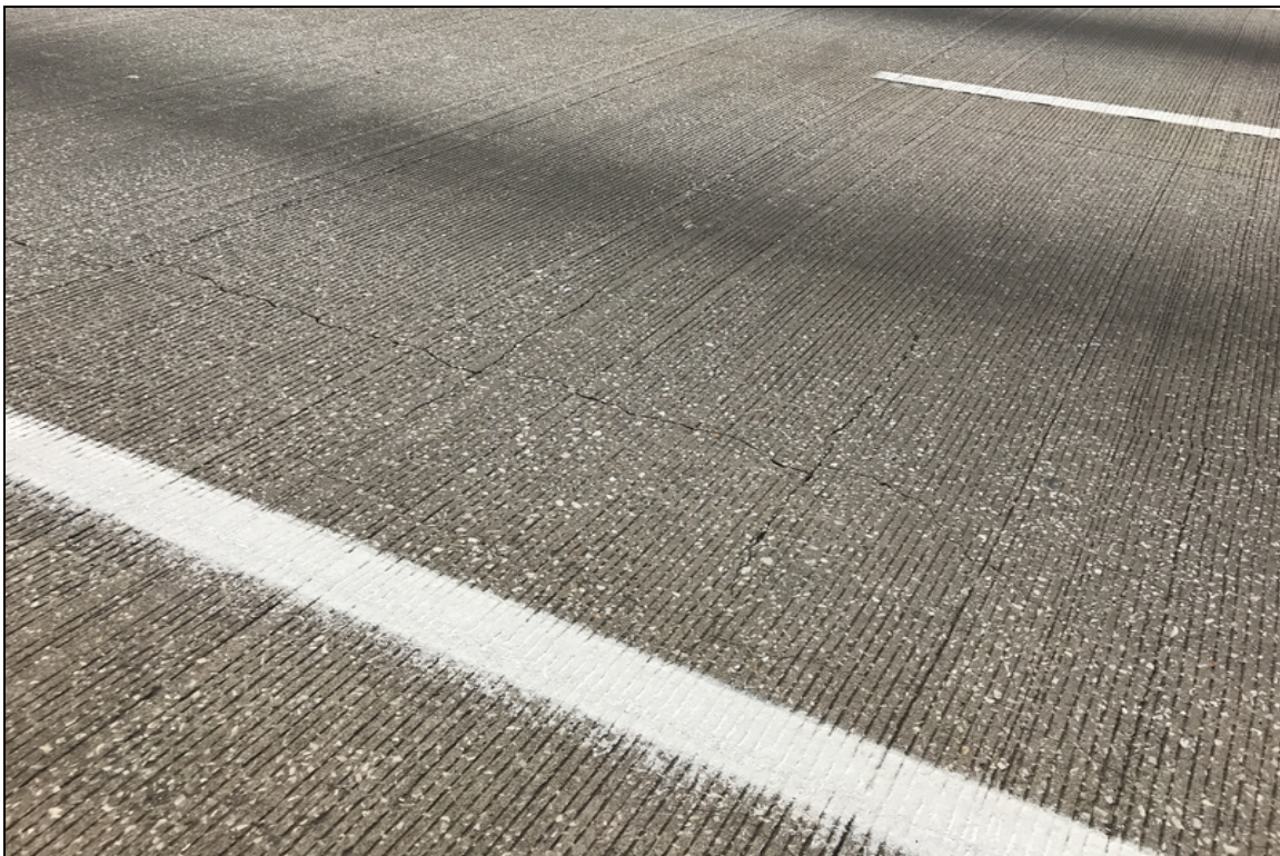
Span 5 Unsealed transverse and longitudinal cracks in all spans up to 0.040 inch