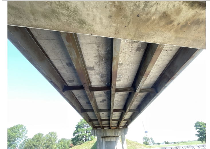
span 2 soffit delams removed