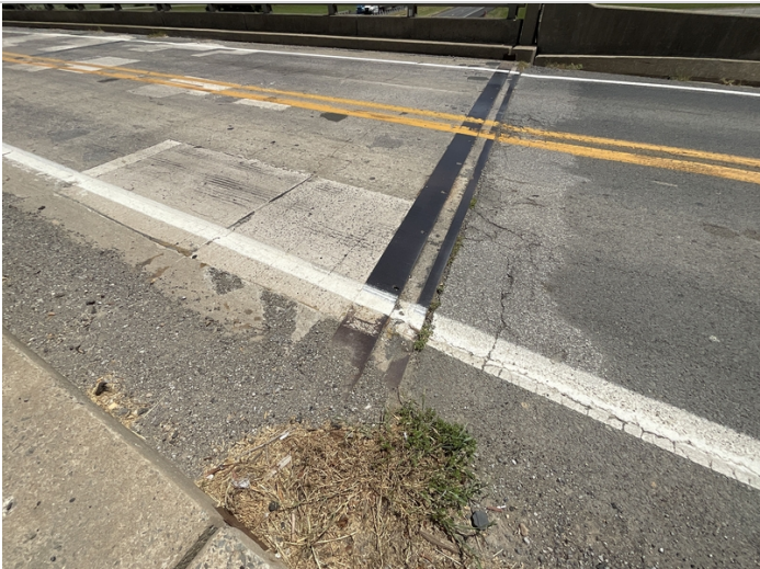
Joint at bent 1