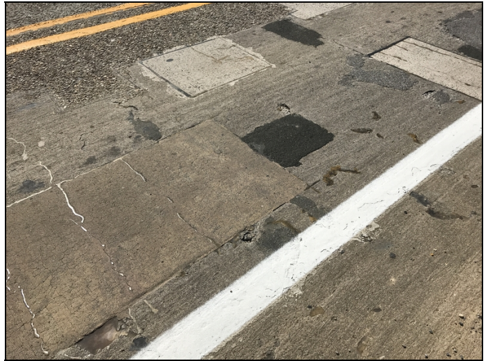
Span 2 spalls in deck