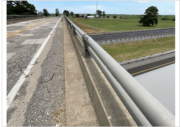
Guardrail damage span 2 east side