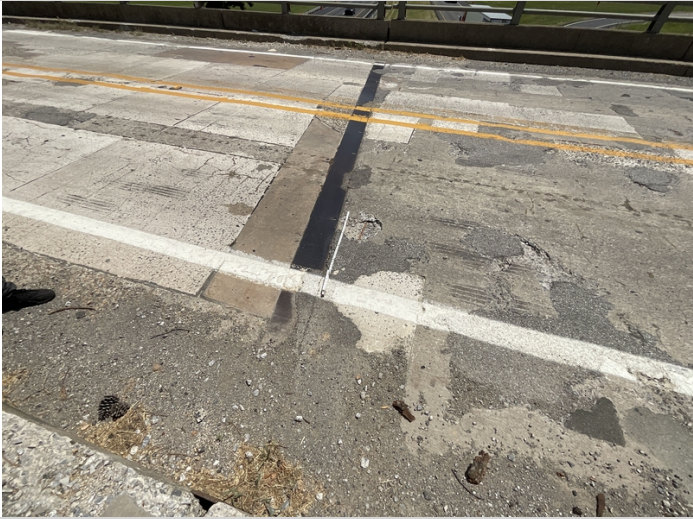
Spall at bent 3 joint