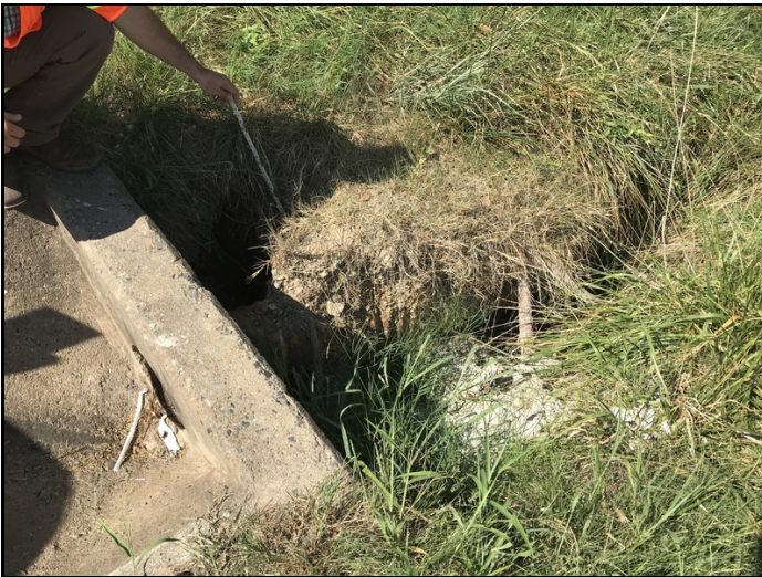
Northwest end of bridge has 5' hole at approach slab drain.

Northwest end of bridge has 5' hole at approach slab drain. Southwest end of bridge has 3' hole at approach slab drain.