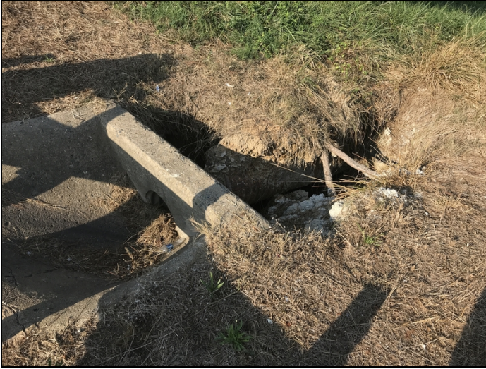
Northwest end of bridge has 5' hole at approach slab drain.