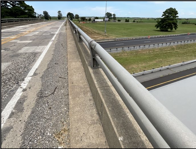
Guardrail damage span 2 east side

Metal bridge railing has damage in span 2 east side due to vehicle impact