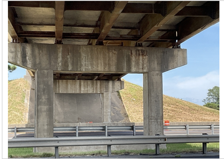
Cracks and spalls with rebar bent 3