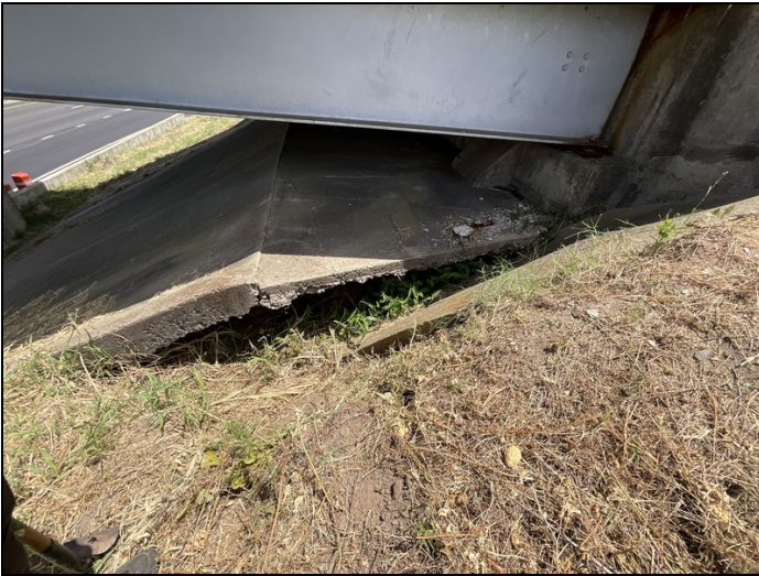
Bent 1 left side erosion hole