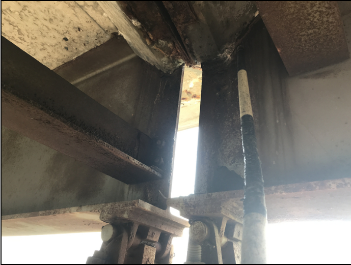
Span 1, beam 5, pitting to 3/16 inch deep on upper web.