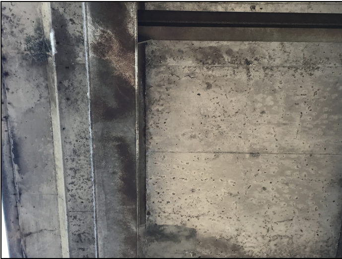
Span 2 small delam between beams 1&2 over eastbound traffic right lane and off ramp.