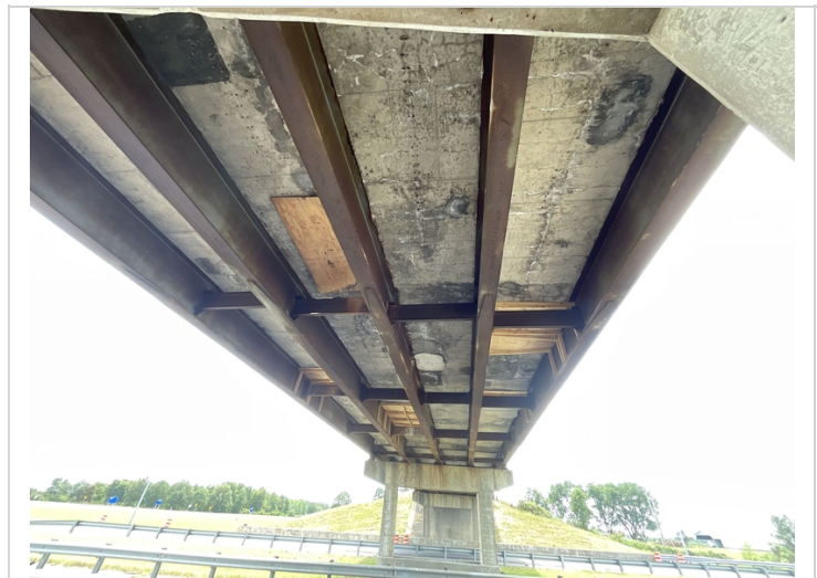
Span 4 repair forms still in place