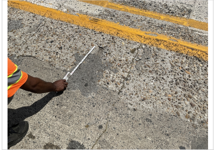
Spalls with exposed rebar in the deck span 2,3 and 4