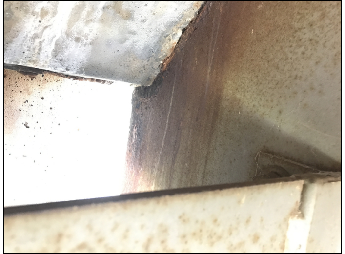
Span 1 at bent 1 beam 1