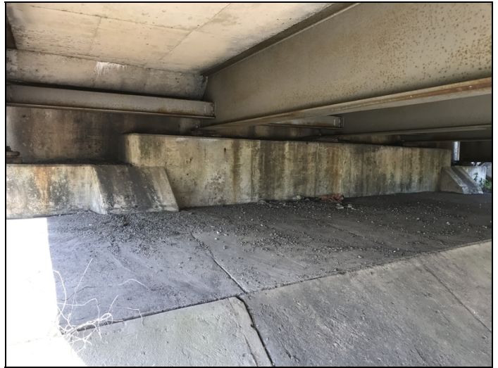
Bent 1 bearing condition overview