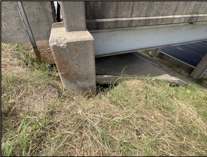
Erosion at bent 1 right side

Slope paving at both abutments have voids under slope paving and have settled.