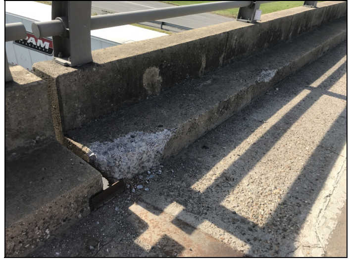
Span 3, right curb with a large spall near bent 4 joint