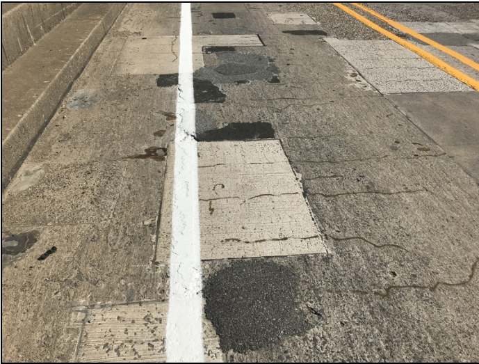
Span 2 spalls and spalls filled with asphalt