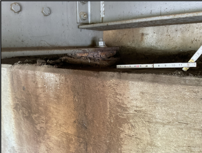
Bent 5 beam 2 bearing

At bents 1 and 5 the bearings have heavy laminating rust to bearings and masonry plates.