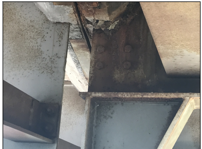
Span 1 beam 3 at bent 2 has a 6" by 1-1/2" hole in web under haunch