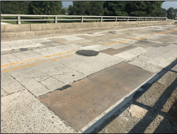
Span 3 overview