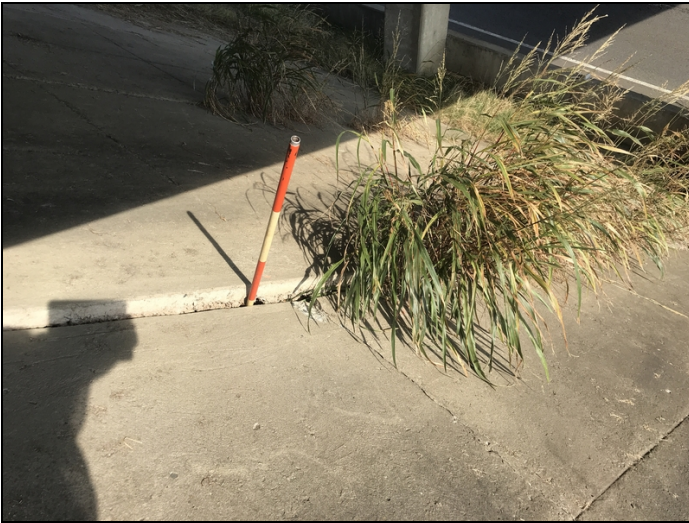
South end slope paving