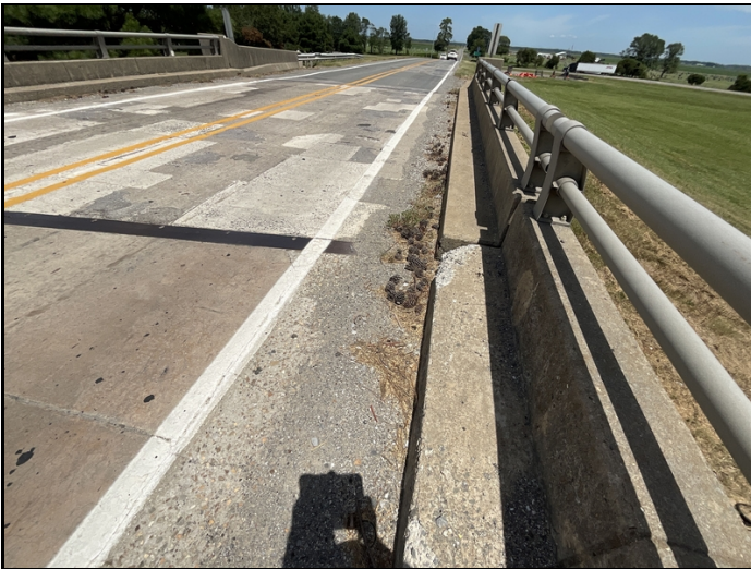
Spall at the curb bent 4

Deck all span have spalls and spalls filled with asphalt. Span 3 right curb with a large spall near bent 4 joint