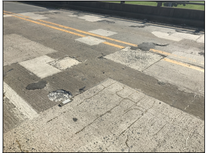
Span 4 spalls and spalls filled with asphalt