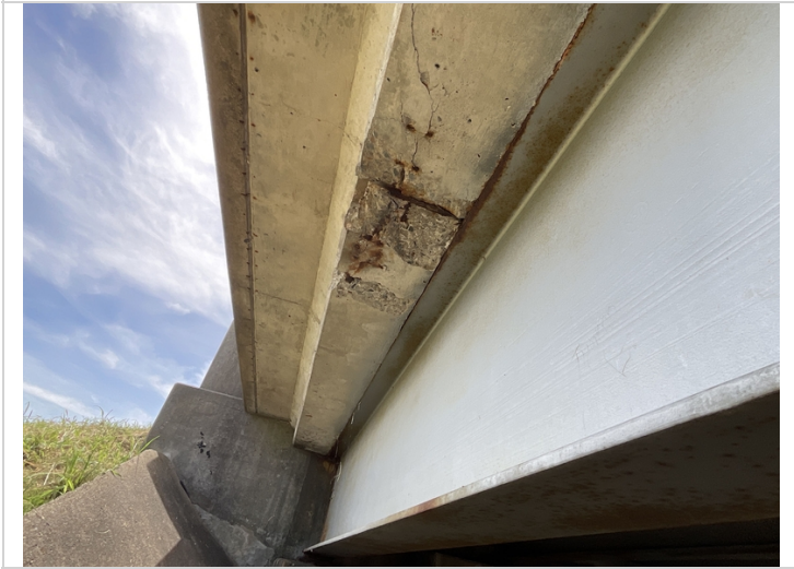
Span 1 right side of beam 5 spall with rebar