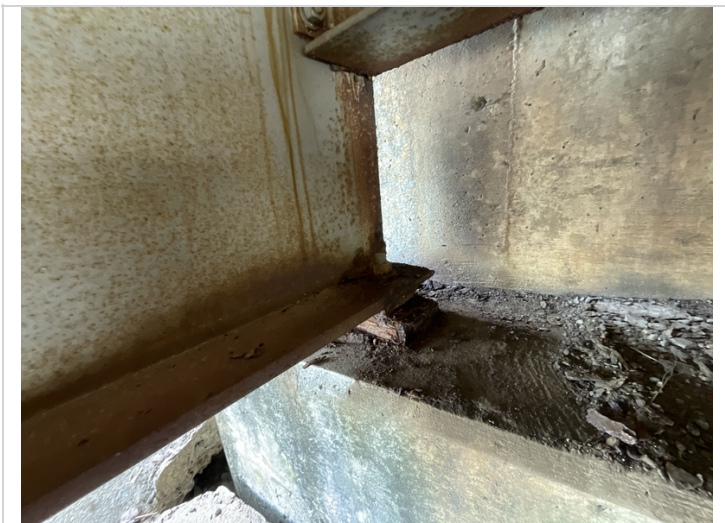
Bent 1 beam 5. Has 1/2 remaining section at bearing area. Flanges 7/8" thick