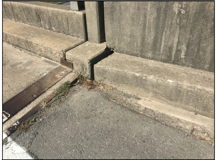
North approach settlement