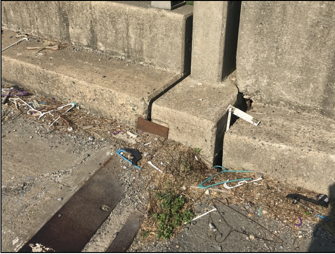
North approach settlement