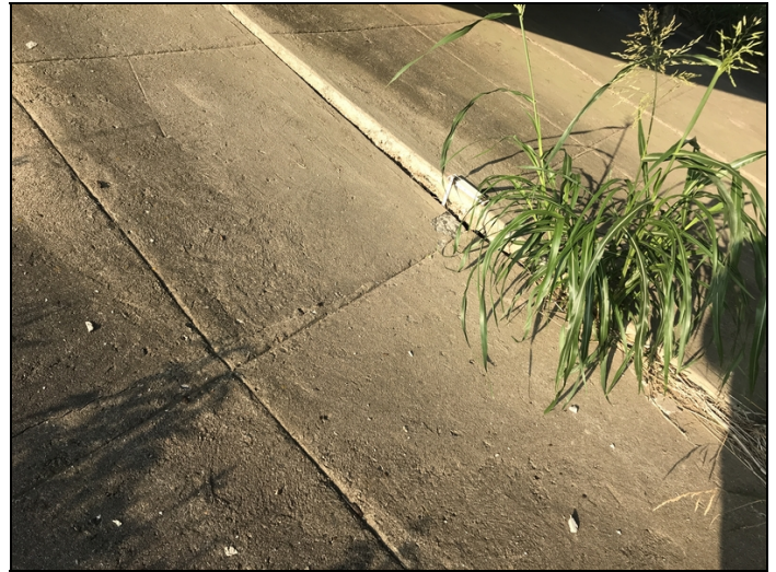
South slope paving