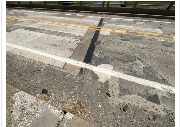
Bent 3 joint