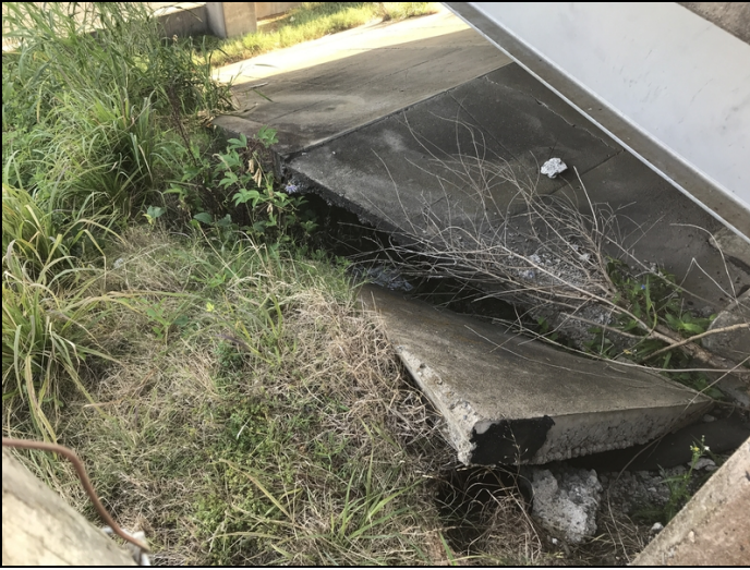
Southeast corner of bridge. Slope paving has a 10' wide by 2' deep void w