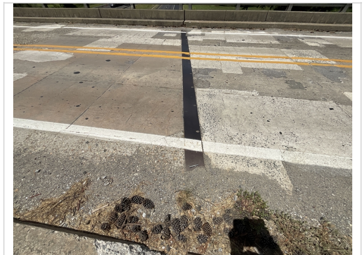
Bent 4 joint