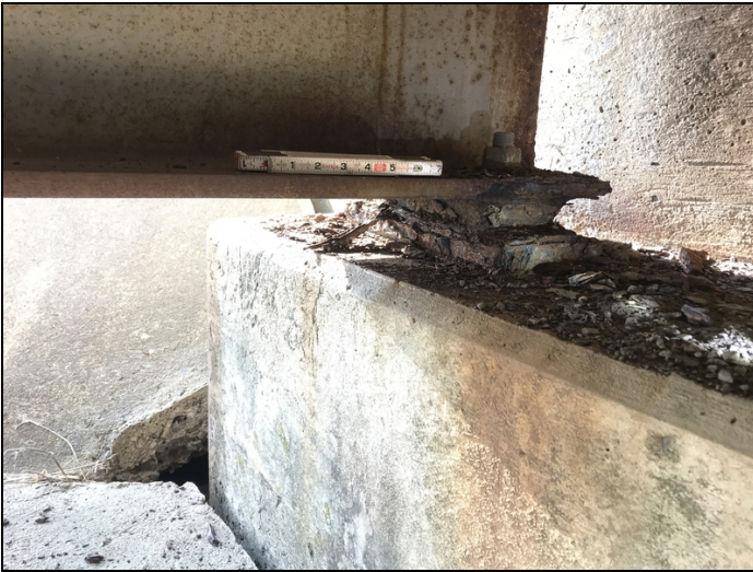
Bent 1 bearing 5 laminating rust on bearing and masonry plate.