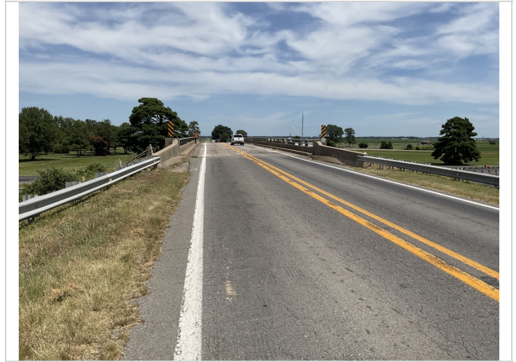
Approach looking north