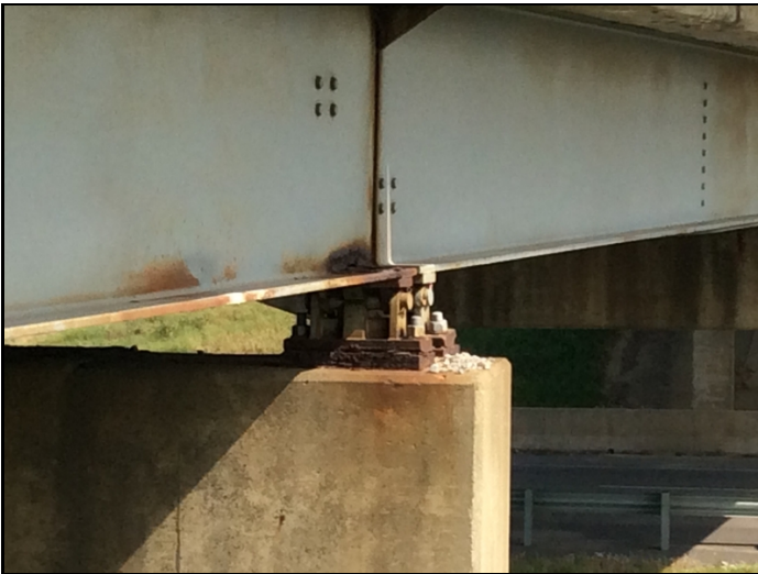
Span 1, beam 5, pitting to 3/16 inch deep on the web and bottom flange.

Span1 at bent 2, beams 1,4&5 have deep pitting to upper web and lower web.