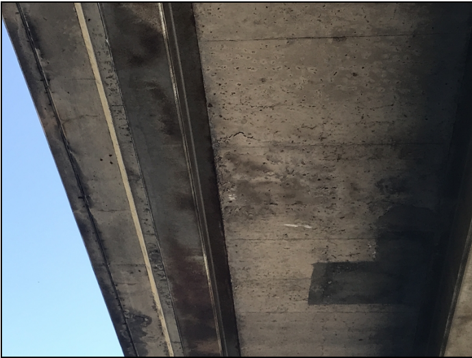
Span 2 delam between beams 1&2 over eastbound traffic right lane.