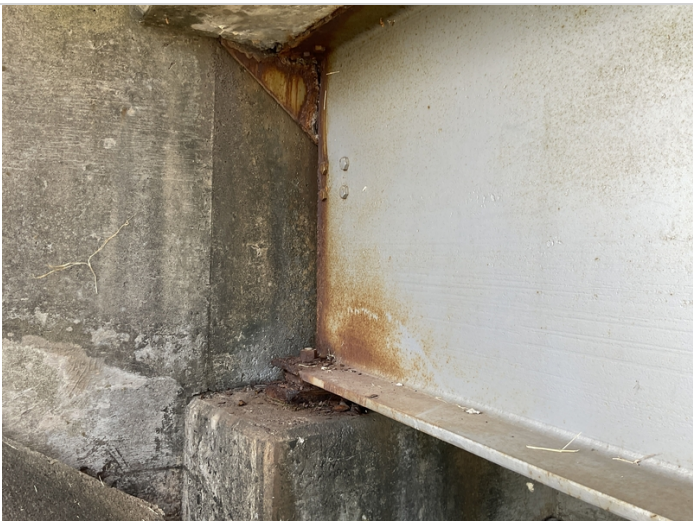
Bent 1 beam 1 corrosion at beam end and bearing