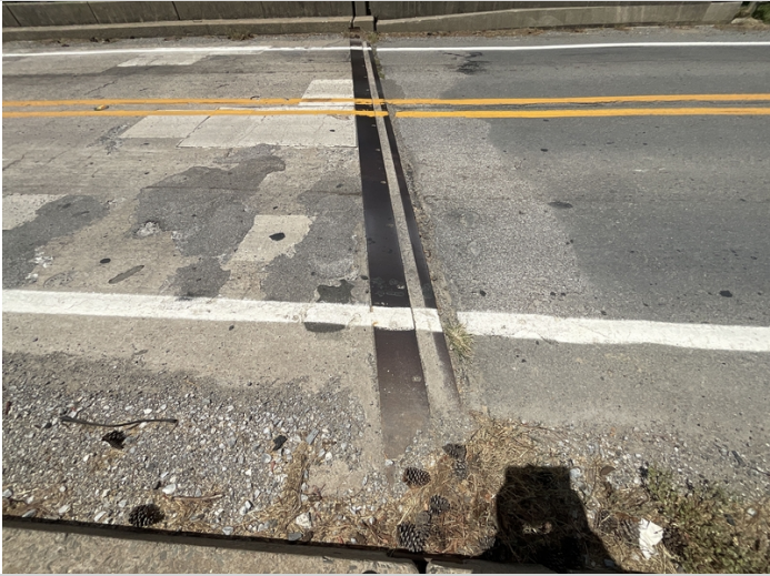
Bent 5 joint