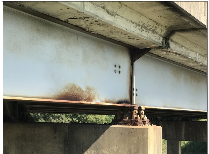
Span1 at bent 2, beam 5 has deep pitting to upper web and lower flange.