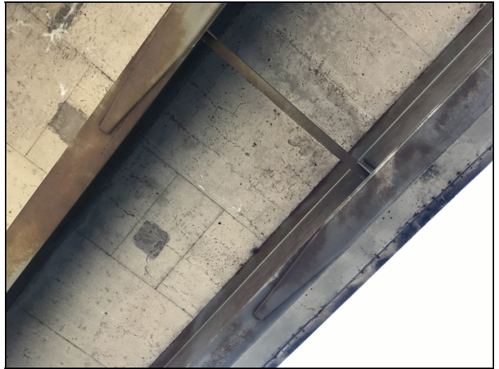
Span 2 delam between beams 1&2 over eastbound traffic off ramp.