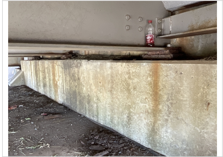
Bent 1 typical bearing condition