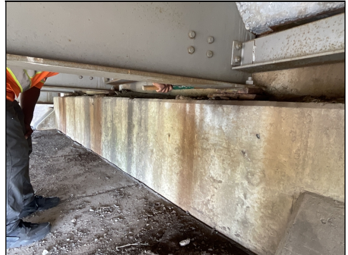
Bearings at bent 5