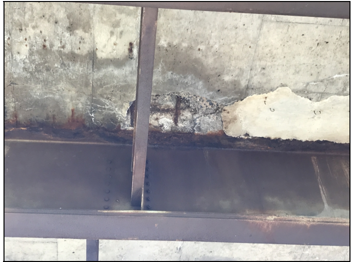
Delams over traffic in westbound fast lane between beams 3&4.