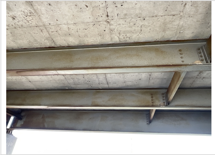
Typical paint condition