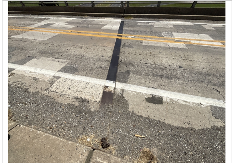
Bent 2 joint