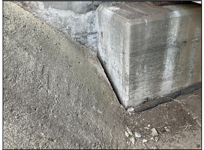
Bent 5 abutment has erosion hole under slope paving 6' deep at point of measurement