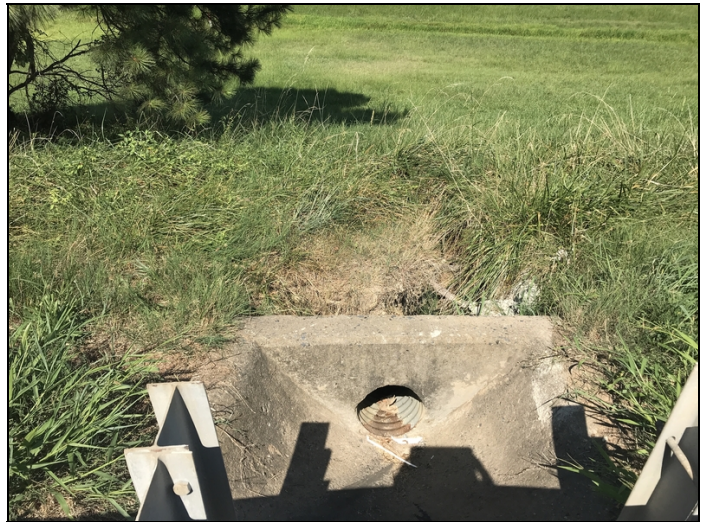
Northwest end of bridge has 5' hole at approach slab drain.