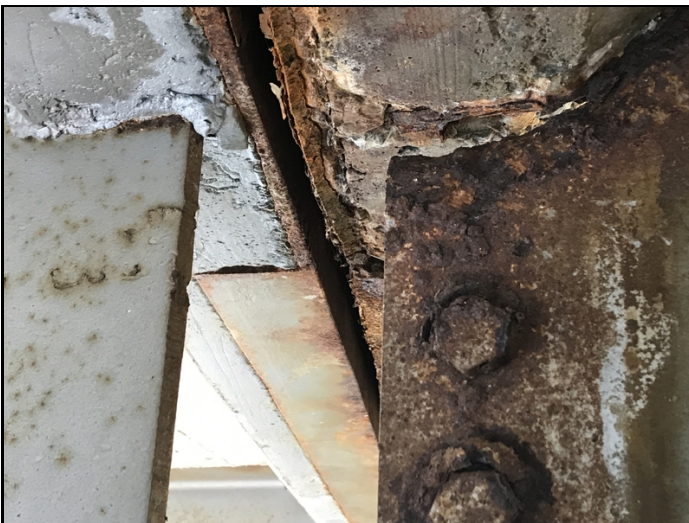
Span 1 beam 2 at bent 2 has a 5" by 1" hole in web under haunch

Span 1 beam 2 at bent 2 has a 5" by 1" hole in web under haunch Span 1 beam 3 at bent 2 has a 6" by 1-1/2" hole in web under haunch Span 2 beam 3 at bent 3 has a 1" by 1/2" hole in web under haunch Span 4 beam 3 at bent 4 has a 3" by 1" hole in web under haunch Span 4 beam 4 at bent 4 has a 1" by 1/2" hole in web under haunch