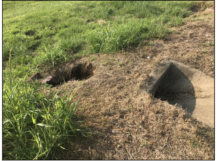
Southwest end of bridge has 3' hole at approach slab drain.