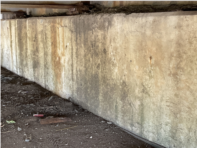
Horizontal cracks in the abutment at bent 1