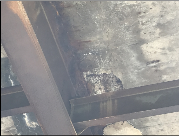
Delams over traffic in westbound fast lane between beams 3&4