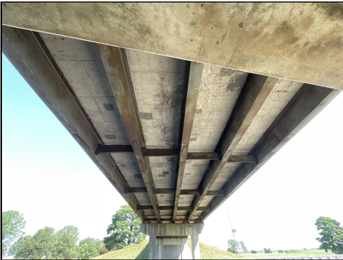
span 2 soffit