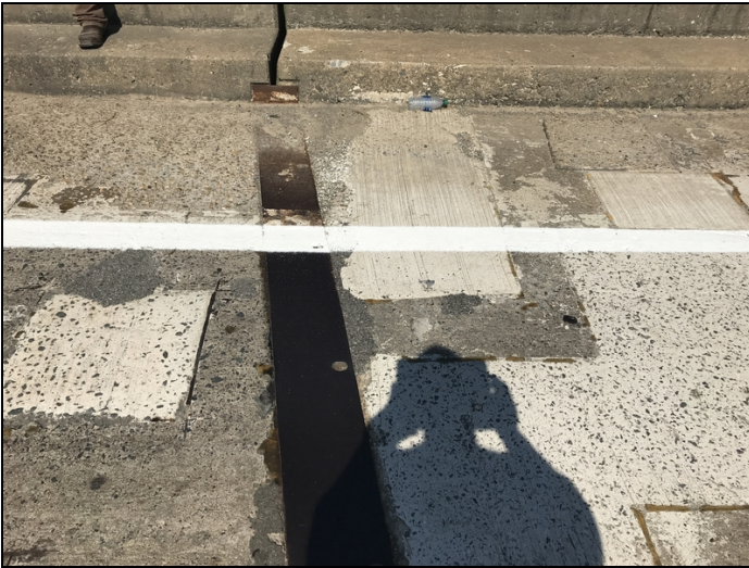
Span 4, left curb with a large spall near bent 4 joint