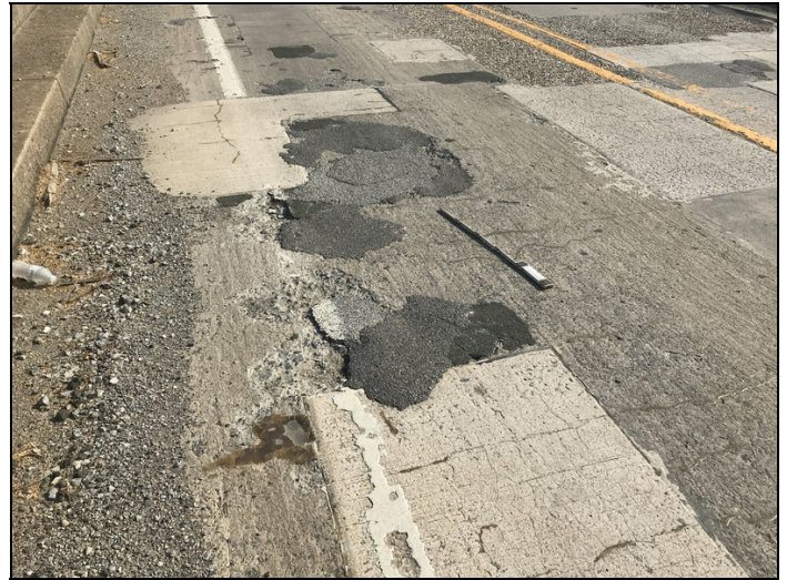
Span 2 large spalls filled with asphalt