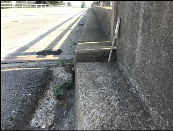
North approach has settled over 4"

South approach has settled over 4". The north approach has also settled approx. 2.5".