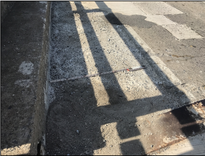
Span 1, right shoulder: previous patch is deteriorating