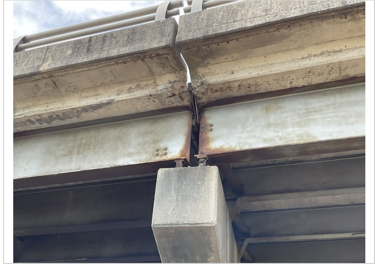
Spall with rebar bent 4 at beam 5