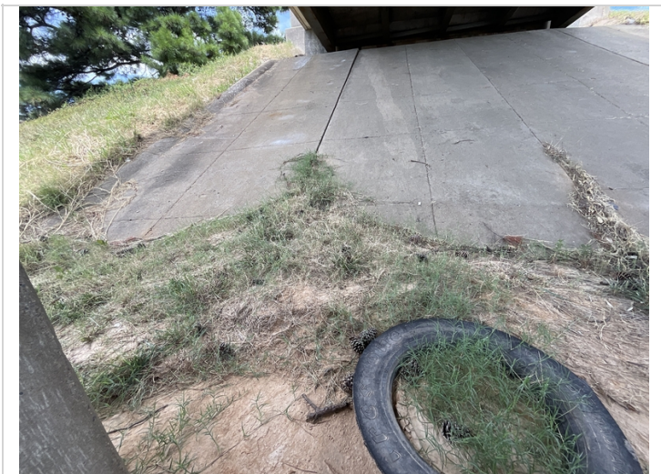
Spillage from erosion at bent 5 accumulation around bent 4 columns