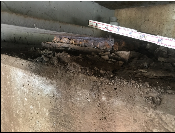
Bent 5, girder 4: typical condition of bearings throughout the bridge