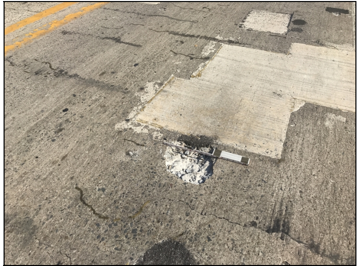
Span 4, right lane: open spall