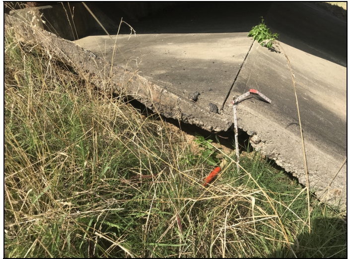
Slope paving undermined on the south end