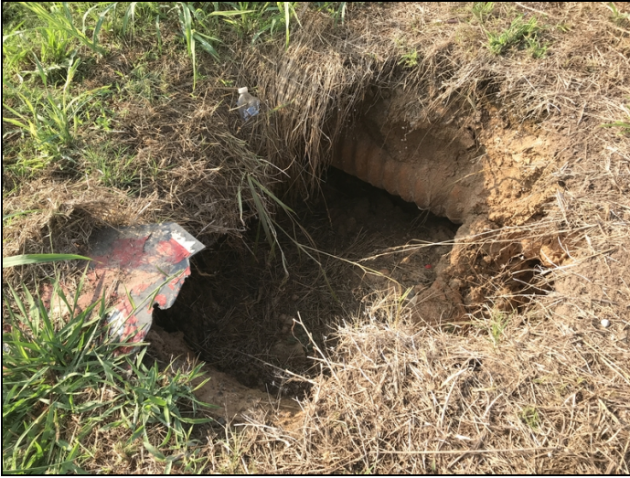
Southwest end of bridge has 3' hole at approach slab drain.