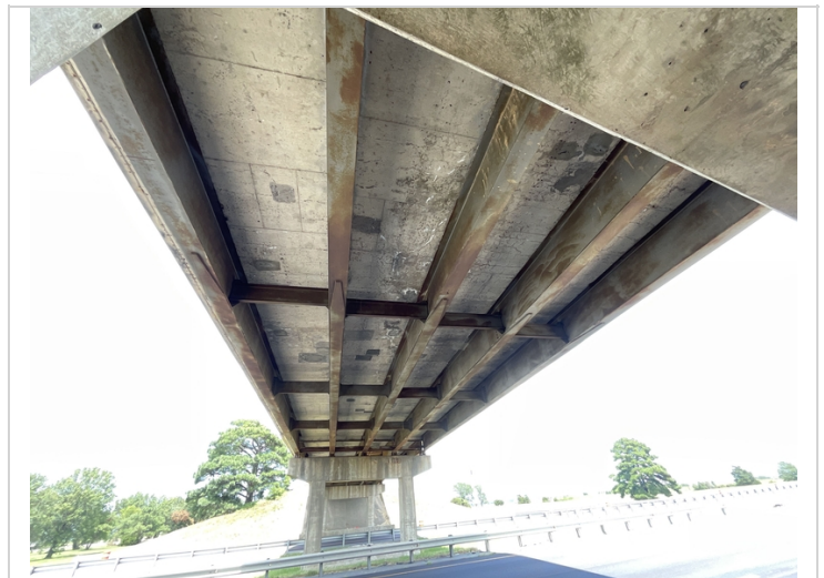
Soffit span 2 has cracking with efflorescence