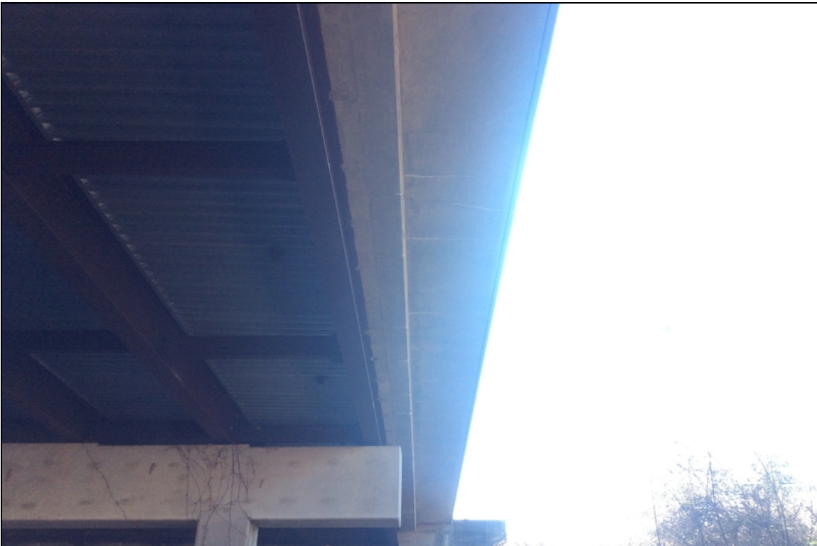
Efflorescence cracking on soffits.