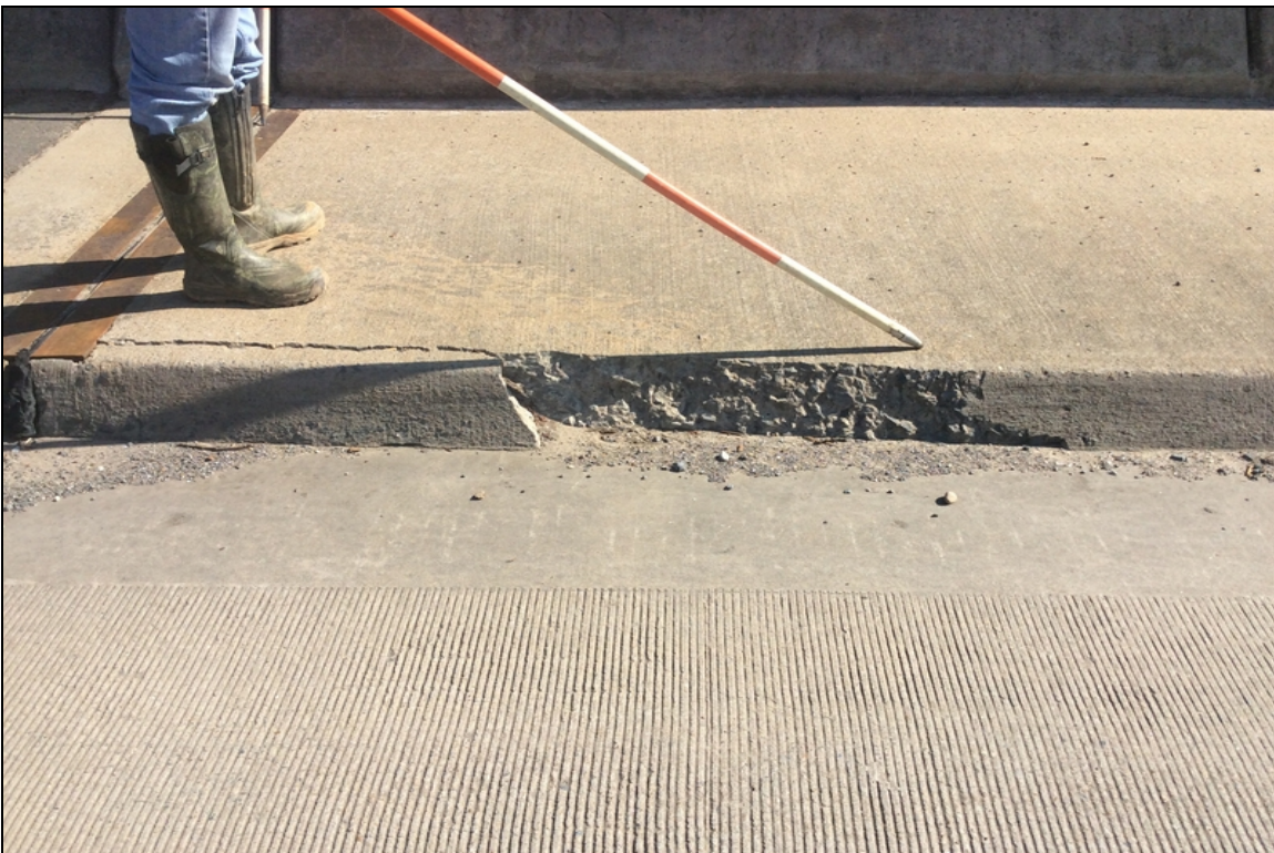
Spall in curb right side.