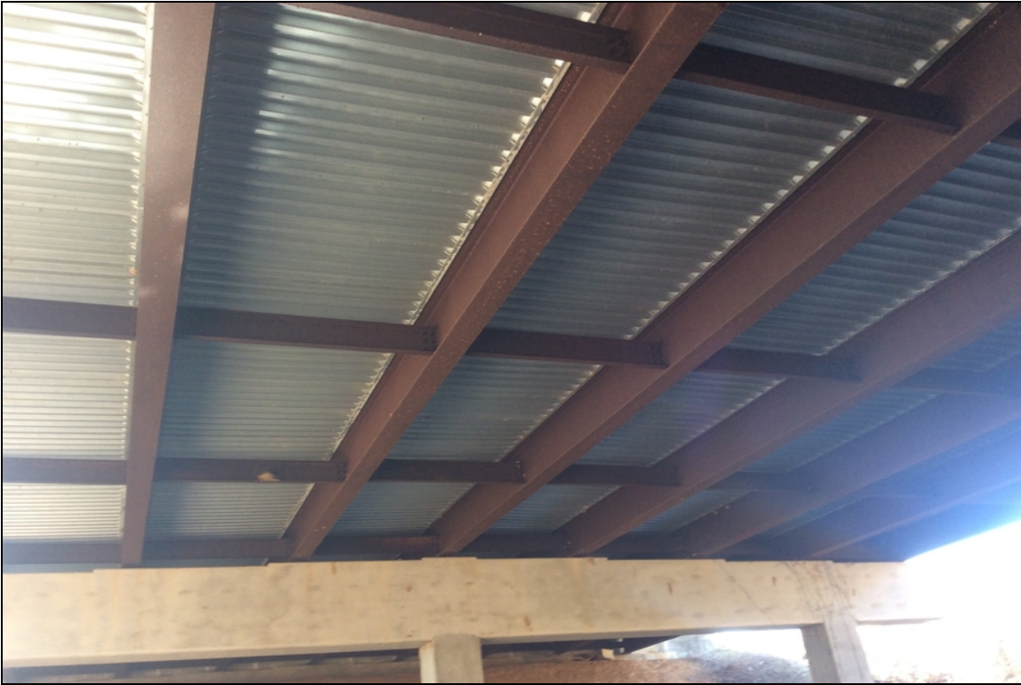
Typical condition of undersurface.