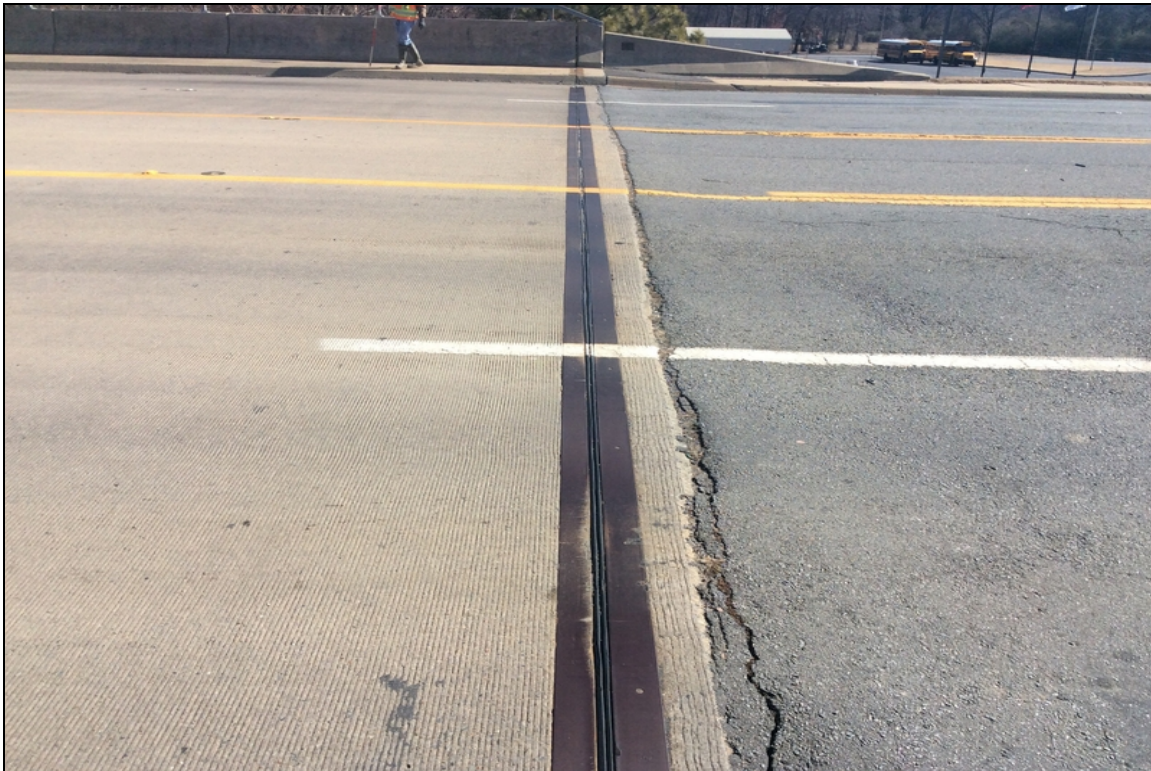
Compression seal joints at bent 1.