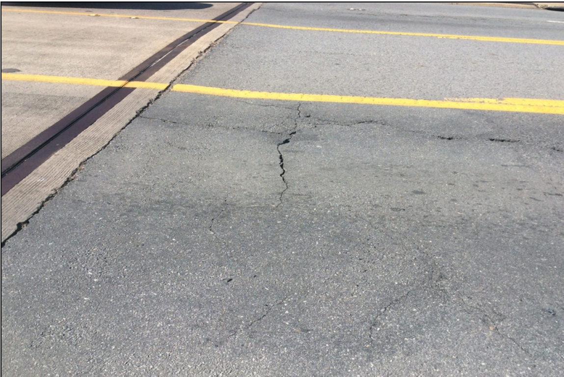
Settlement in asphalt approach north end.