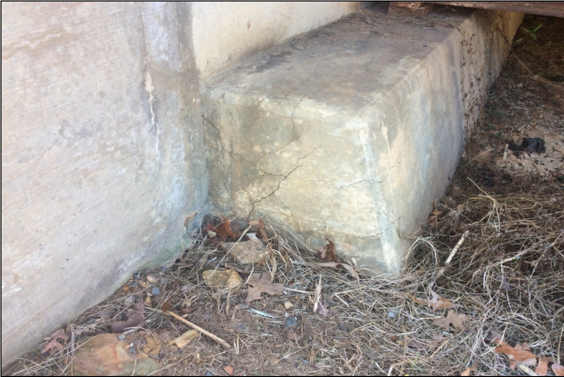
Bent 1 right side.