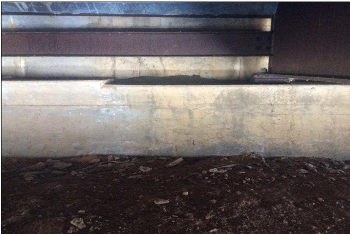
Bent 4 horizontal cracks full length of abutment.