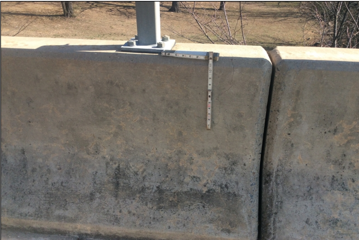
Vertical and horizontal cracking in concrete bridge rail.