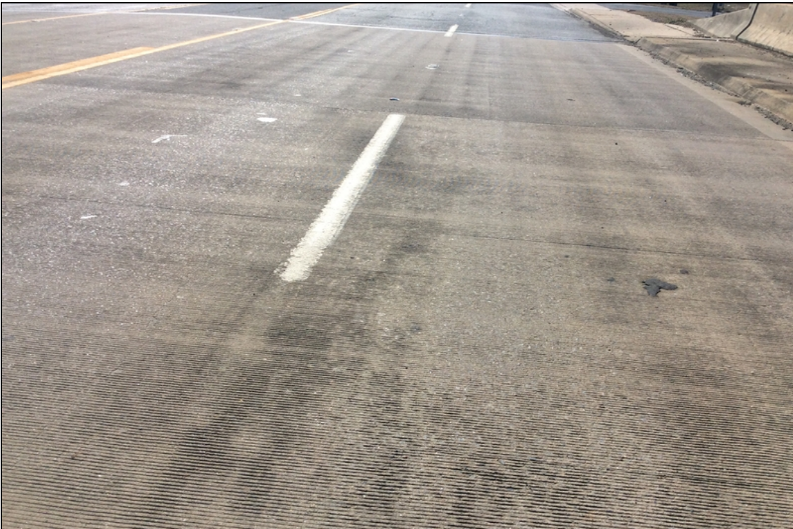
Span 1 longitudinal cracking.