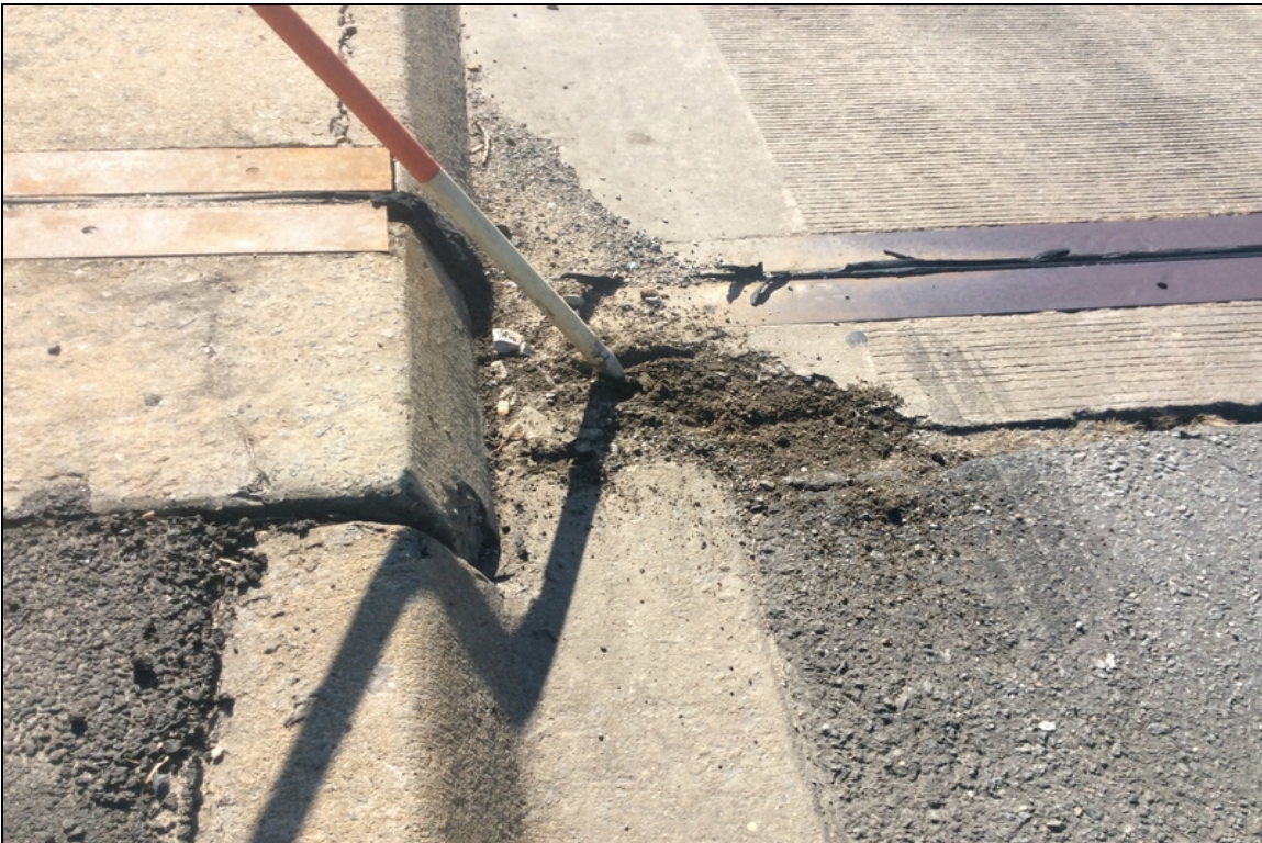
Spall in top of back wall right side north end.