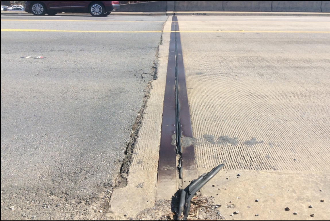
Bent 4 compression joint seal damaged.