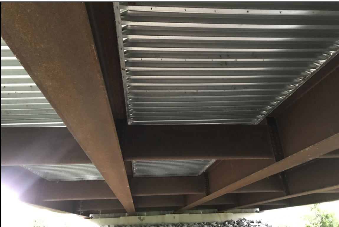
Underside of deck