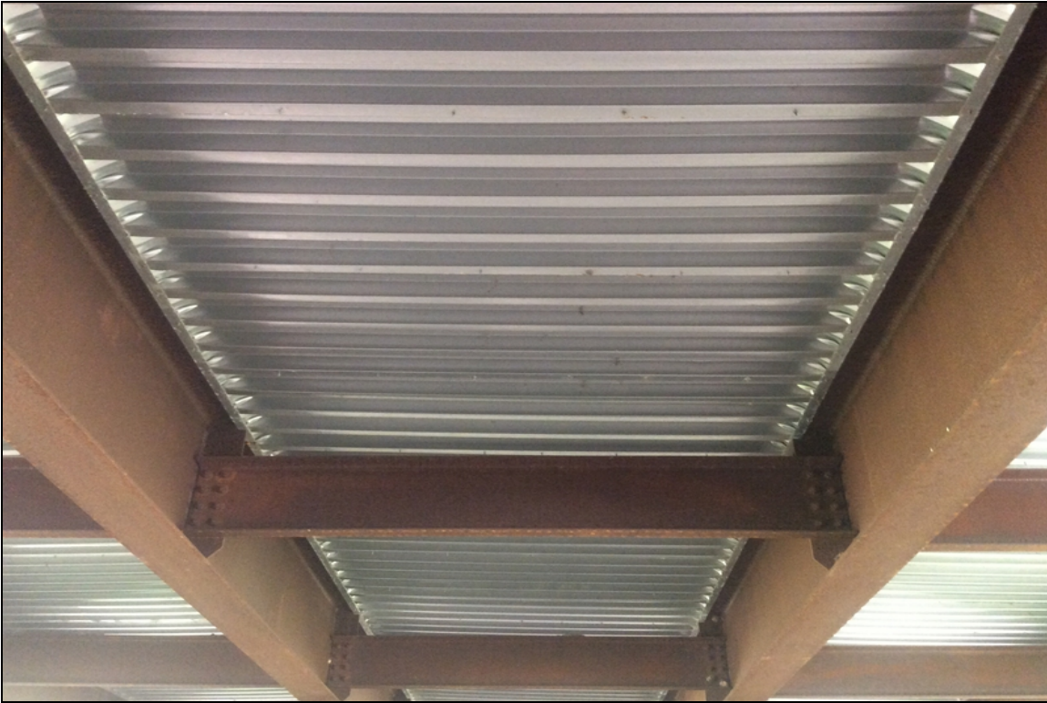
BOTTOM OF DECK TYPICAL ALL SPANS