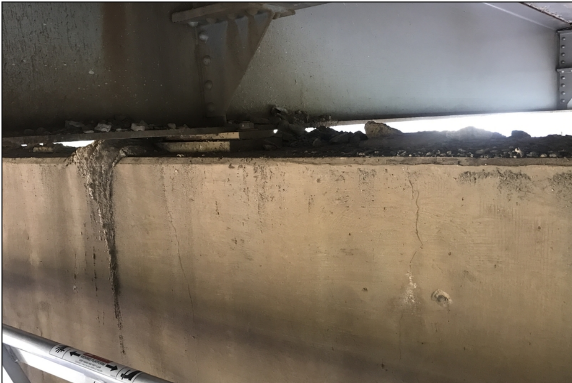
Concrete and debris on cap at bent 7