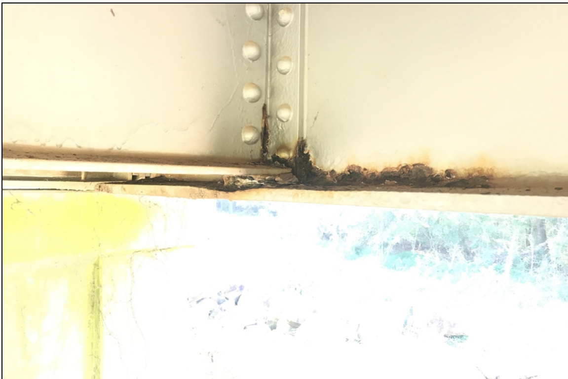
Span 5 Beam 4 at diaphragm connection typical of all