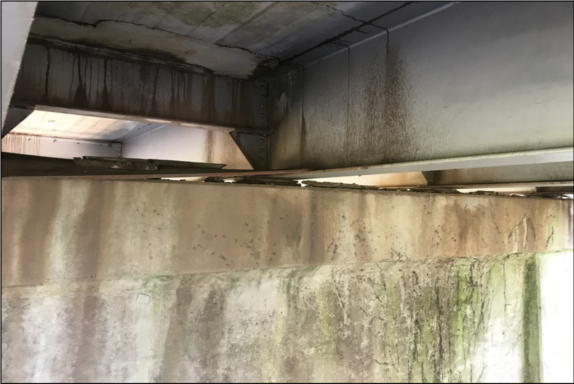
Concrete and debris on cap at bent 5