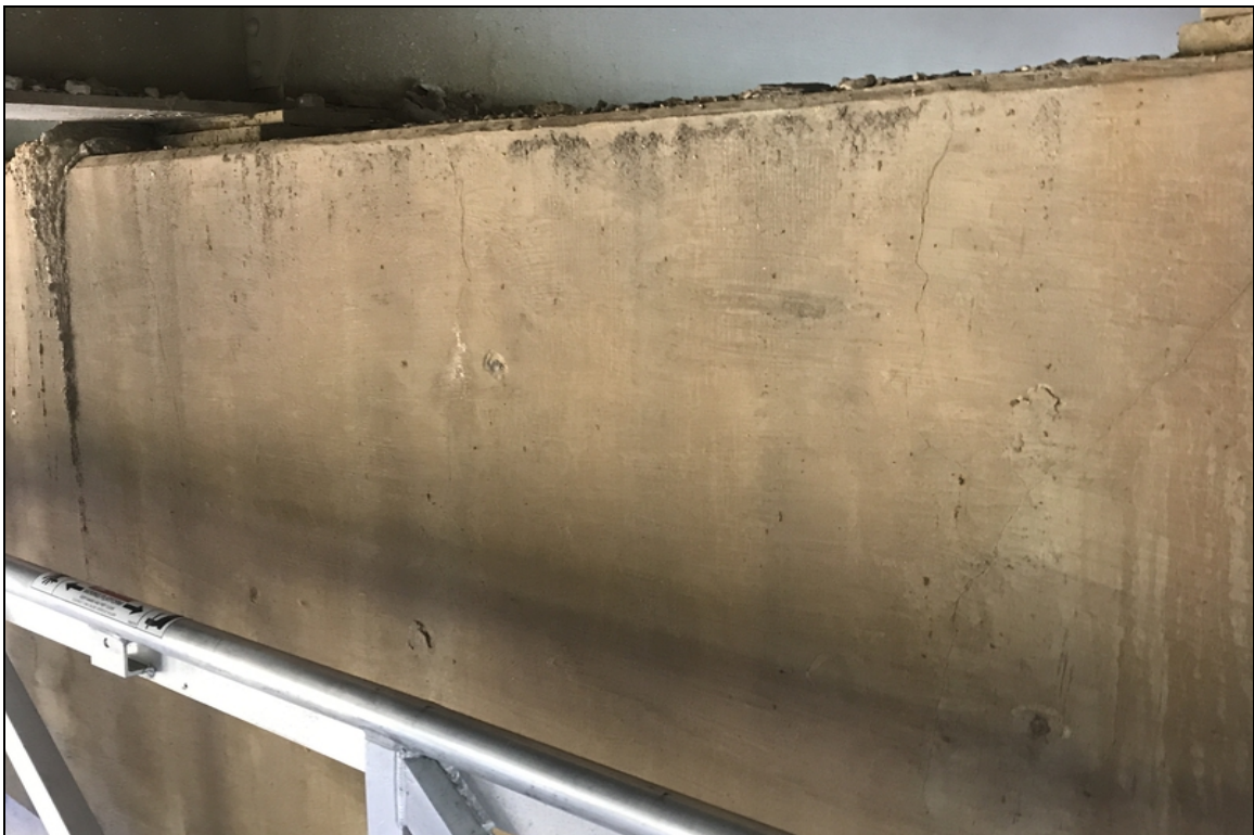
Cracks in concrete cap at bent 7