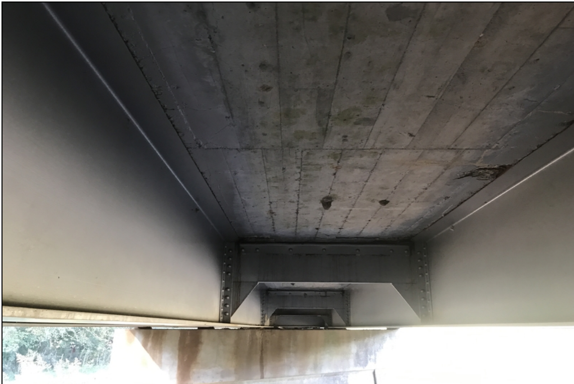
Bottom of deck typical all spans