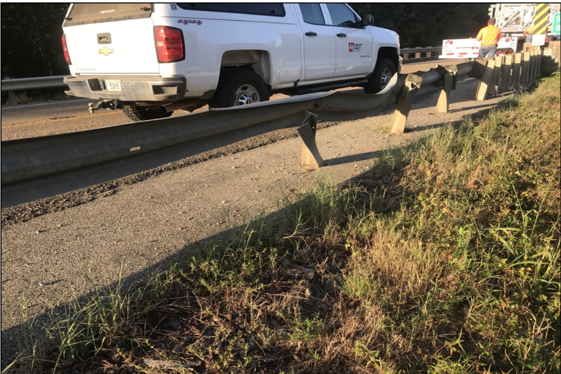
Guard rail damage right side end of bridge