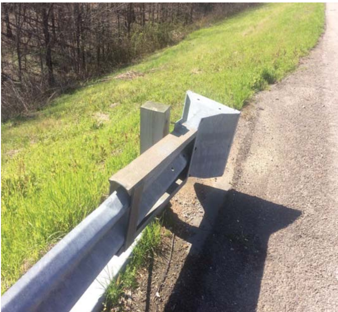
PHOTO 1 Description Approach railing - Bent 1 right: Screw loose in end