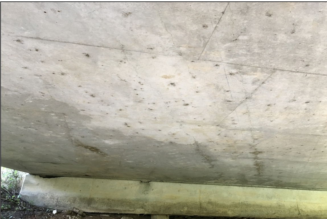
Soffit - Span 3: Cracking/rust-staining