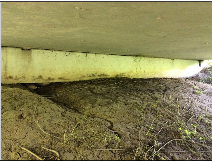
End slope -Bent 1

No action at this time. Continue to monitor and advise if erosion worsens.