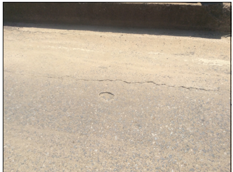
Span 1 near bent 1 right side has large unsealed longitudinal crack.