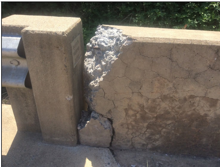
Southeast corner of bridge , guard rail end post has spalls with chloride contamination.

David: Fit into your schedule as time permits