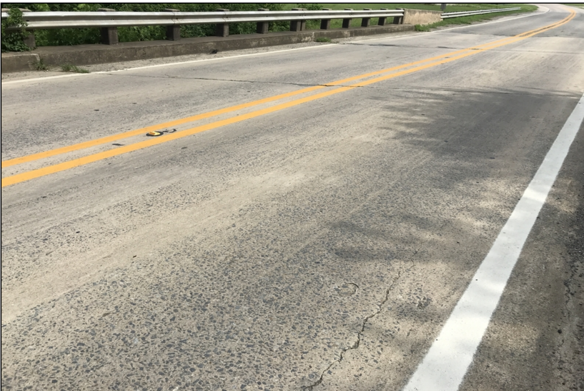
Deck - Spans 1-3: Typical