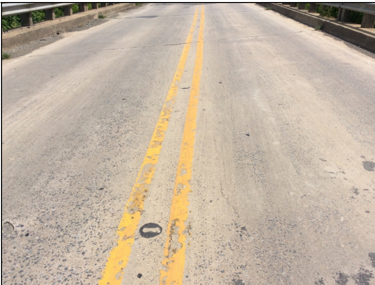
Deck - Span 1