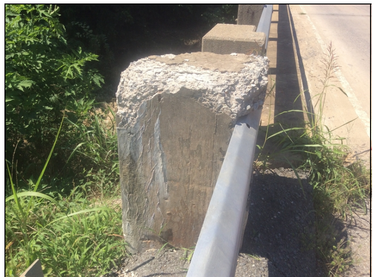
Southeast corner of bridge, guard rail end post has spalling with heavy chloride contamination..