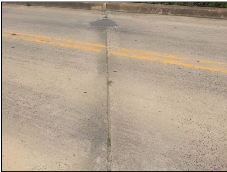
Bent 3 joint seal filled with dirt and debris. Common all bents.

Clean joints out, and re-pour material into joints