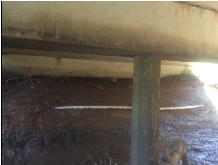
End Slope erosion area under bottom of cap on bent 4 .

07-25-2019 GGL-KLR: Changed priority from "C" to "D".