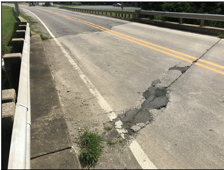
Deck @ Bents 3-4: Spalling/patches