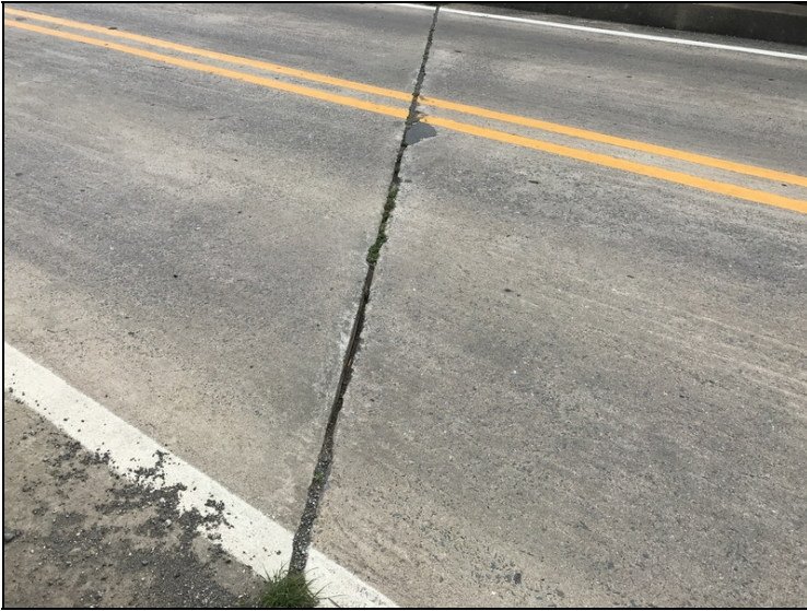
Joint - Bent 2: Material missing/debris filled