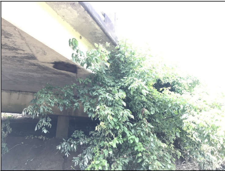
Channel - Bent 2 left: Vegetation