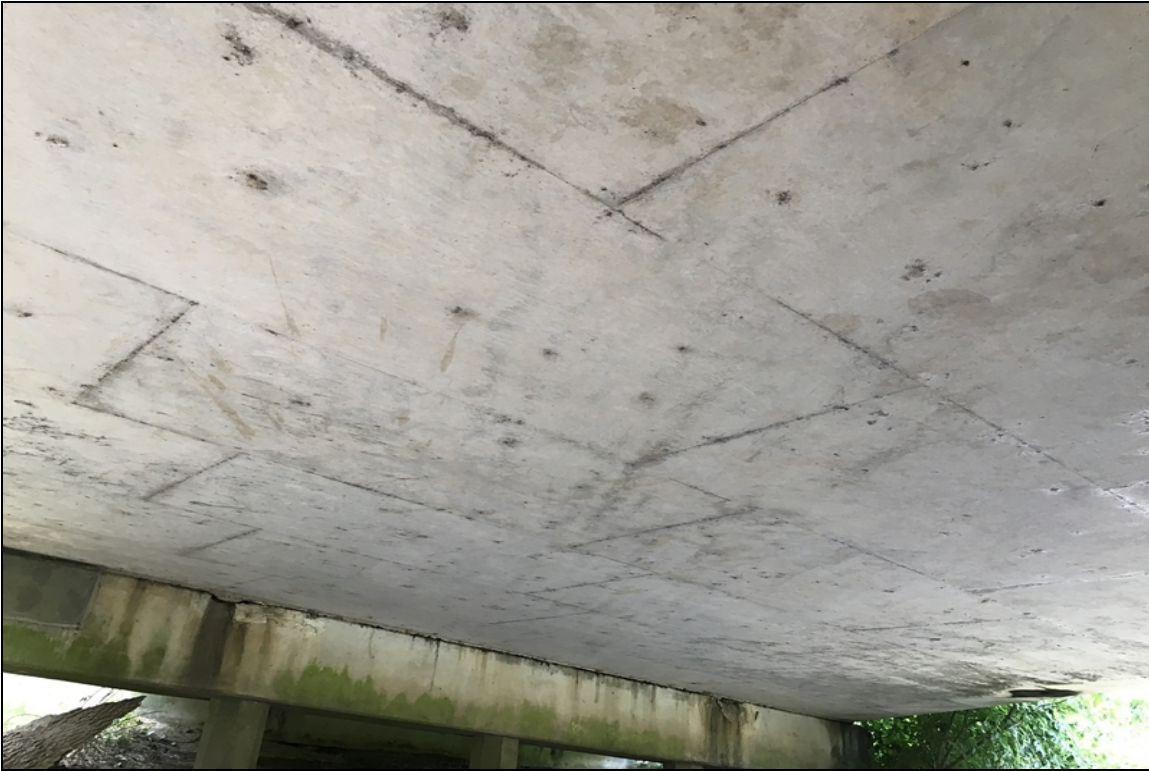
Soffit - Span 2: Typical