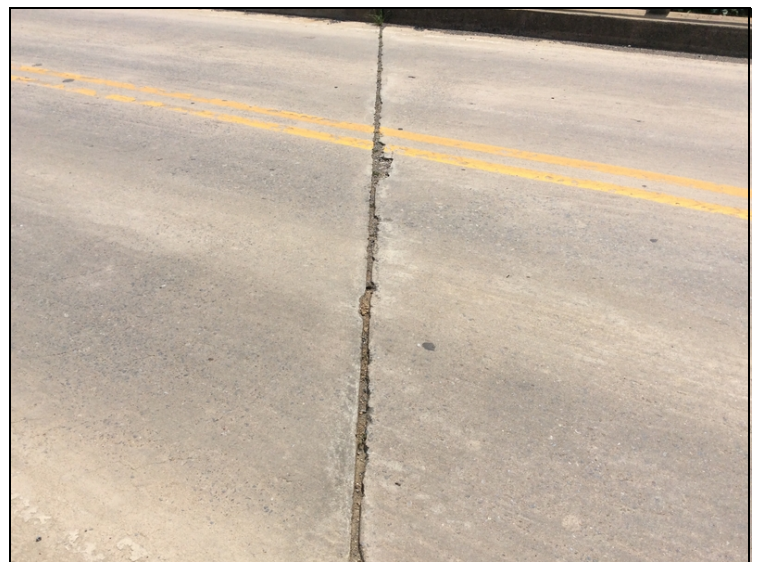
Joint - Bent 2