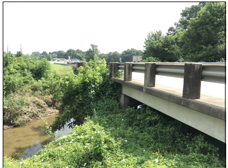
Channel - Bent 2 left: Vegetation