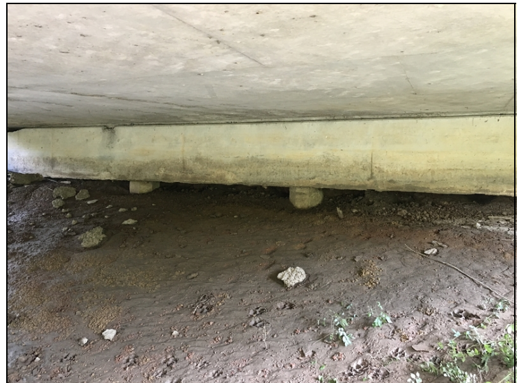
End-slope - Bent 4: Settlement/piling exposed