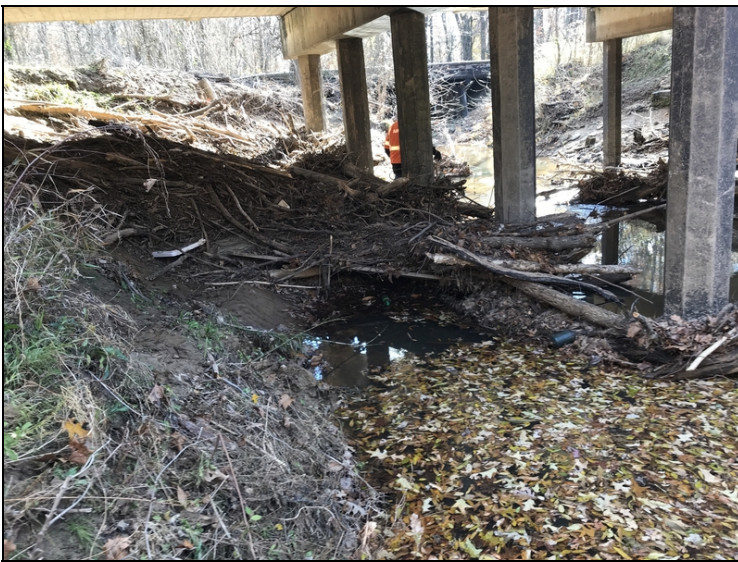
Bent 2 Drift

to Greene Co Crew for removal KAW 2/15/19