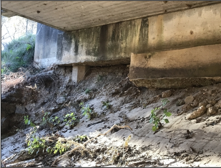
Bent 4 erosion