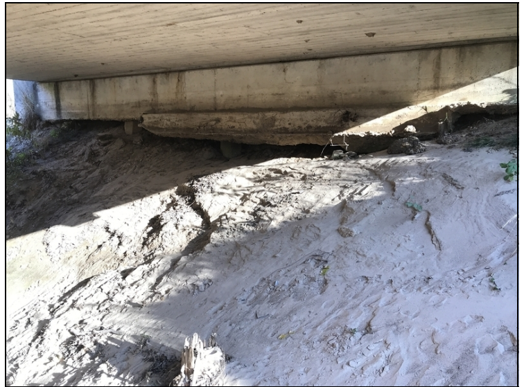
Bent 1 erosion