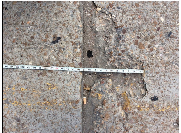
Exposed rebar beginning of span #4 at centerline