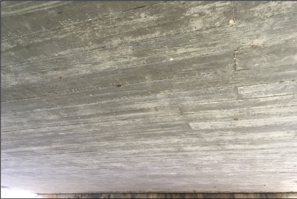
Typical view of undersurface.