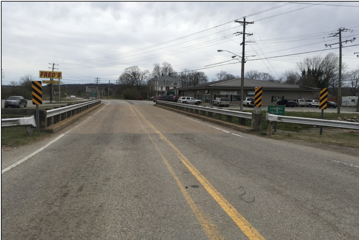
Approach view in direction of log mile.