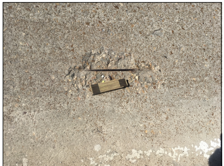
Exposed rebar in span #1 right whiteline