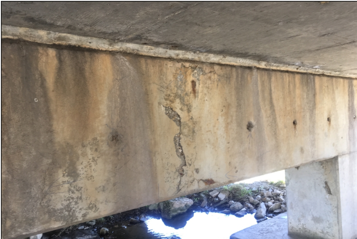
2' area of delamination on the span #3 side of pier cap #3.