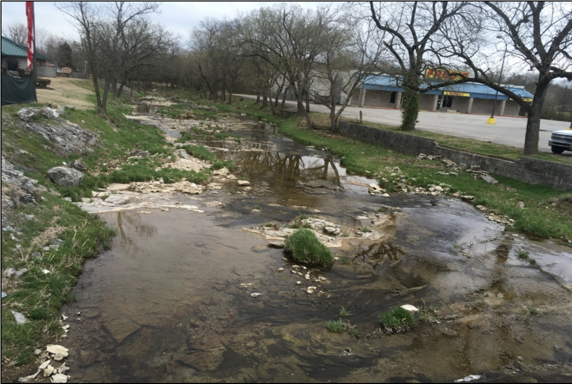
Downstream channel view.