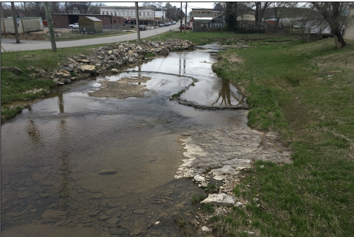
Upstream channel view.