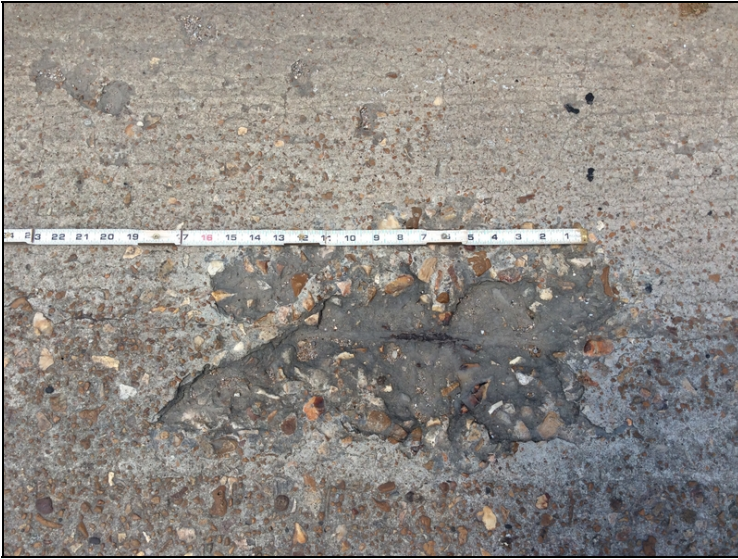
Exposed rebar span #4 at left whiteline