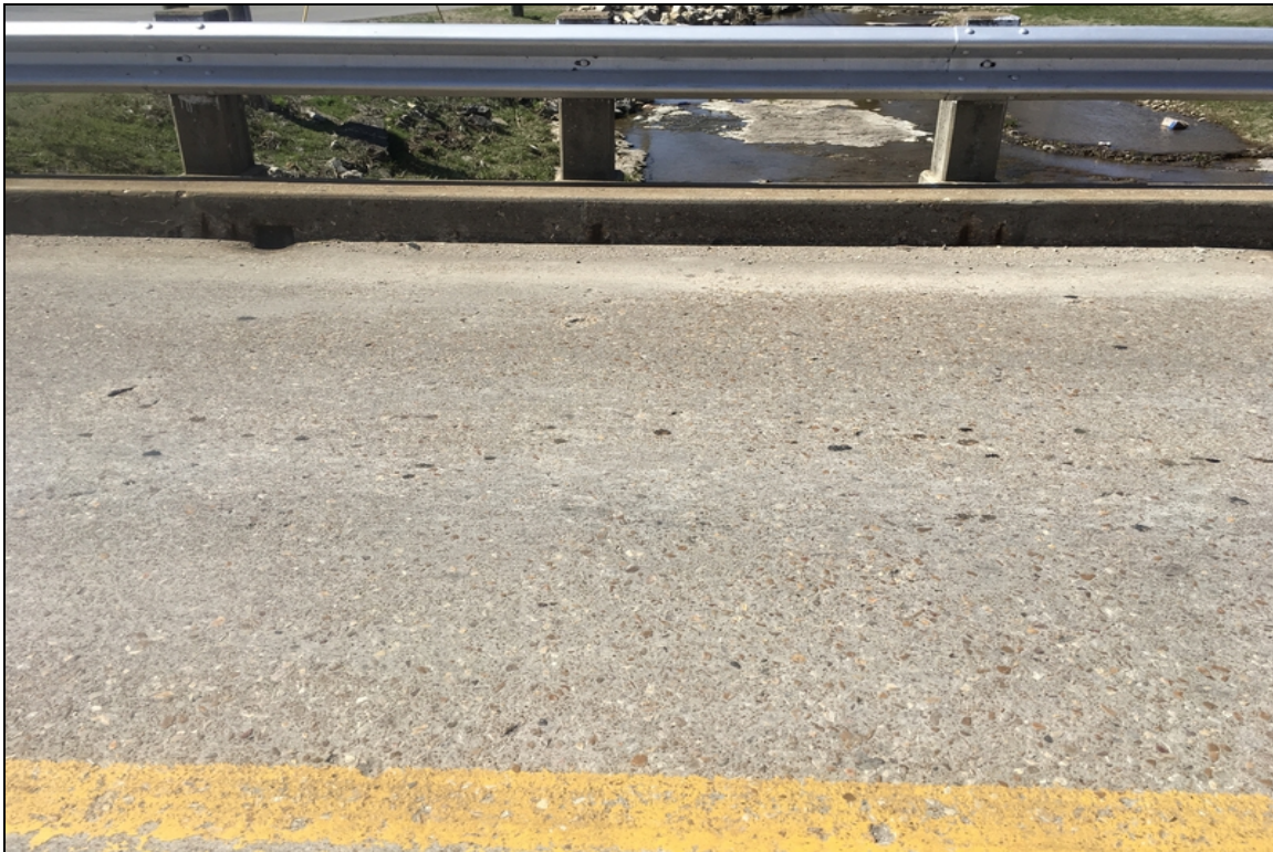
Exposed rebar on the vertical face of the curb.