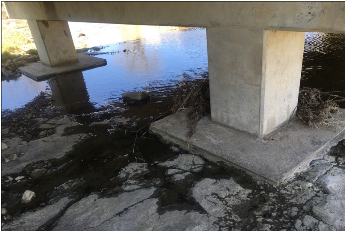
Footings are exposed at all locations, but are cast in solid rock.