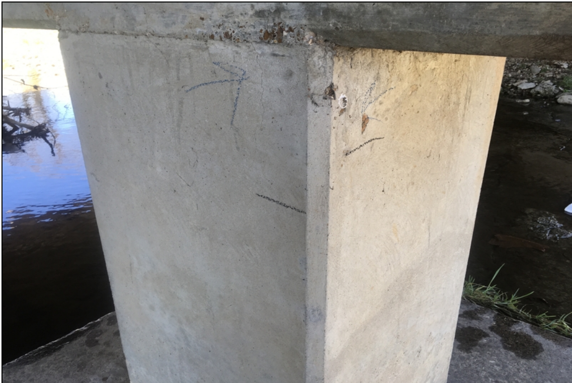
Short duration hairline cracks in the tops of the columns at bent #2.