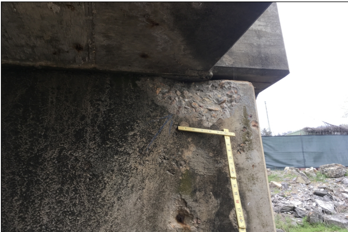
Spall near the left cap end of bent #2 cap on span #3 side.