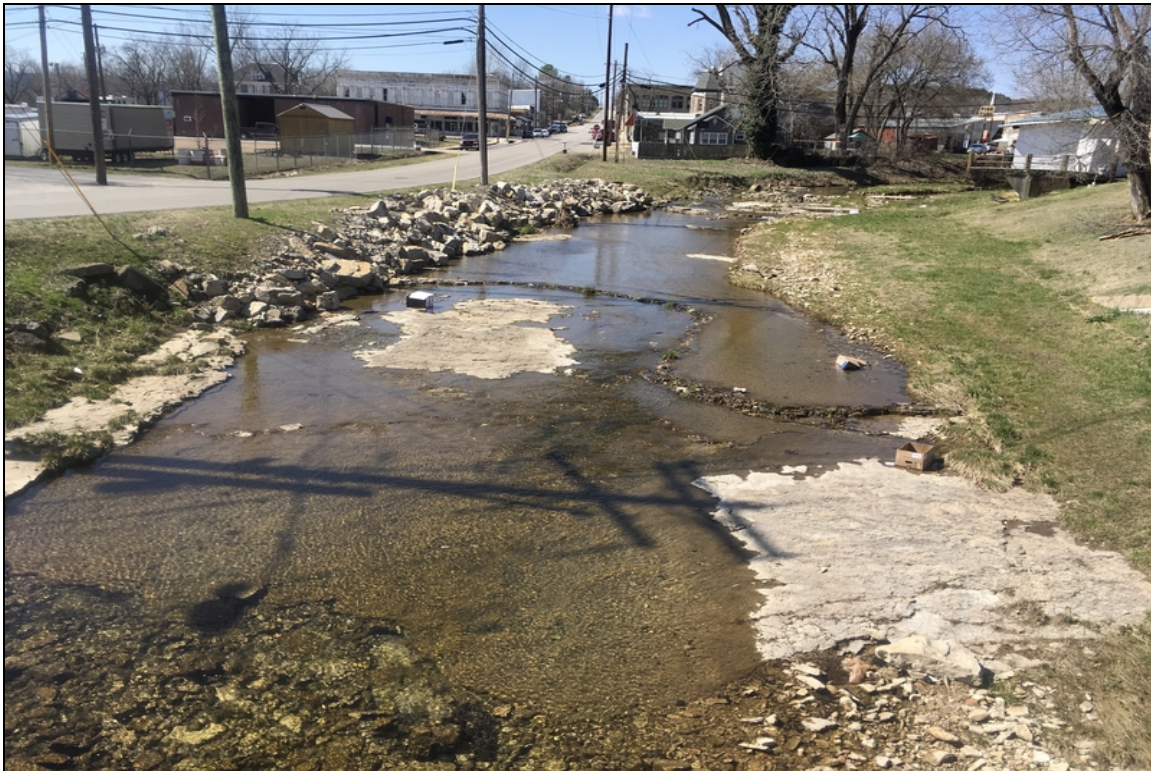
Upstream channel view.