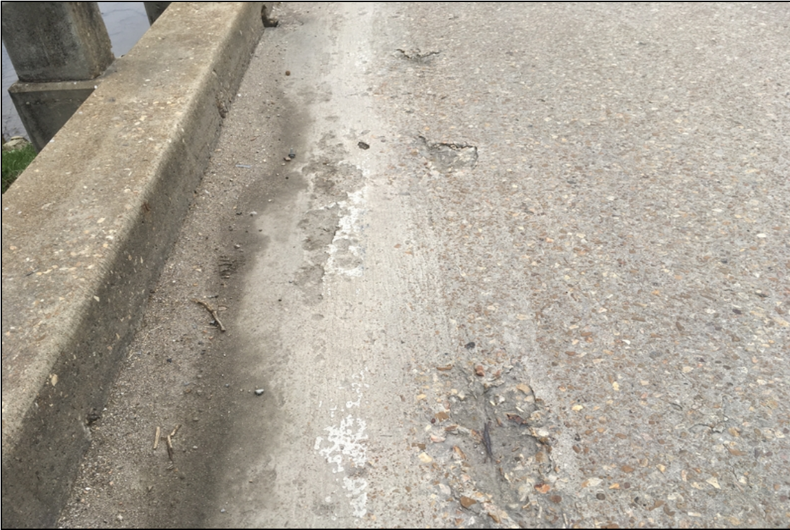
Span #4 has spalling with exposed rebar at the beginning of the span on the center line and at the right gutter line.