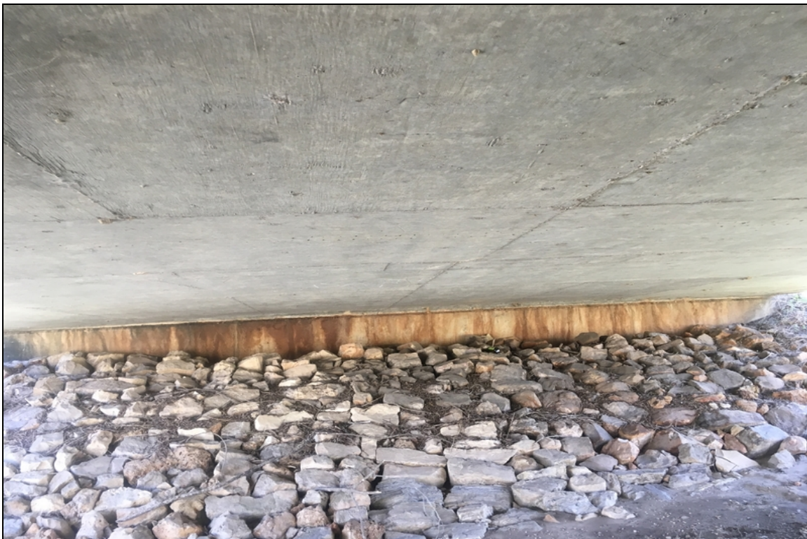
View of abutment #2. Typical.