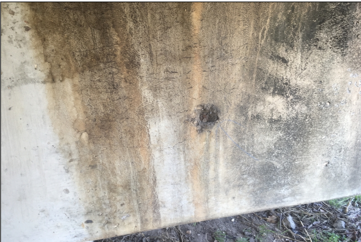
Pop out with rebar exposed. Typical.