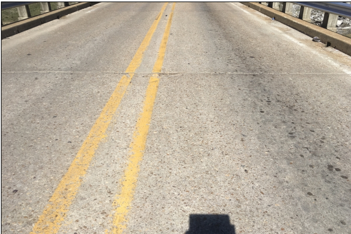
Typical view of driving surface.