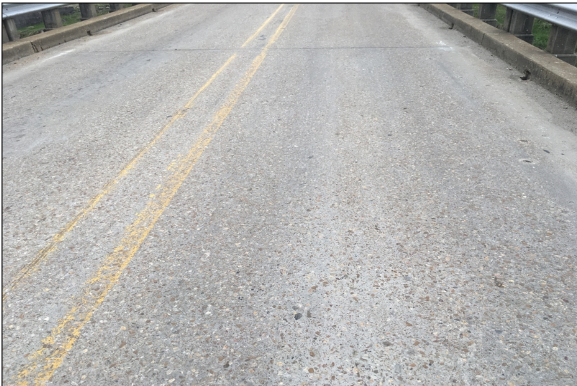
Typical view of driving surface.