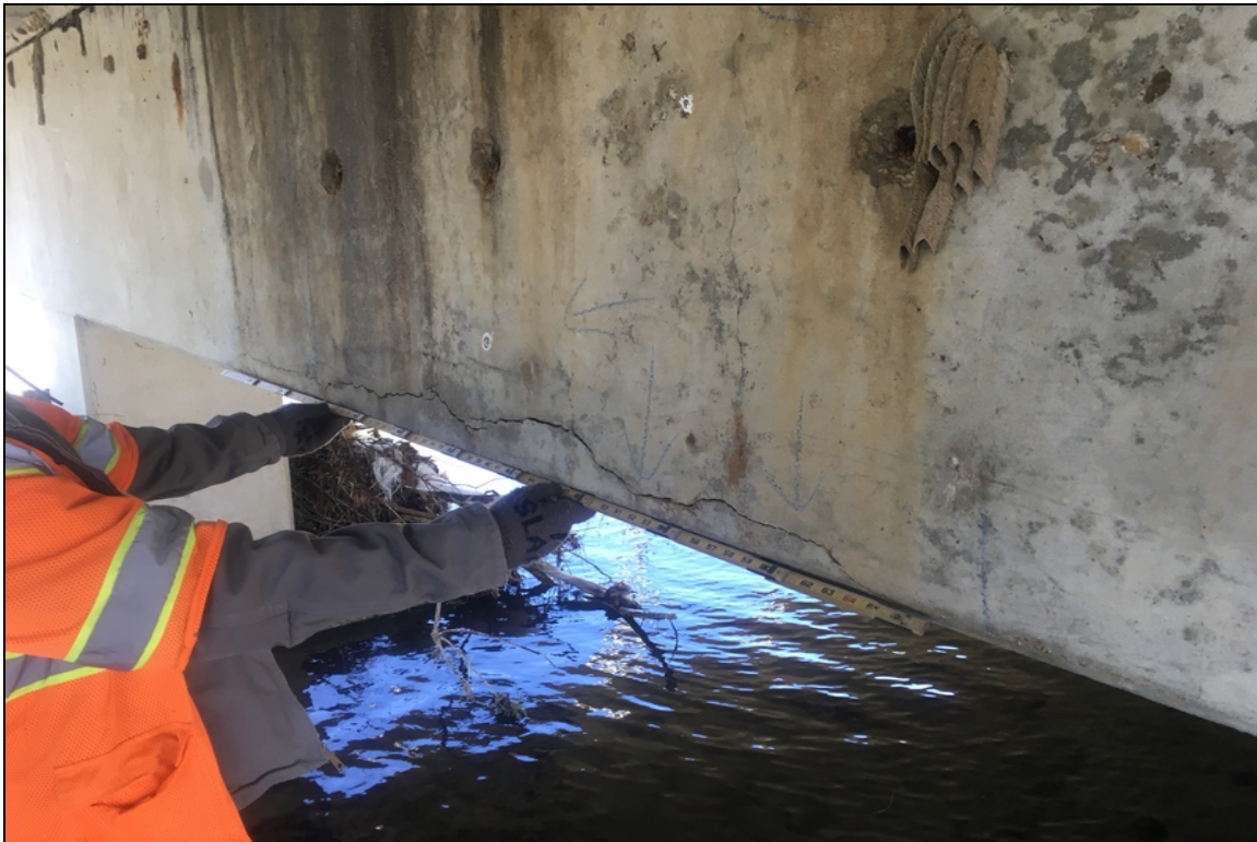
5' long delamination on the bottom edge of pier cap #2 on the span #3 side.