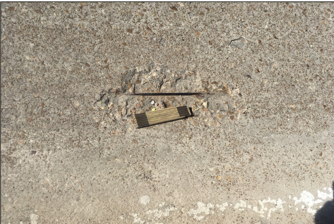
Spall with rebar exposed in left driving lane of span #1.