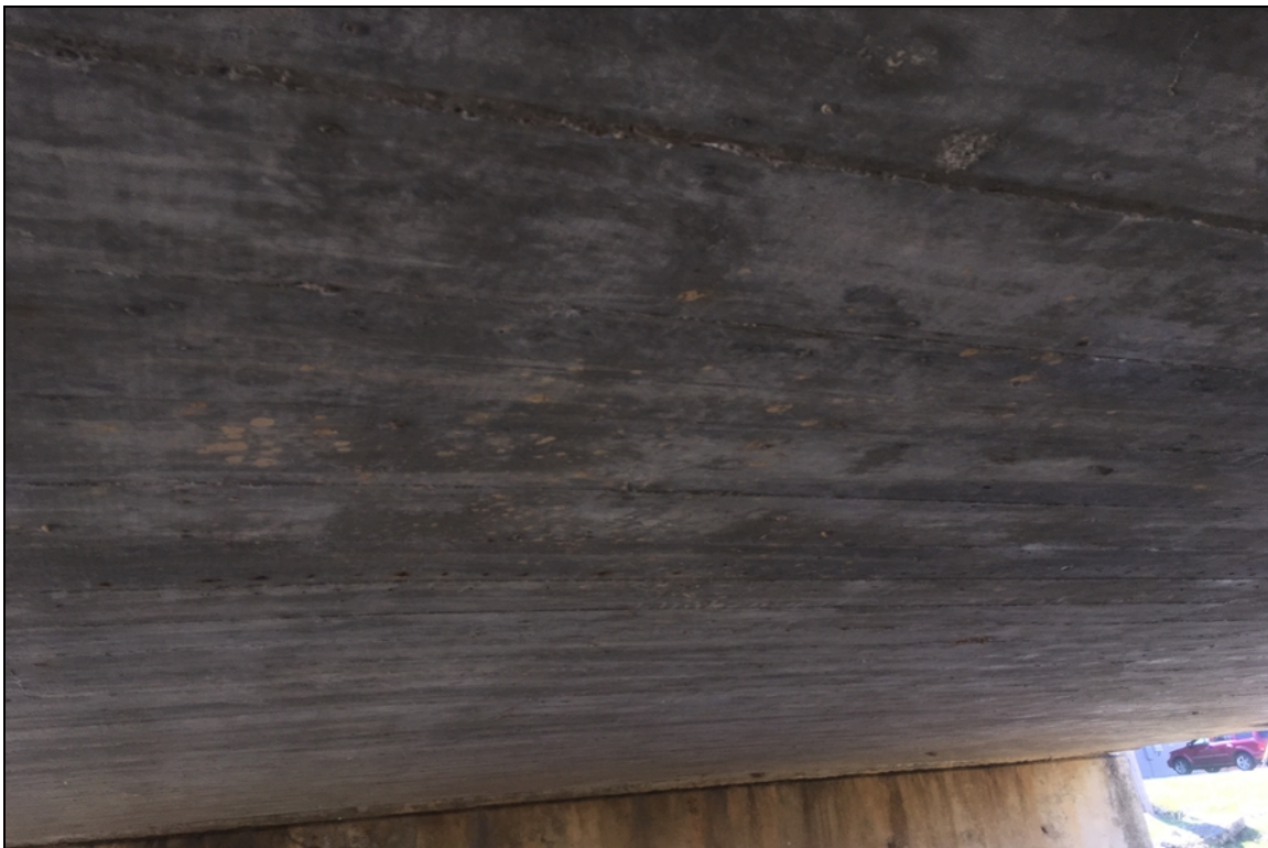
Typical undersurface view of all spans.