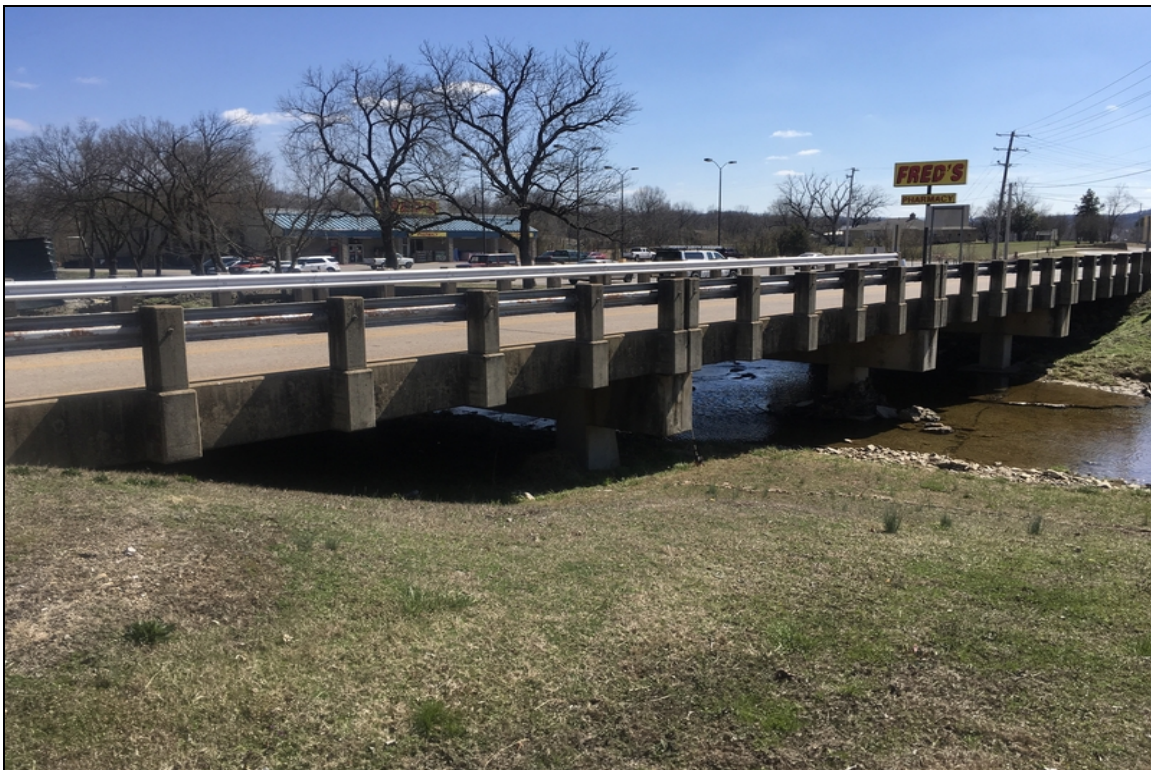
Elevation view. Log mile from left to right.