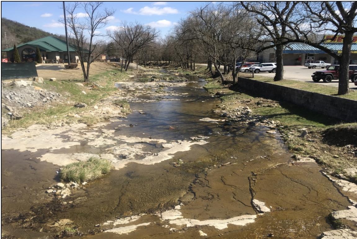
Downstream channel view.