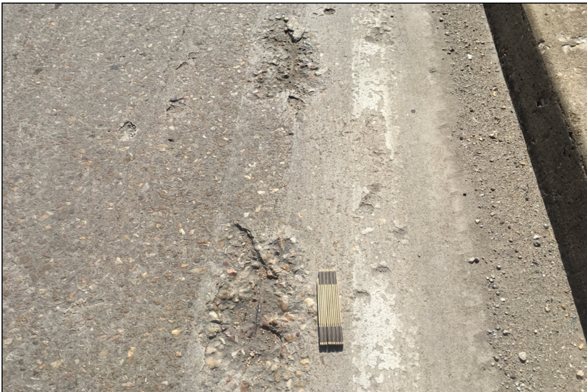
Spall with rebar exposed in right driving lane of span #4.