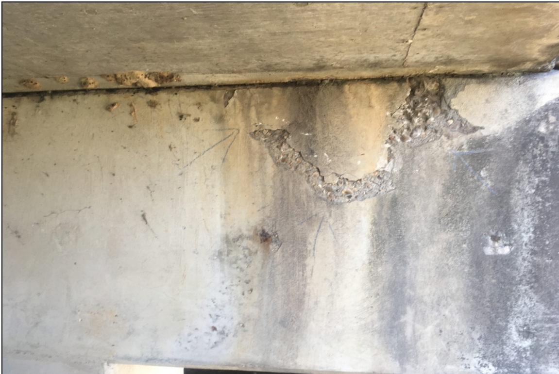
2' area of delamination on the span #4 side of pier cap #3