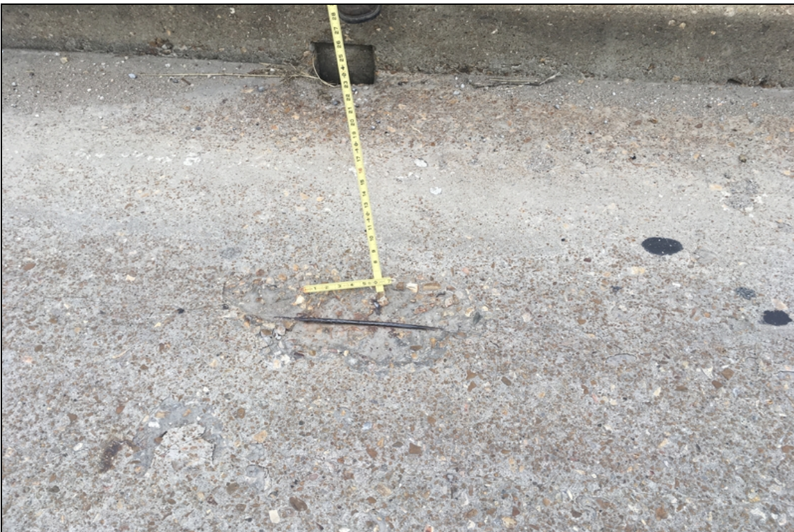
Exposed rebar in the left driving lane of span #1.