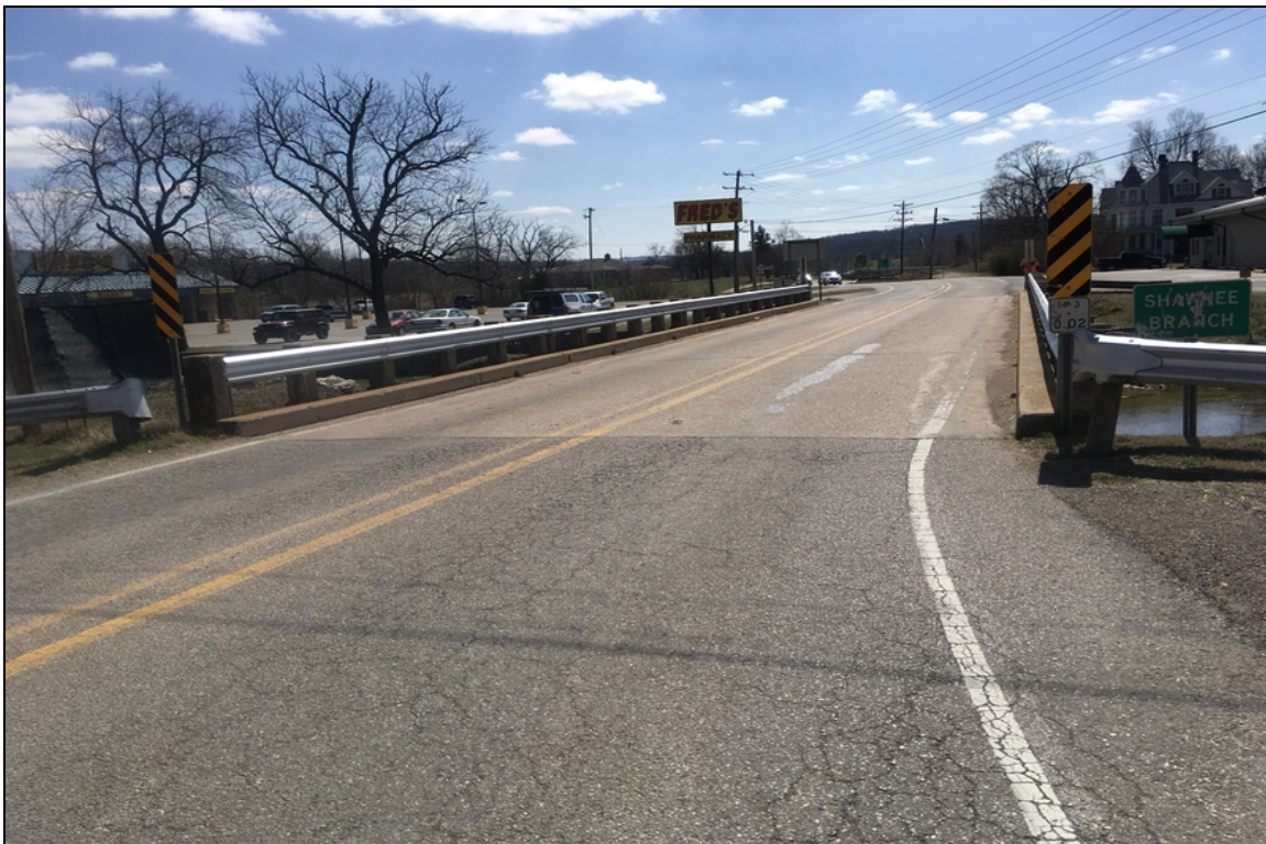
Approach view in direction of log mile.