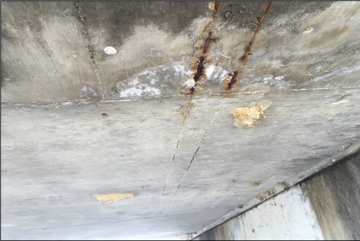
Shallow exposed reinforcing wire in the bottom of the slab. Typical of several locations.