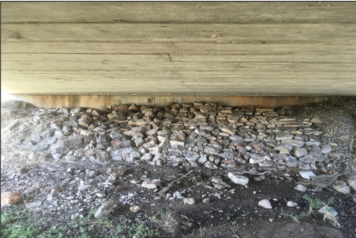
View of abutment #2.