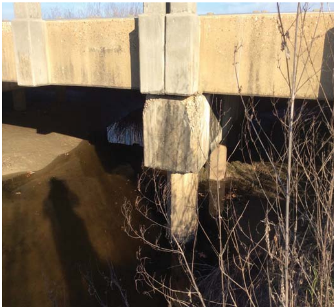
PHOTO 1 Description Bent 3 cap right end