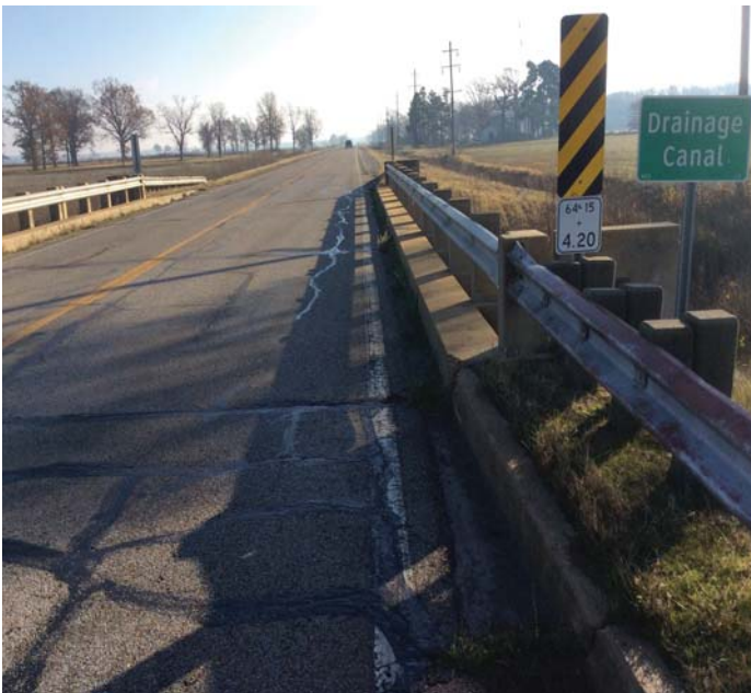
PHOTO 1 Description Vegetation is growing in gutters.