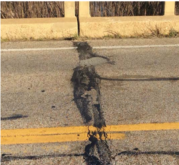
PHOTO 1 Description Span 1 pot hole repair.