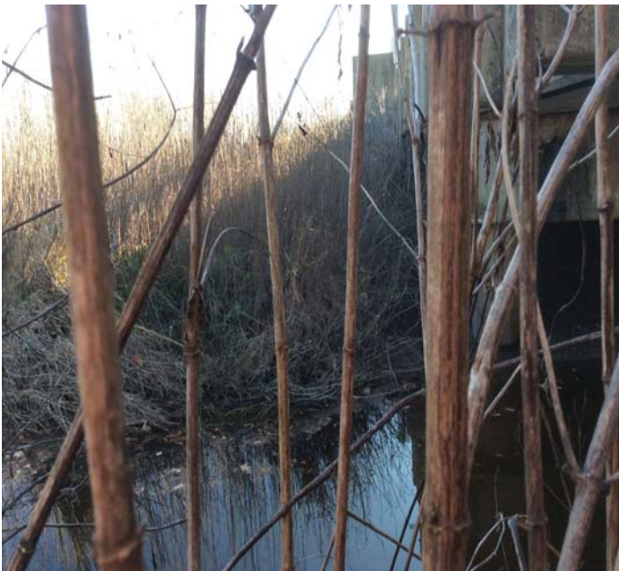
PHOTO 1 Description Typical vegetation