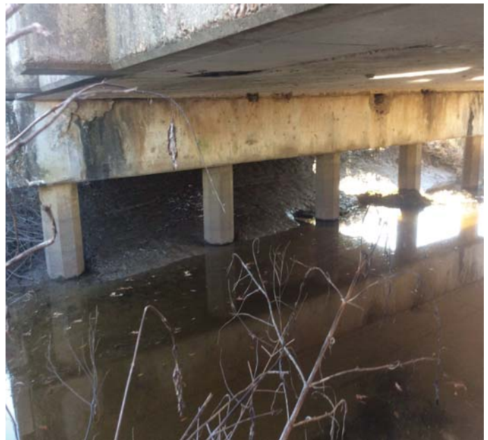
PHOTO 2 Description Bent 3 back face