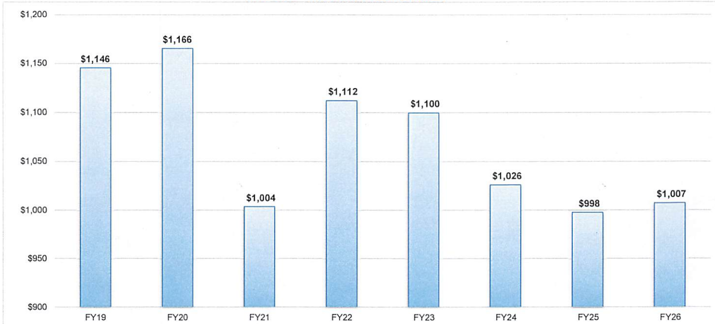
TIMBER SEVERANCE TAX COLLECTIONS EXPRESSED IN THOUSANDS YTD JULY THROUGH SEPTEMBER